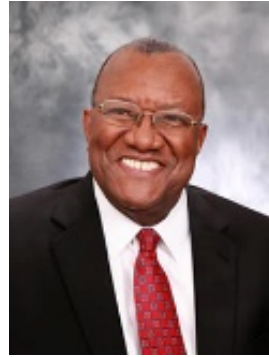
Honorable Willar Hightower Councilmember, District 8