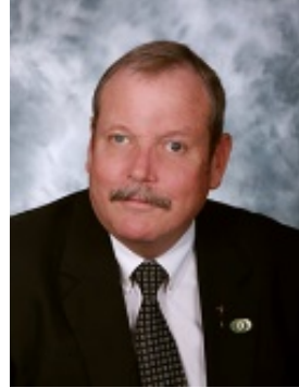
Honorable Sandy Haskell Councilmember, District 5