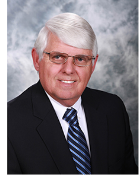
Honorable Philip Napier Councilmember, District 6