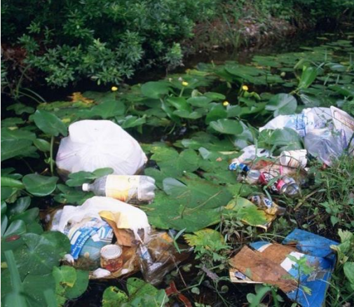
Photo courtesy of ( @Wikipedia.org ) - granted under creative commons licence – attribution