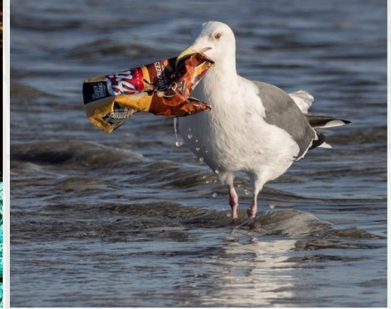
Photo courtesy of ( @flickr.com ) - granted under creative commons licence – attribution