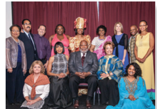
MACC Board of Directors