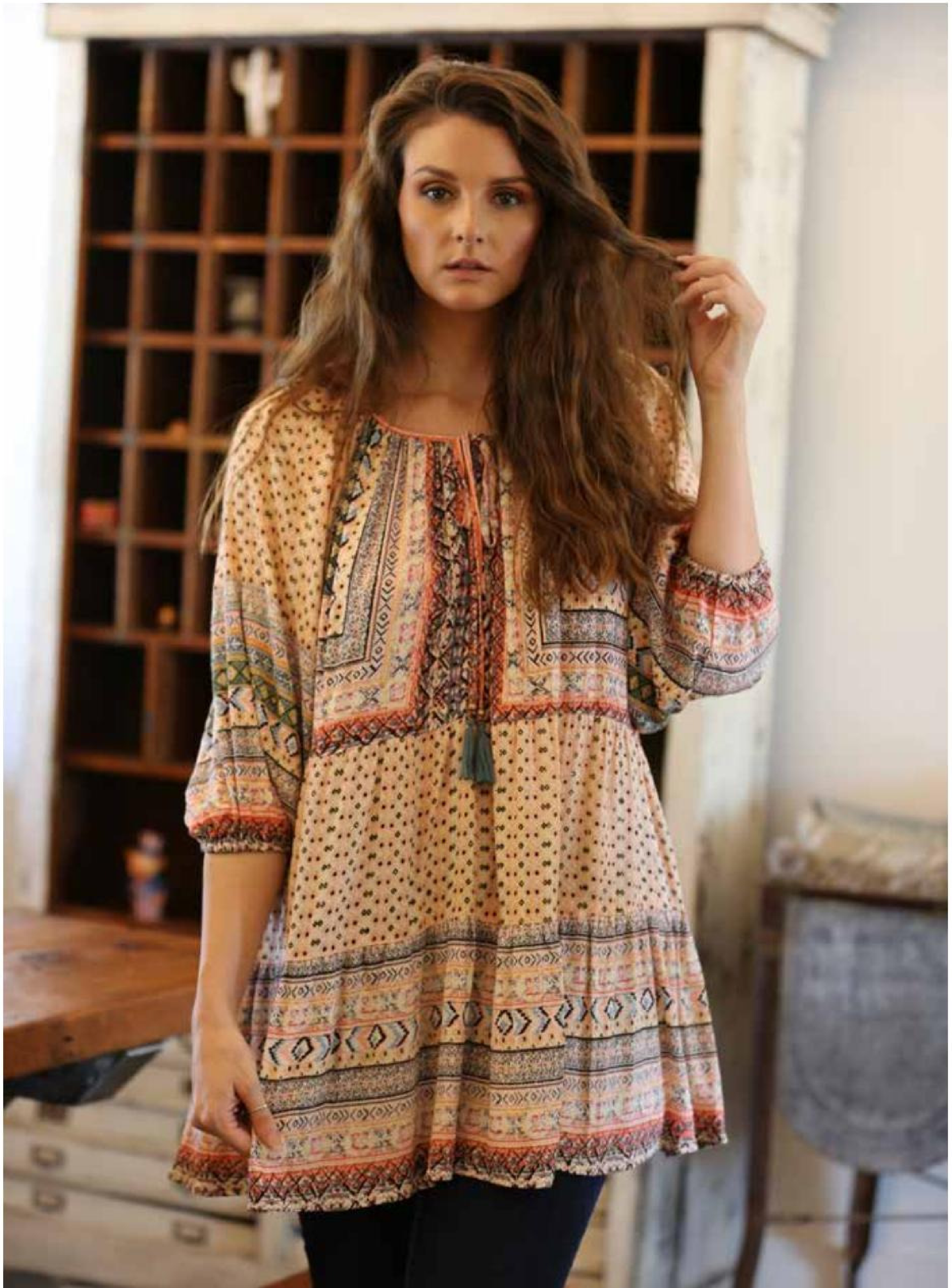
F9568 FP52 Multi, Long sleeve top with front tie at collarbone. 3/2/1, $19.50