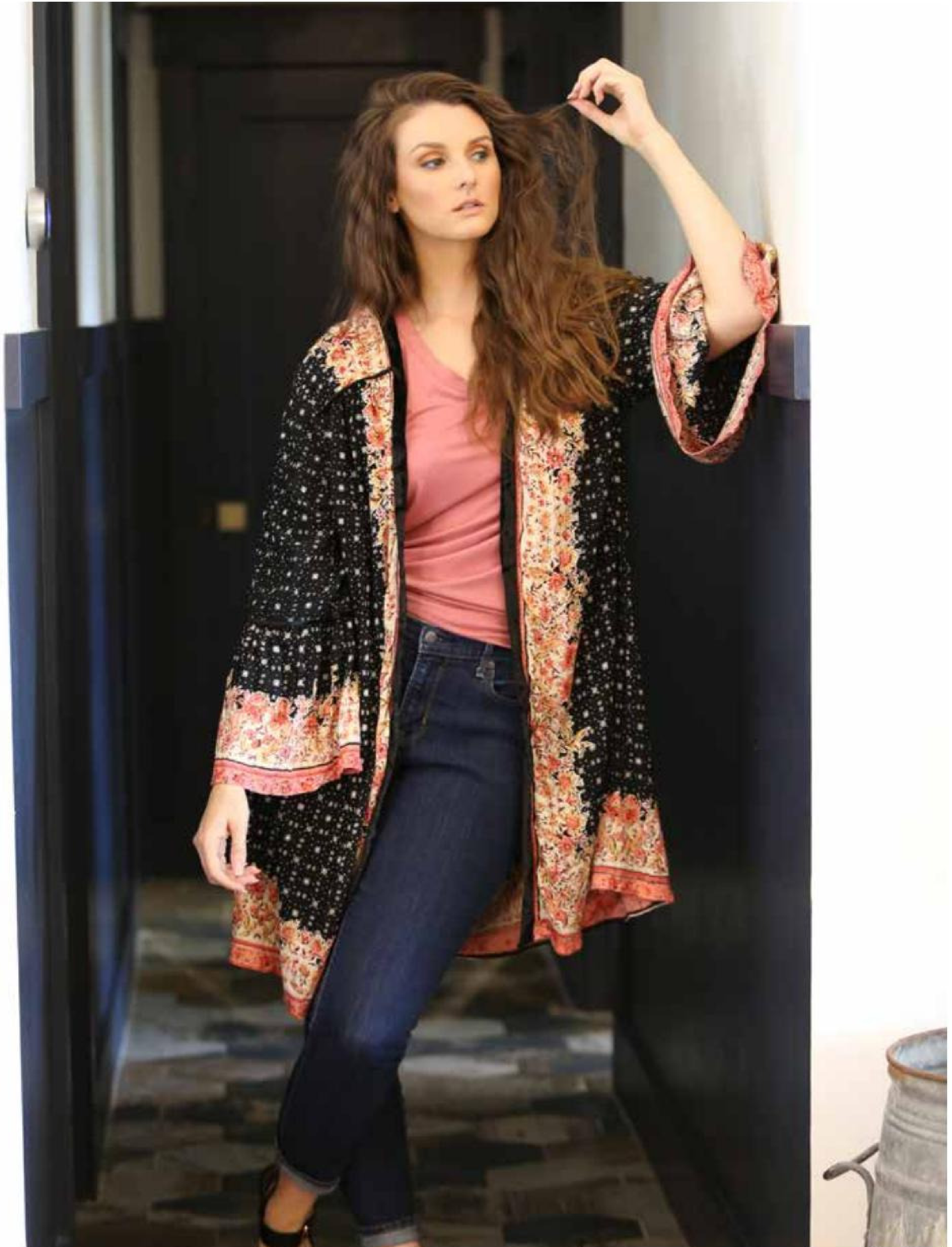
P9Z66 FP43 Black, Rayon. Flare sleeve velvet trim kimono. 3/2/1 $20.50 X2K05 ASIS Coral, Viscose/Spandex. V-neck knit top, 2/2/2 $19.50