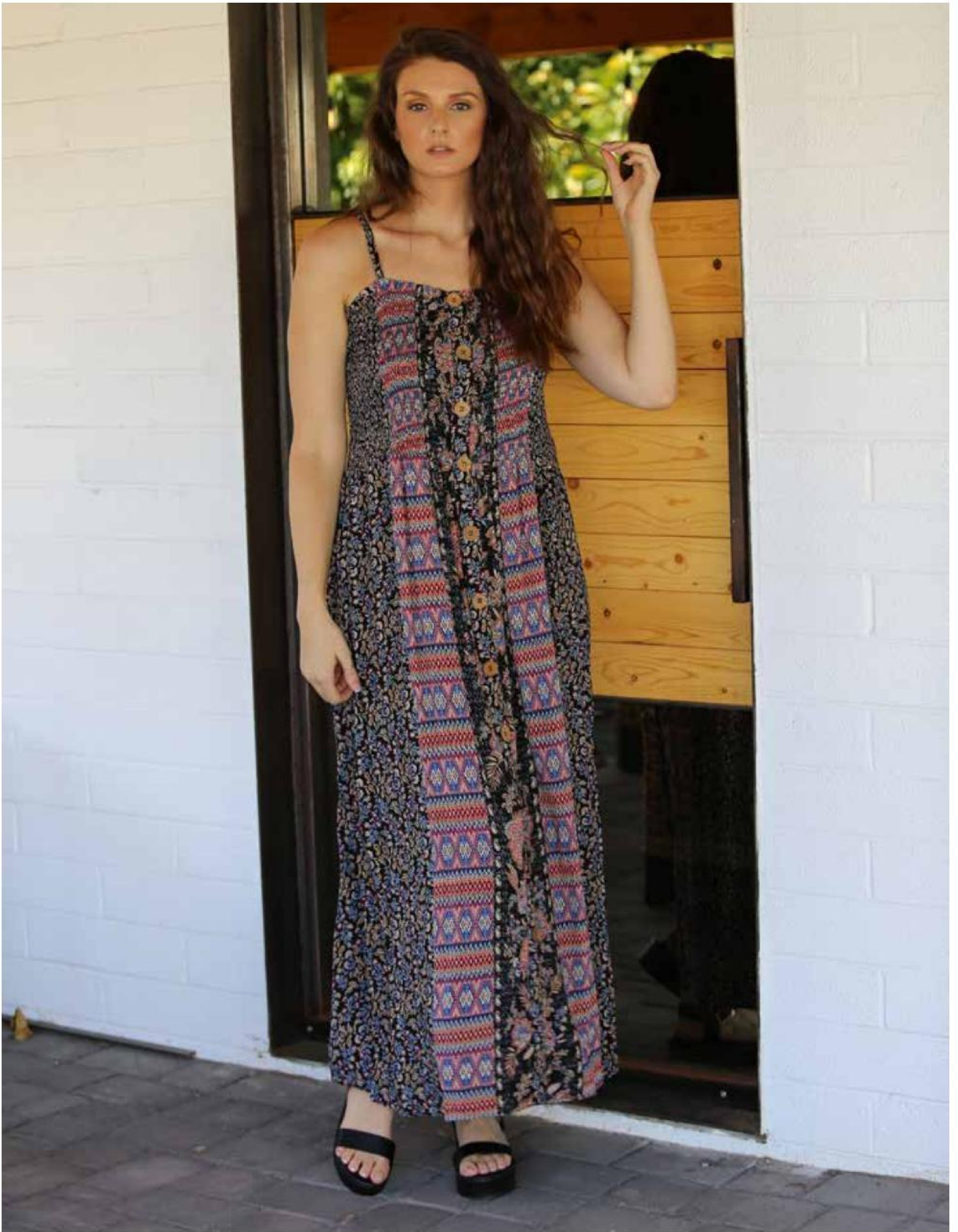
F9C23 FN54 Black, Rayon. Smocked bust button front maxi dress. 3/2/1 $21.50