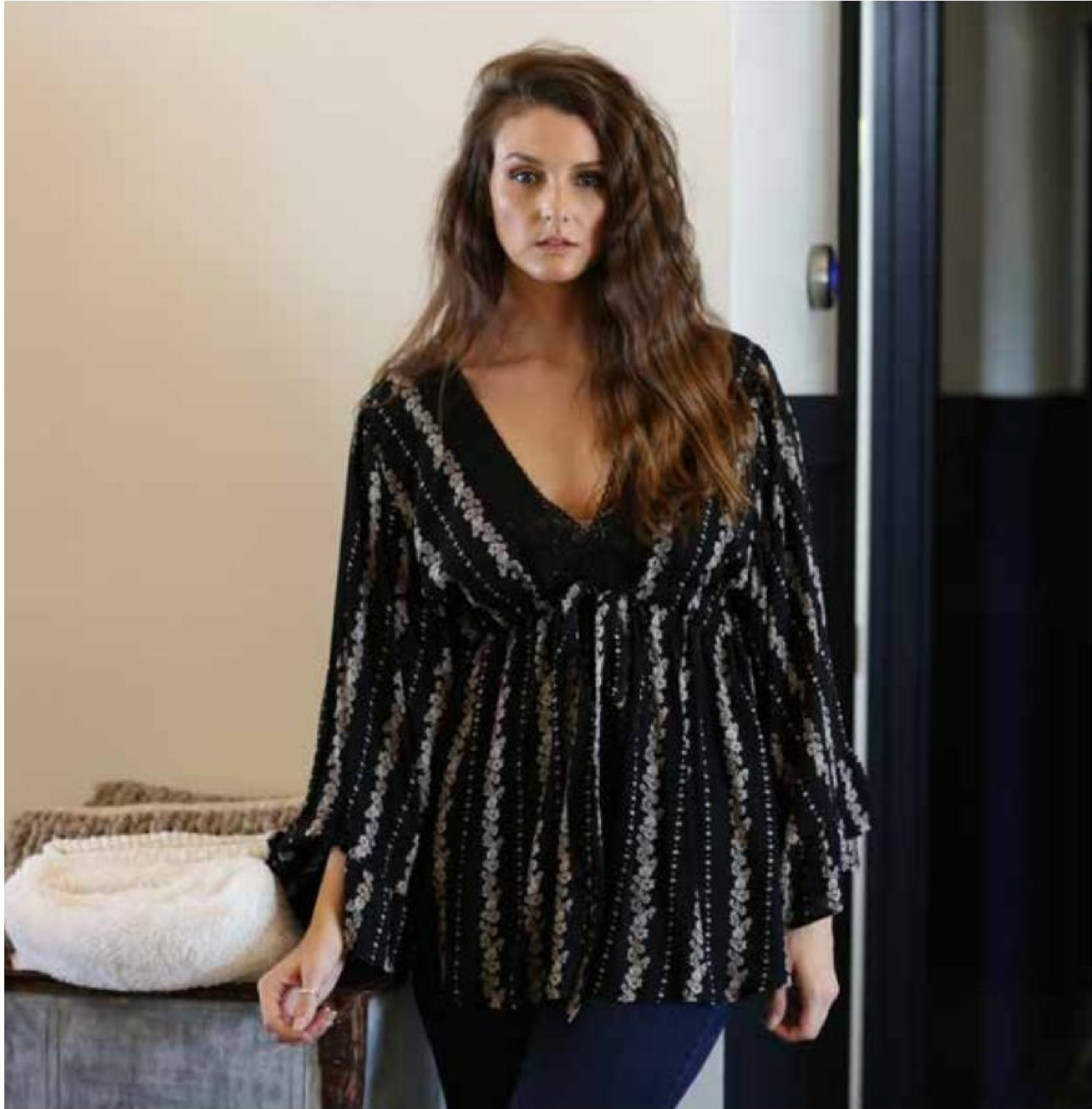
F9197 W738 Black, Rayon. V-neck angel sleeve top. 2/2/2, $19.50