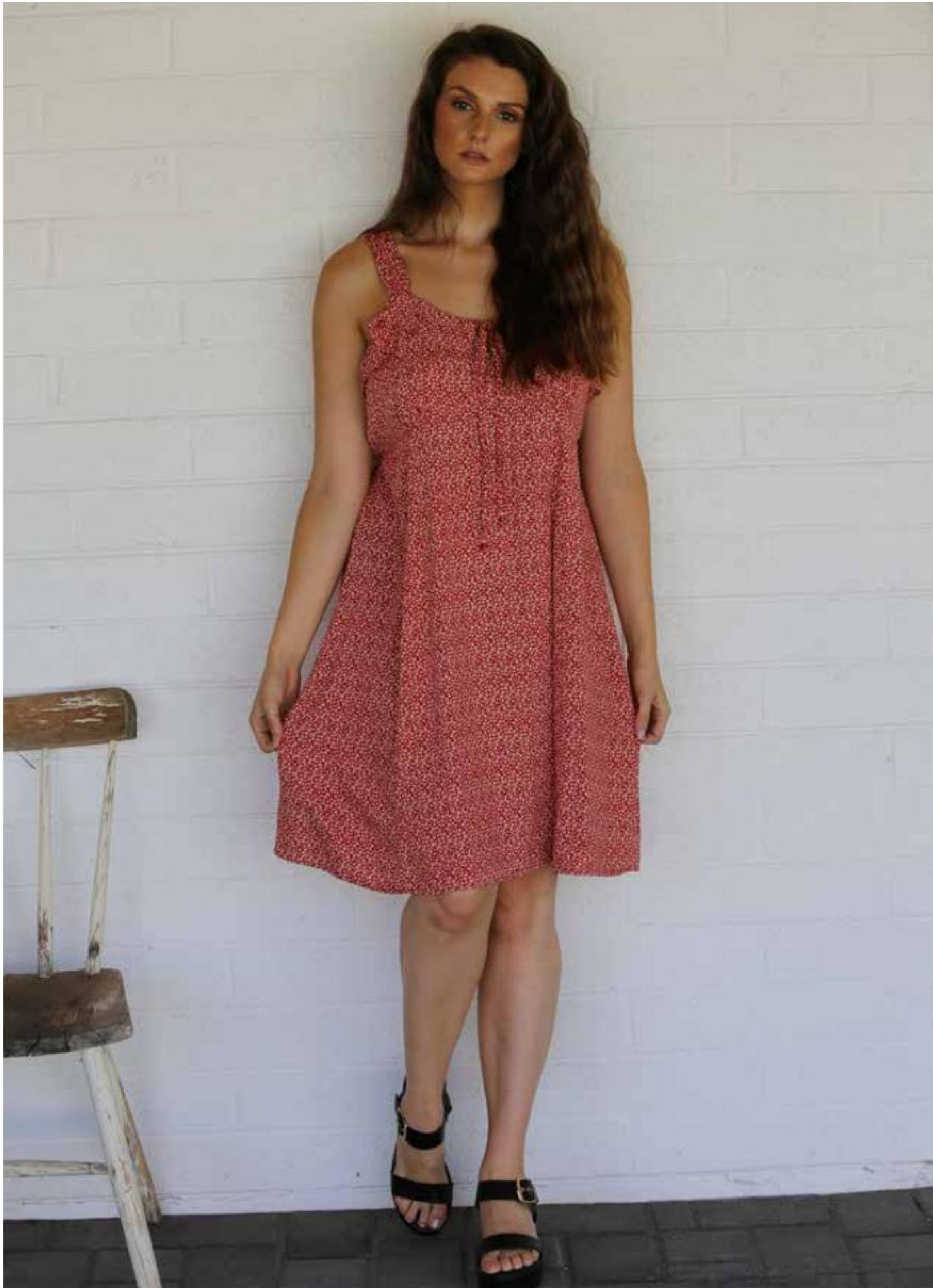
F9D41 W804 Palo Santo, Moss Crepe. Ruffle baby-doll dress. 2/2/2, $19.50