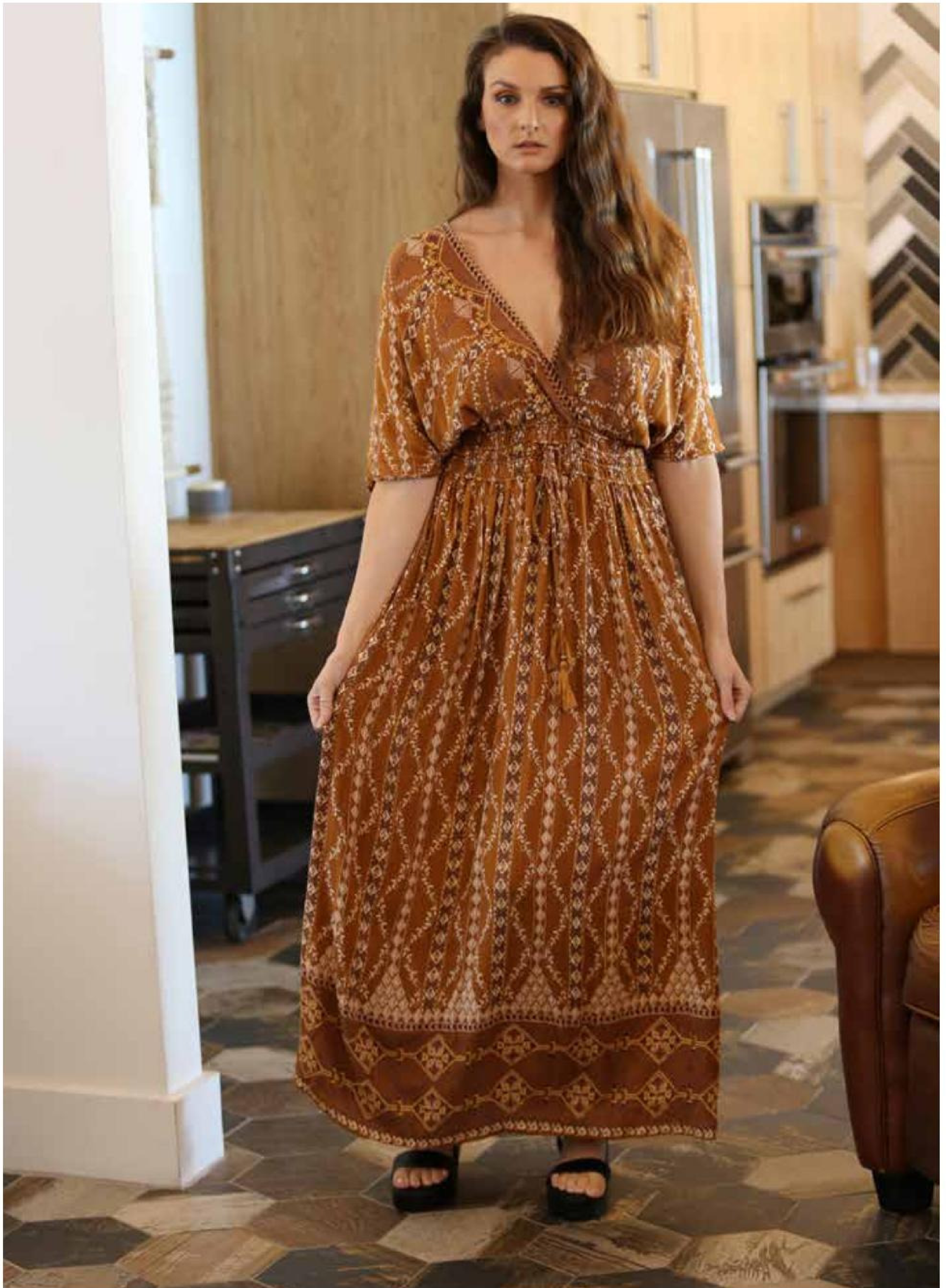
F9E92 FP46 Rust, Rayon. V-neck kimono sleeve tiered elastic waist maxi dress. 2/2/2, $24.50