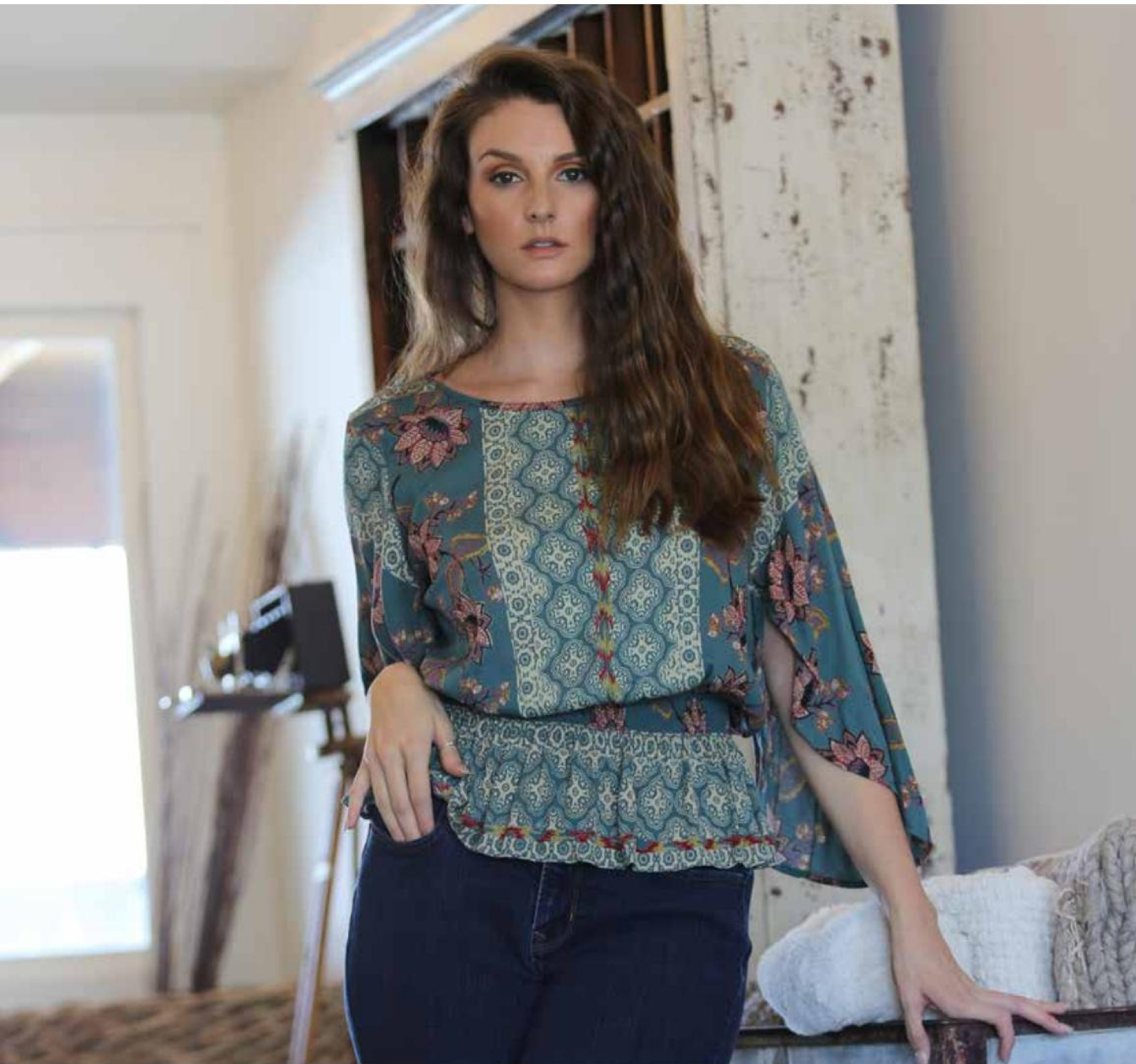
F9294 A698 Periwinkle, Rayon. Open tulip flutter sleeve top with smocked waist. 3/2/1, $19.50