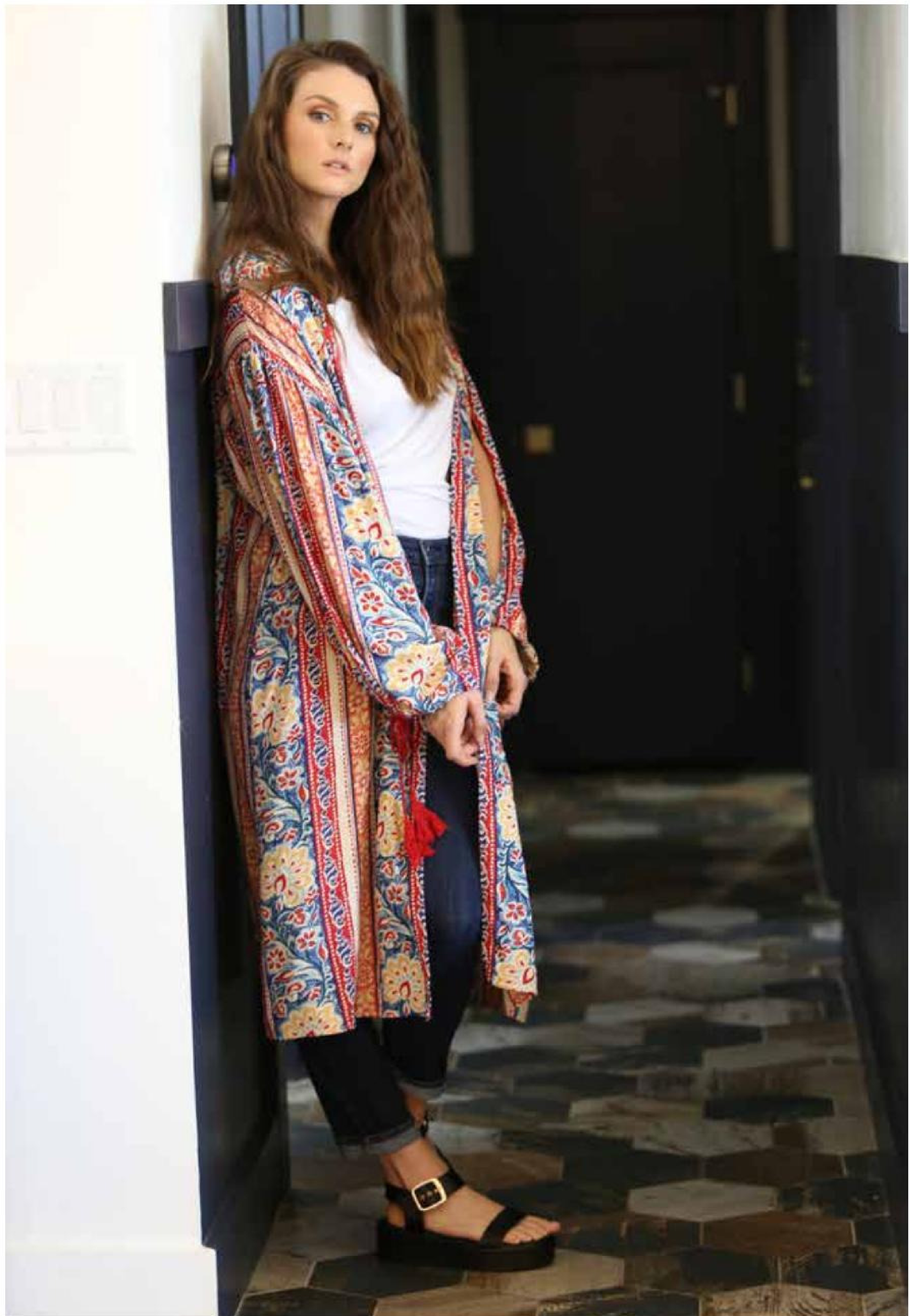
B9682 W850 Multi, Rayon. Printed kimono, with slits on the arms. 1/2/2/1, $21.50 X2AG4 ASIS White, Poly. Scoop neck short sleeve t-shirt. 2/2/2, $8.00