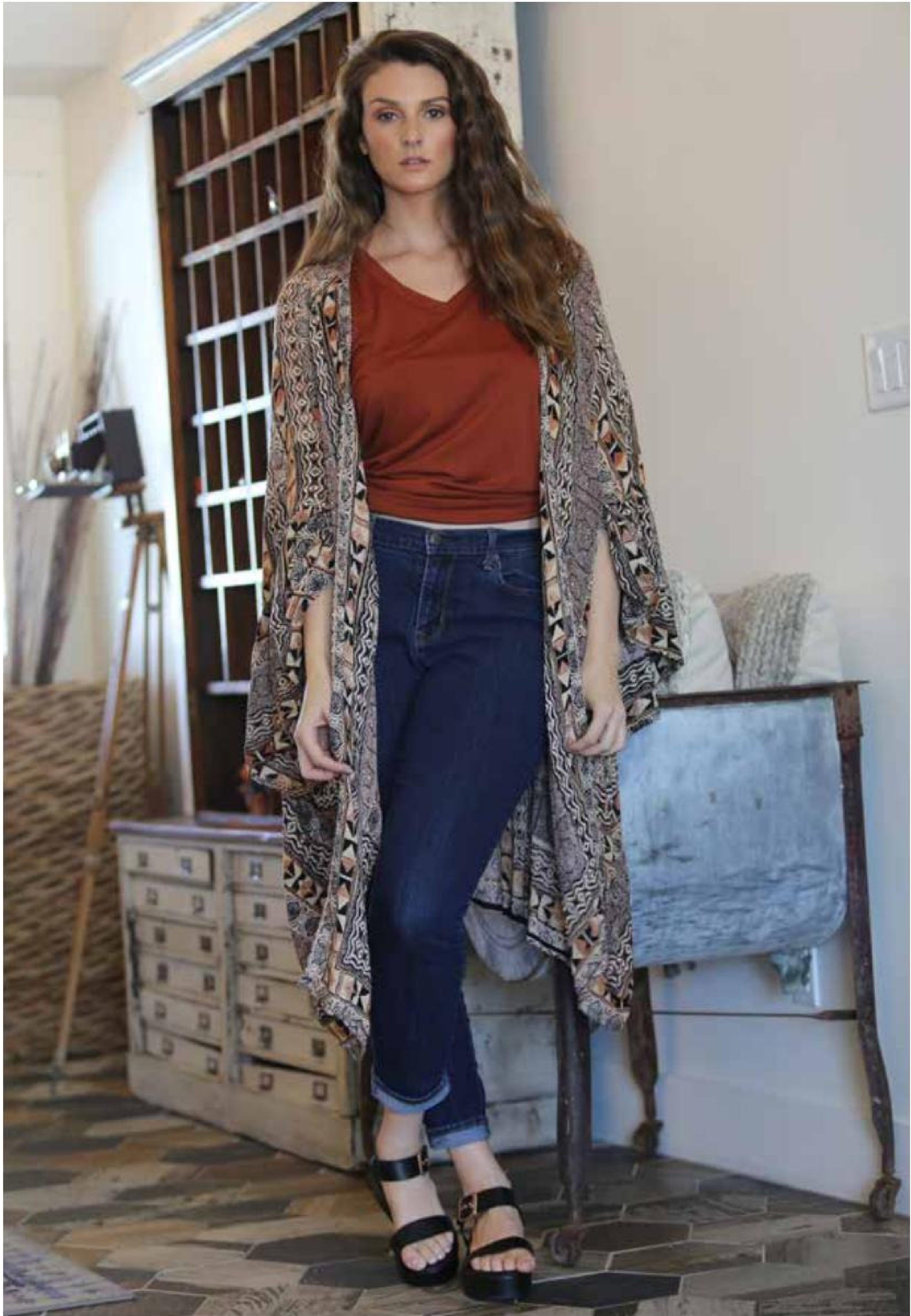
F9560 FP39 Black-Rust, Rayon. Flounce sleeve kimono. 3/2/1, $20.50 X9K05 ASIS Rust, Viscose/Spandex. V-neck knit top. 3/2/1, $12.50