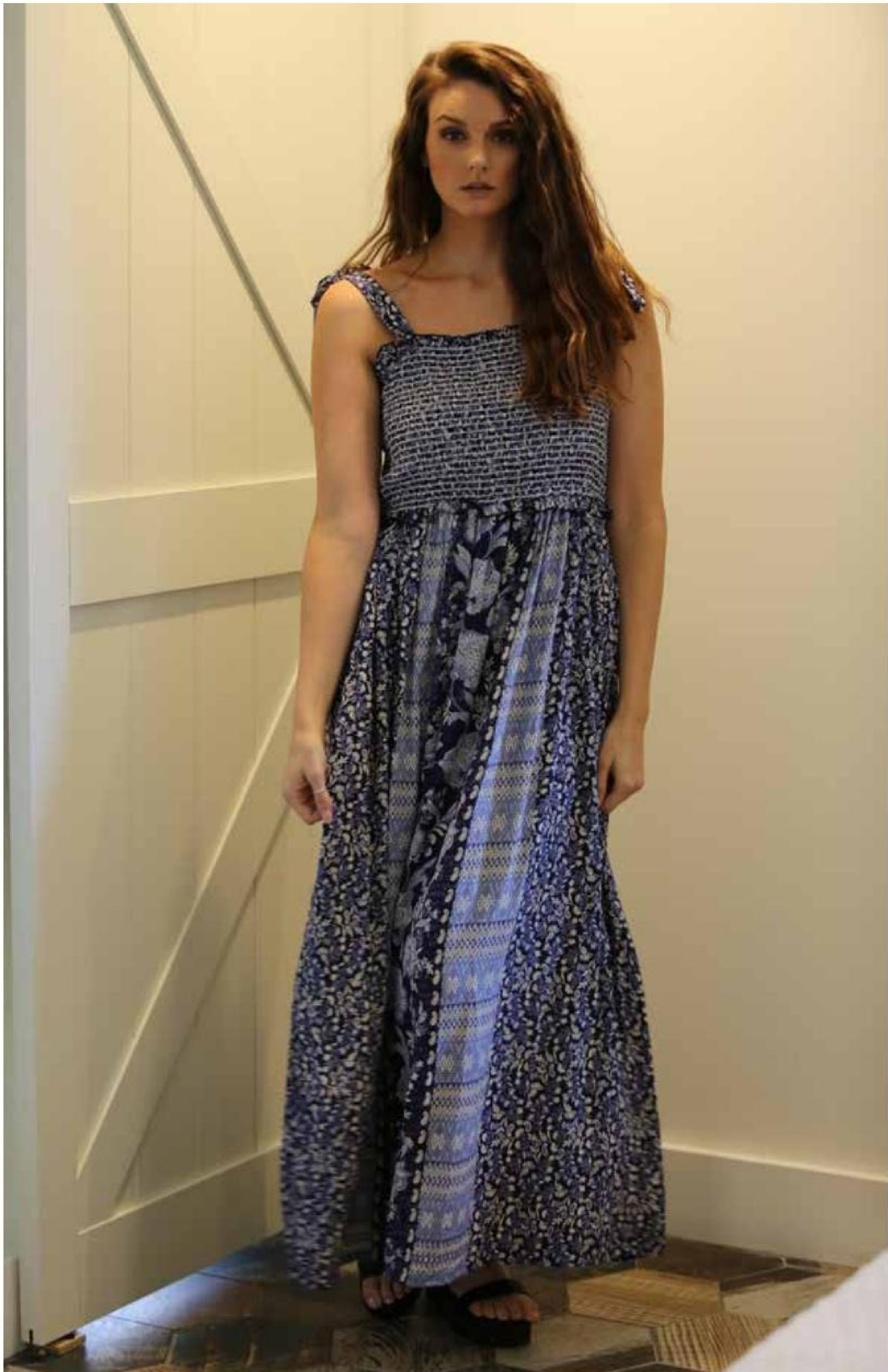
F9B50 FN54 Navy, Moss Crepe. Tie strap maxi dress. 3/2/1, $21.50

BACK COVER: P9Z17 RB59 Rayon, Acid wash button up top with crochet back. 2/2/2, $19.50