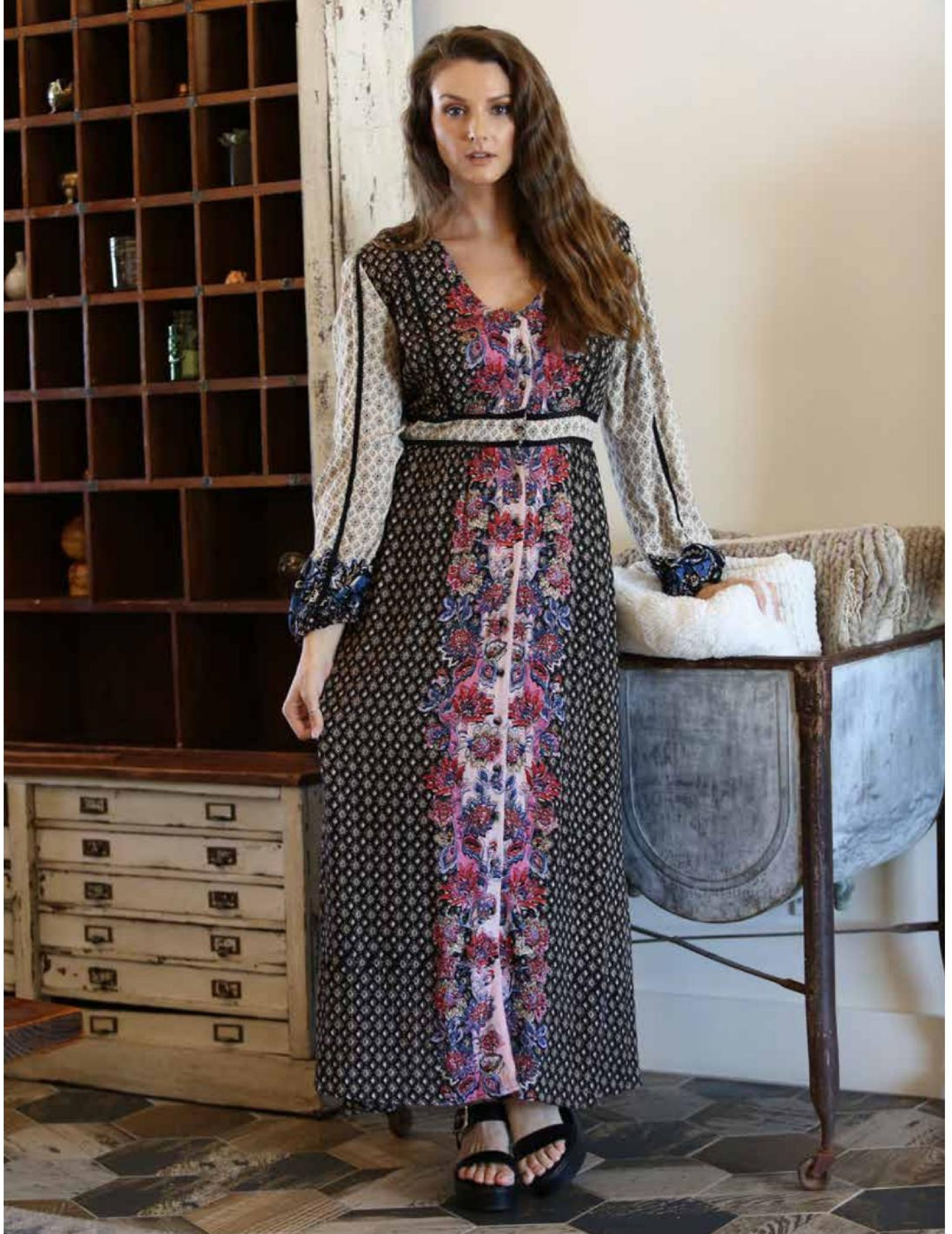
B9YY4 FO81 Blue-Pink, Rayon. Long sleeve button front dress. 3/2/1, $23.50