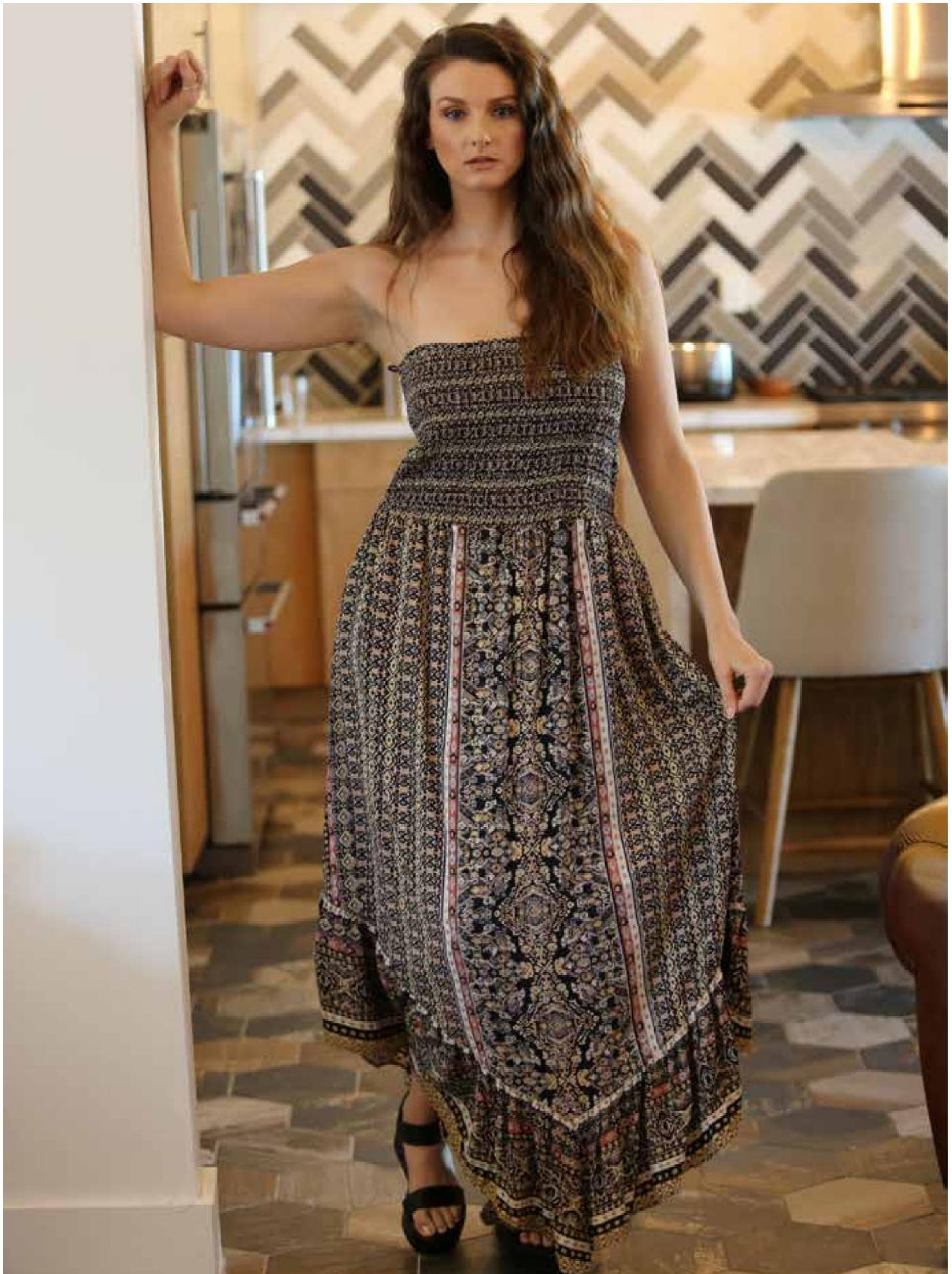
F9E04 FP16 Black-Tan, Rayon. Smocked bodice angled hem dress. 3/2/1, $23.50