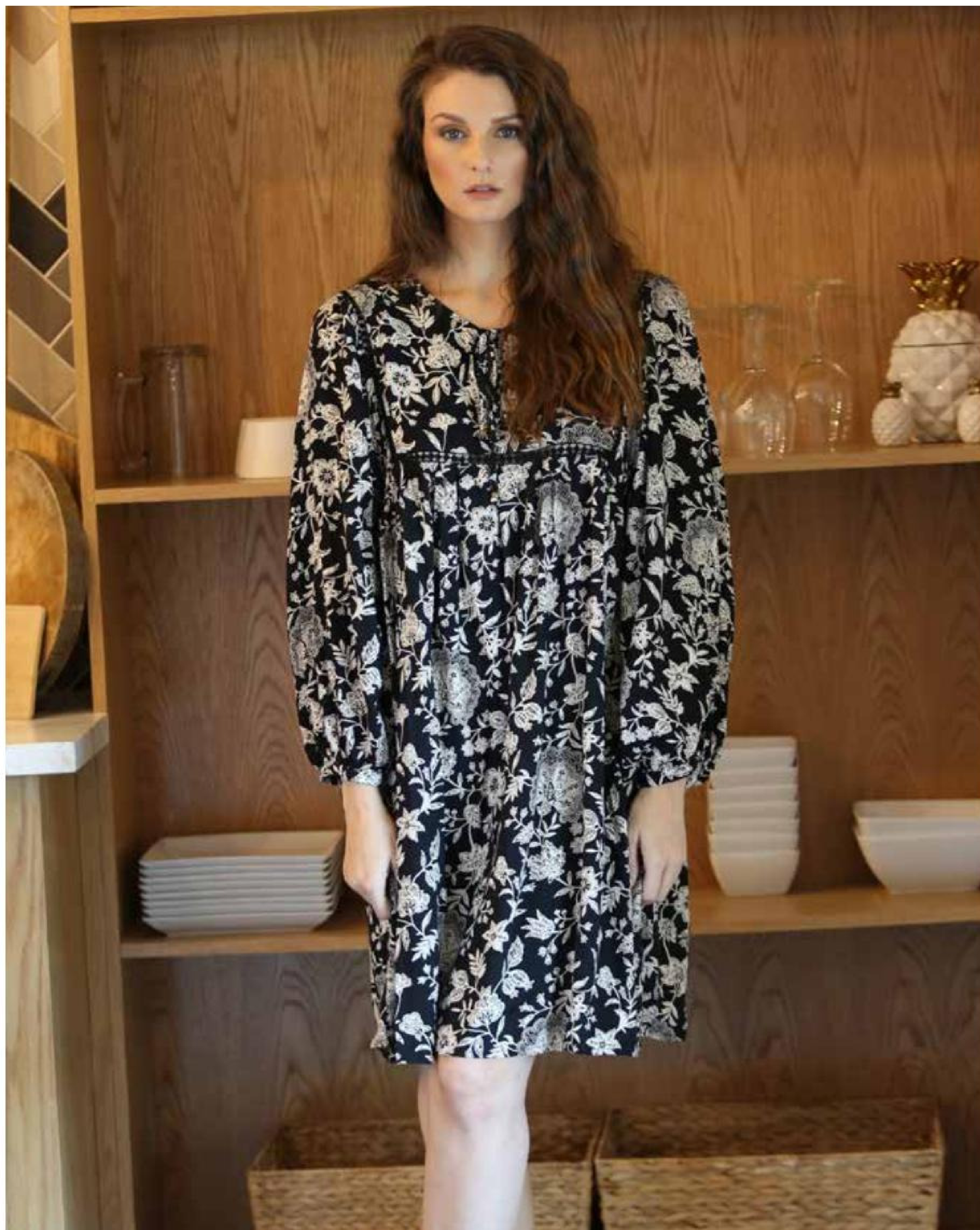
B9LL9 K472 Black, Rayon. Long Sinched Sleeve Dress. 2/2/2$19.00