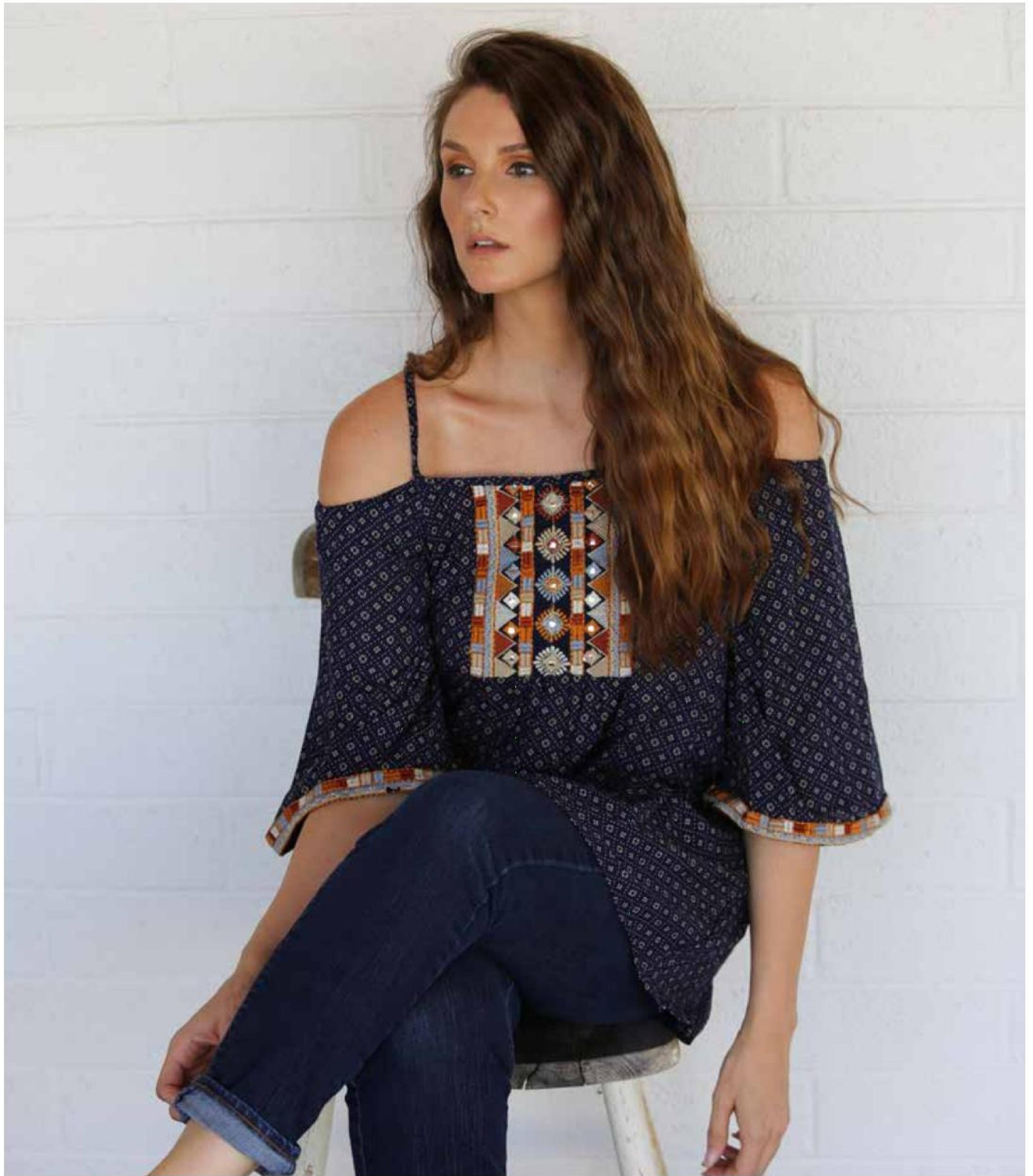
T4450 MP30 Navy, RCC. Cold shoulder tunic. 1/2/2/1, $14.50