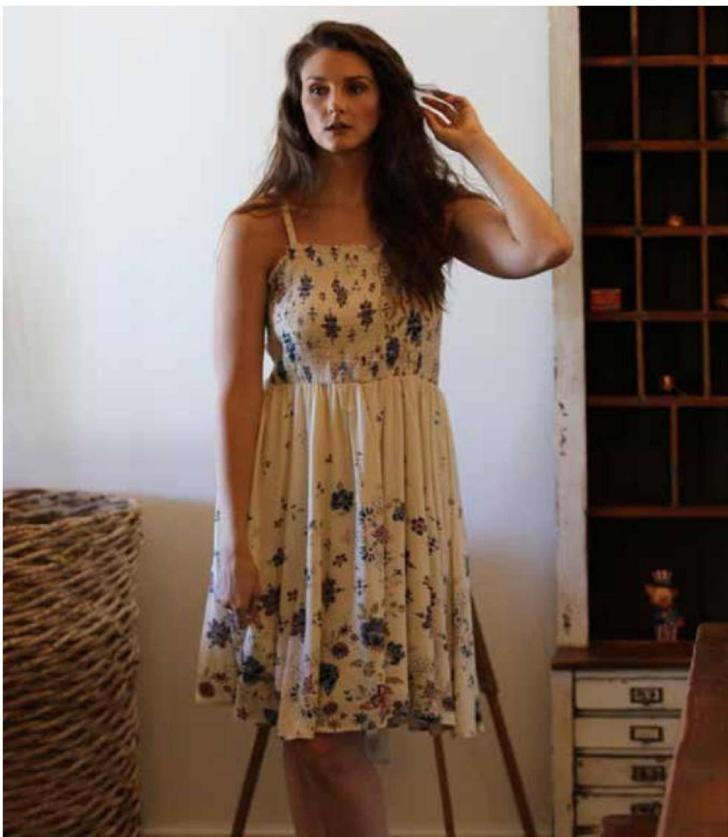
F9415 F084 Ivory, Rayon. Lace v-neck tiwht floral top. 3/2/1, $18.50 C9092 A737 Ivory, Rayon. Smocked bodice circle skirt sundress. 2/2/2, $18.50