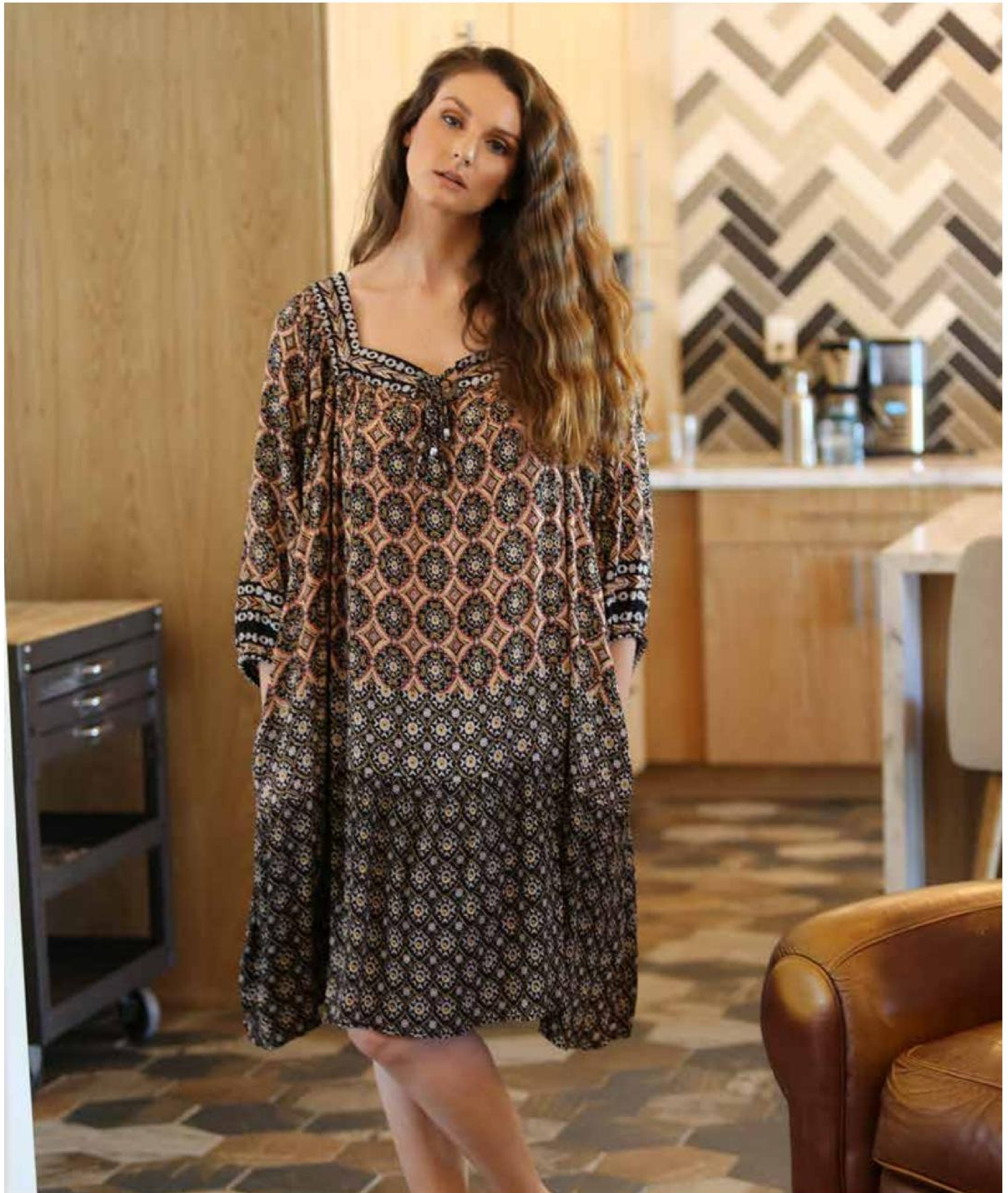
F9E57 FP44 Black, Rayon. Square neck 3/4 sleeve dress with ruffle tier hem. 3/2/1, $20.50