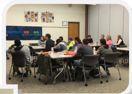
Youth Conference Group