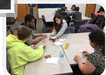
Focus on Your Future Marshmallow Tower Activity