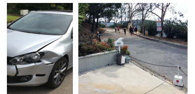
Ignoring "No Turnaround" warning