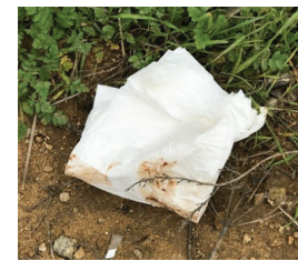
Used toilet paper!