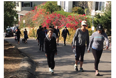
Hikers by the hundreds on weekend

Due to a lawsuit brought by the Sunset Ranch Hollywood Stables, the City has just closed off pedestrian access to the Beachwood Canyon trailhead into the park where thousands of people typically go to see the sign and get "the picture." Although Beachwood is "on the other side," there's no telling what the impact of this development will be on our neighborhood.