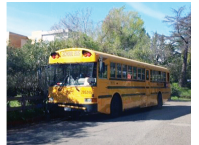
Hikers by the Busload!

Beyond the noise and disruption at all hours, and the destruction of personal property and local flora, this tsunami of hikers also represents a threat to personal and fire safety. The hope is that by working with all relevant parties, there can be a solution that's both fair to the Wonder View homeowners while also allowing tourists and hikers to enjoy our beautiful city resources without putting themselves and others in danger.