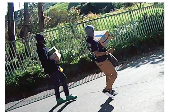
Thieves carrying away our FedEx boxes!!!