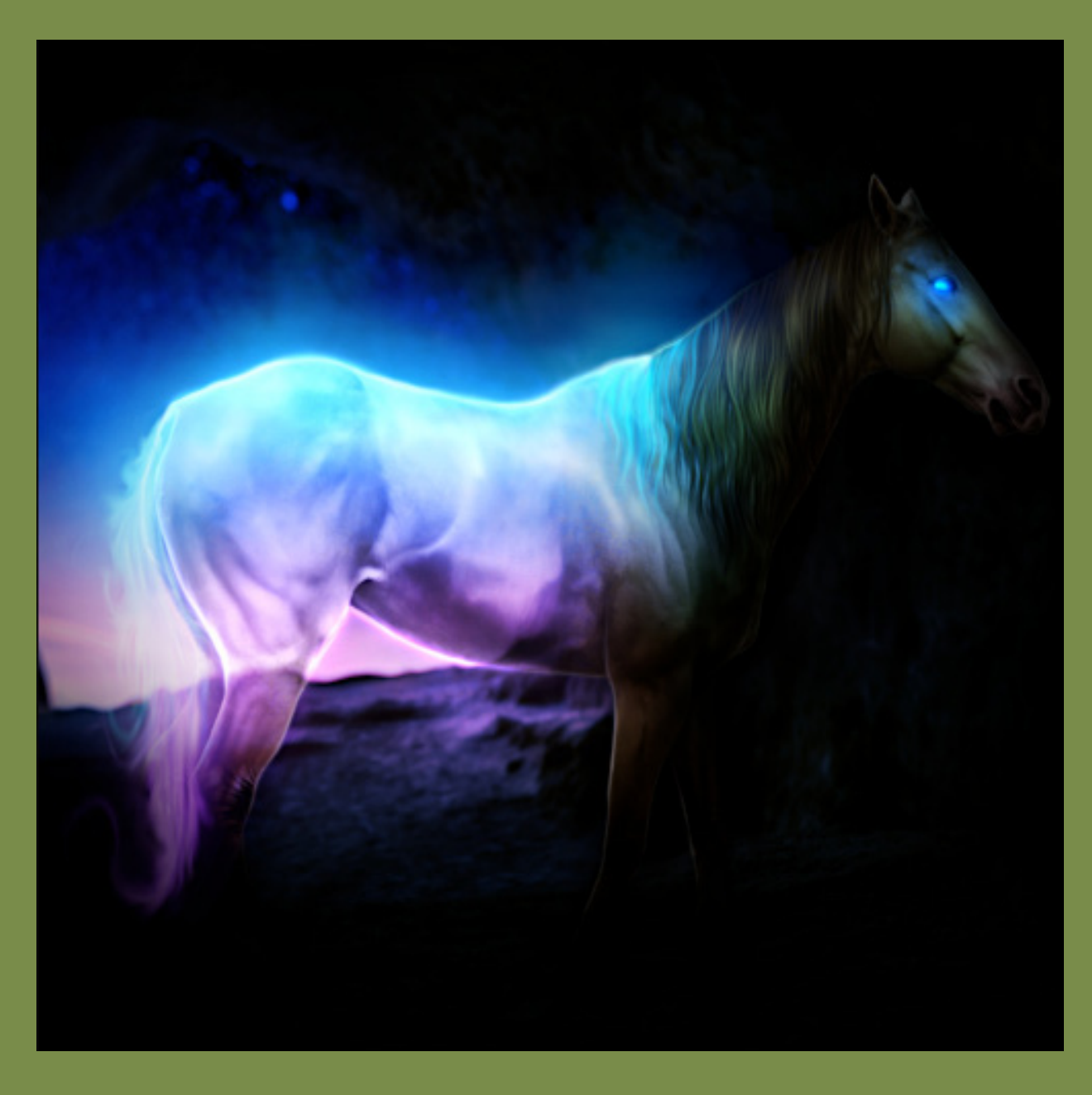
Ethereal glowy horse by Luminescent Hollow! (239615)