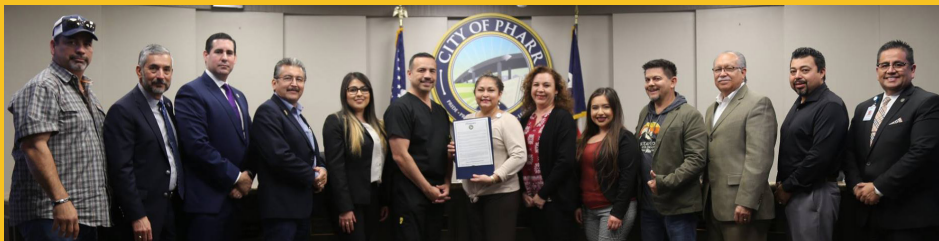
Pharr city officials, in partnership with community leaders and members from PSJA ISD, proclaimed February 2019 as Career and Technical Education Month.

Through continued partnerships, the Pharr EDC and city of Pharr strive to support PSJA ISD in countless initiatives geared towards preparing our future workforce. Together we ensure that our students graduate with the necessary tools to compete in a rapid growing and competitive market. For this reason, we proclaimed February as Career and Technical Education Month.