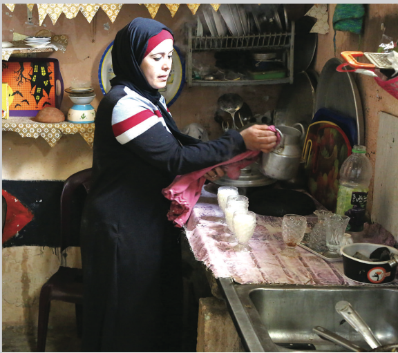
Amal's family lives on less than US$ 1.74 per person a day and relies on UNRWA food assistance to put food on her table.