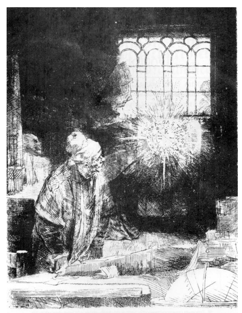
57. Dr. Johann Faust watching a magic disc in his study. Engraving by Rembrandt Harmensz van Rijn, 1652.