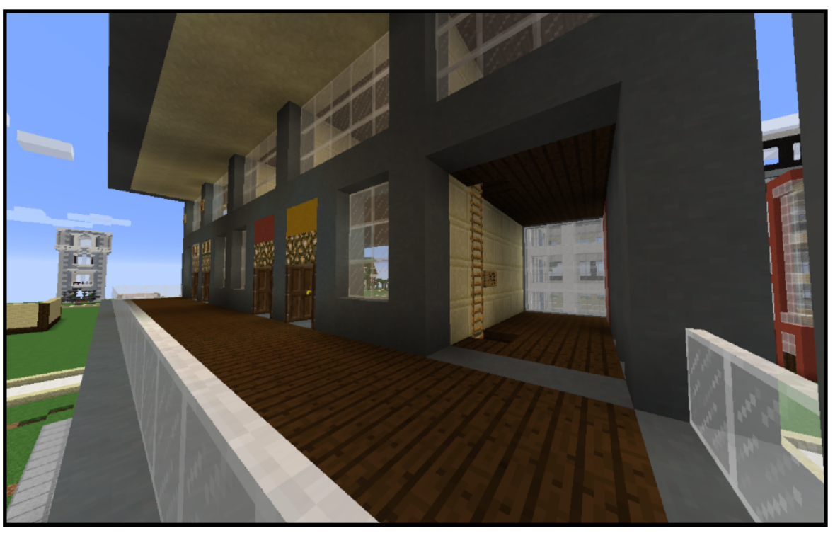
Many units of different sizes available