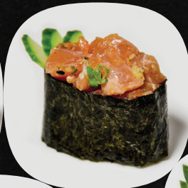
SPICY TUNA 22