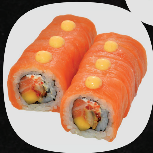
SMOKED SALMON ROLL 44