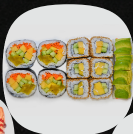
ANSHU'S BOX 45