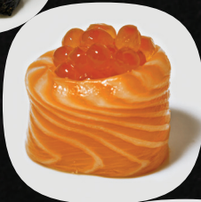
SALMON WRAPPED IKURA 38