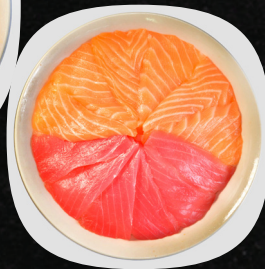
SALMON & TUNA 62