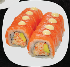
SALMON ROLL 44