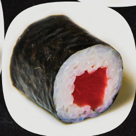
SPICY TUNA 24