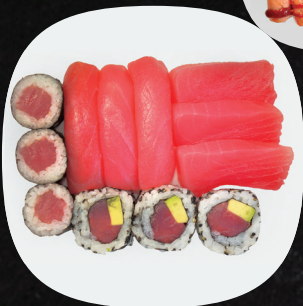
TUNA TANTRUM 58