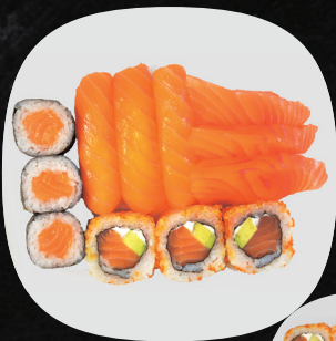
SALMON SAYS 55