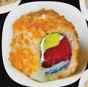
PHILLY TUNA 30