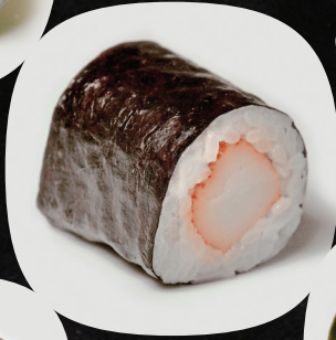
CRAB MEAT 25