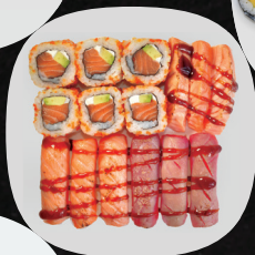
VERY TERYAKI 68