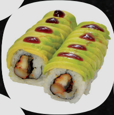
GREEN ISLAND 44