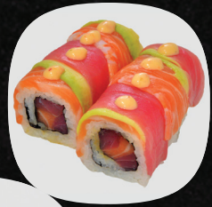
RAINBOW ROLL 44