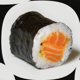
SPICY SALMON 22