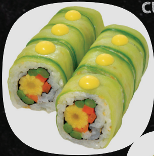
CUCUMBER ROLL 42