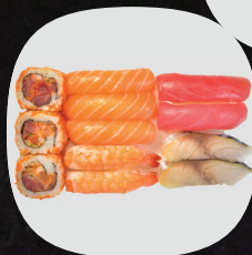
SUSHI MUSHI 59