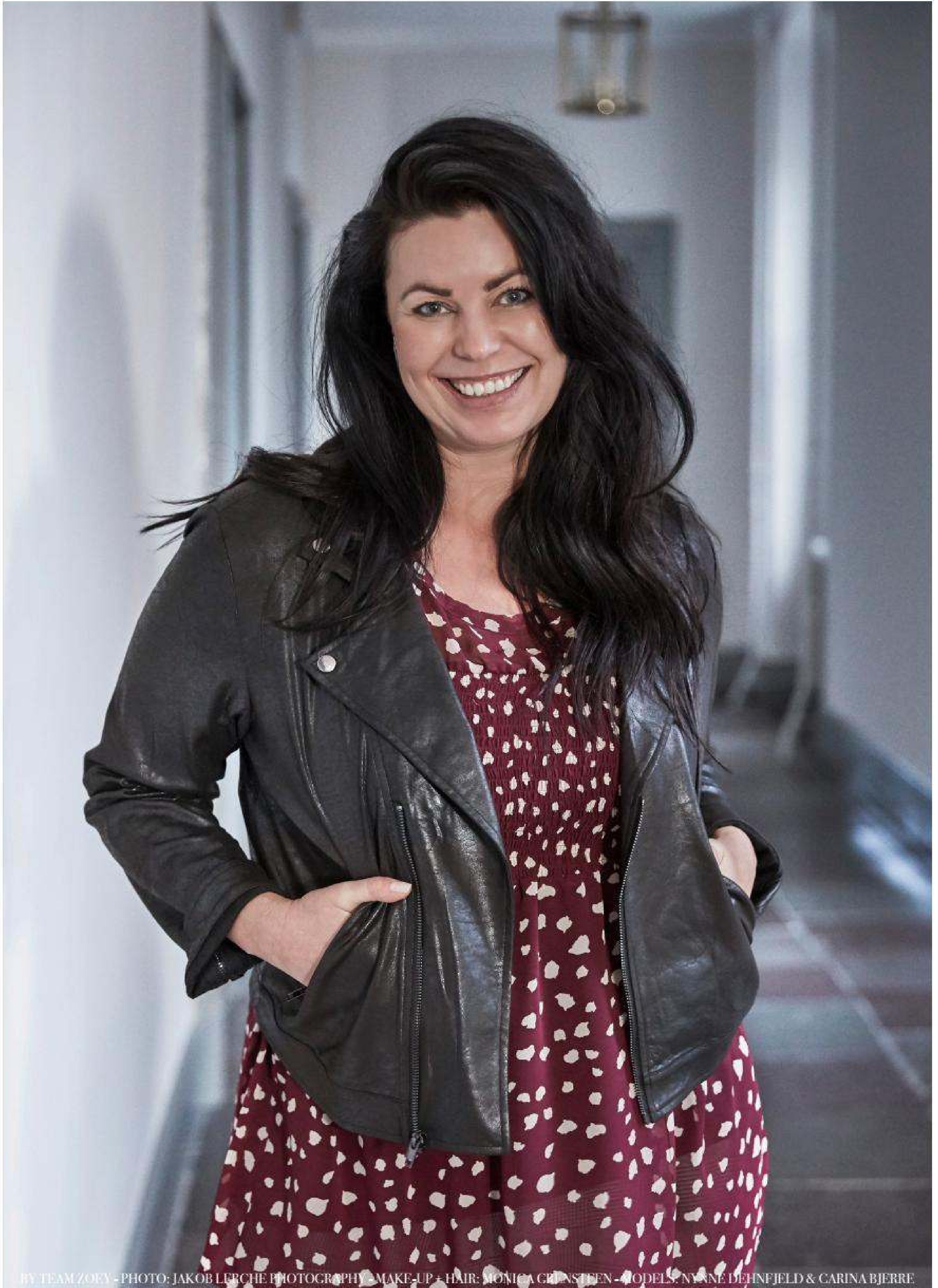
BY TEAMZOEY - MAKE-UP + HAIR: MONICA GRUNSTEIN - MODELS: NYANE DEHNFJELD & CARINA BJERRE