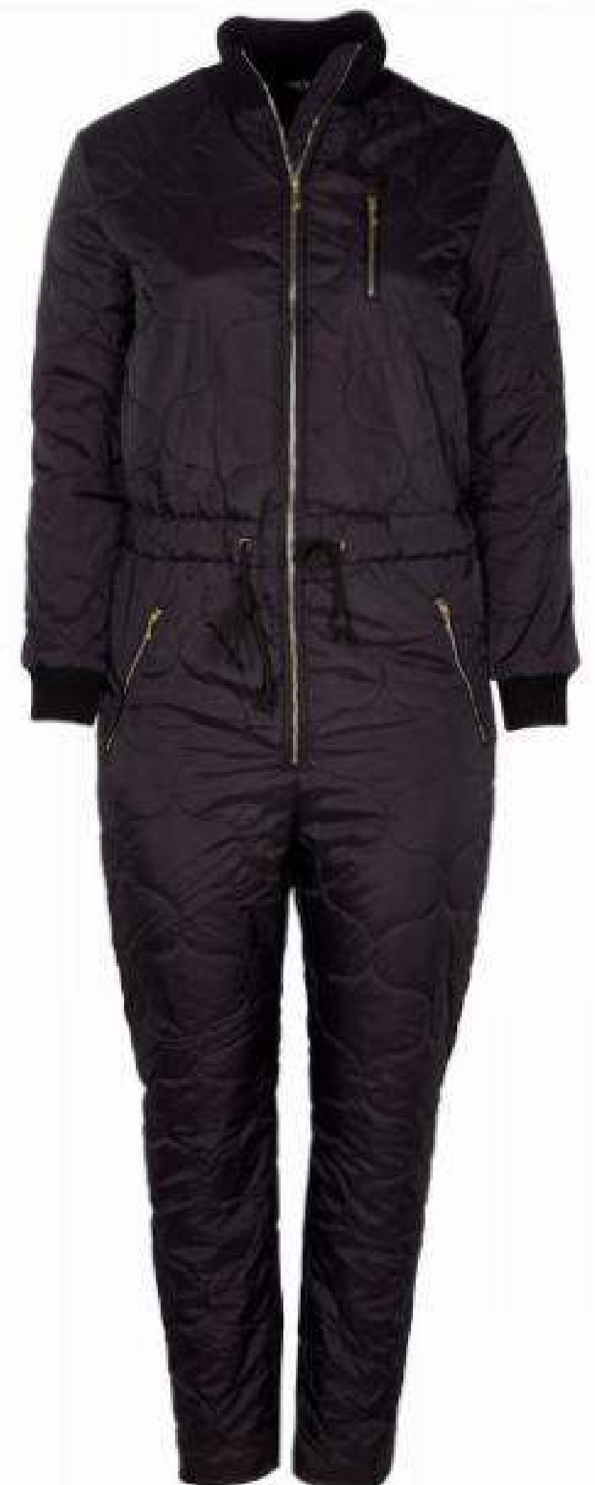
DANIELLA QUILT JUMPSUIT ZOEY Autumn 2020 Magazine 45