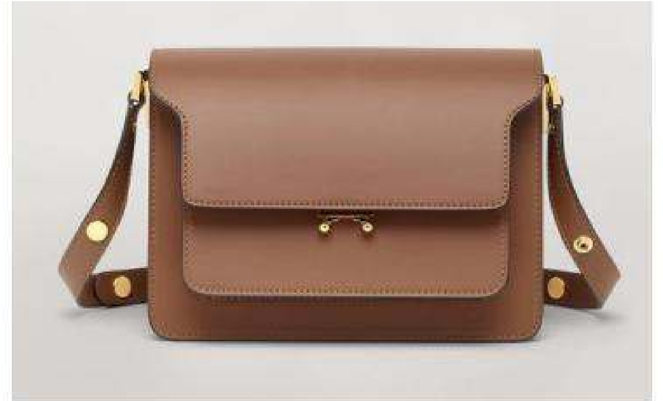
MARNI TRUNK BAG € 1600

"Stripes are an evergreen kind of thing, and this MELISSA shirt too, but in a fashionable way that it perfekt for autumn"