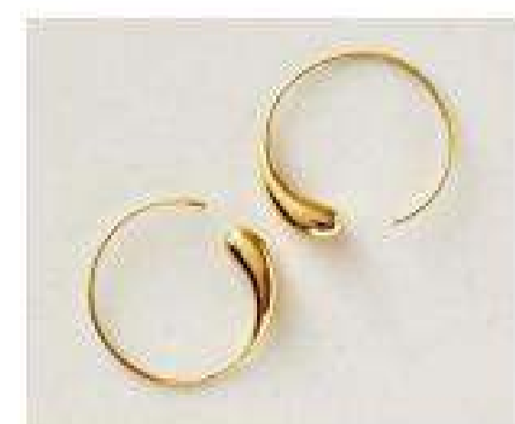
STUDIO LOMA € 80

"I wasn't always into knits, but i am becoing so indeed! Especially for this delicious, soft JESSICA knit"