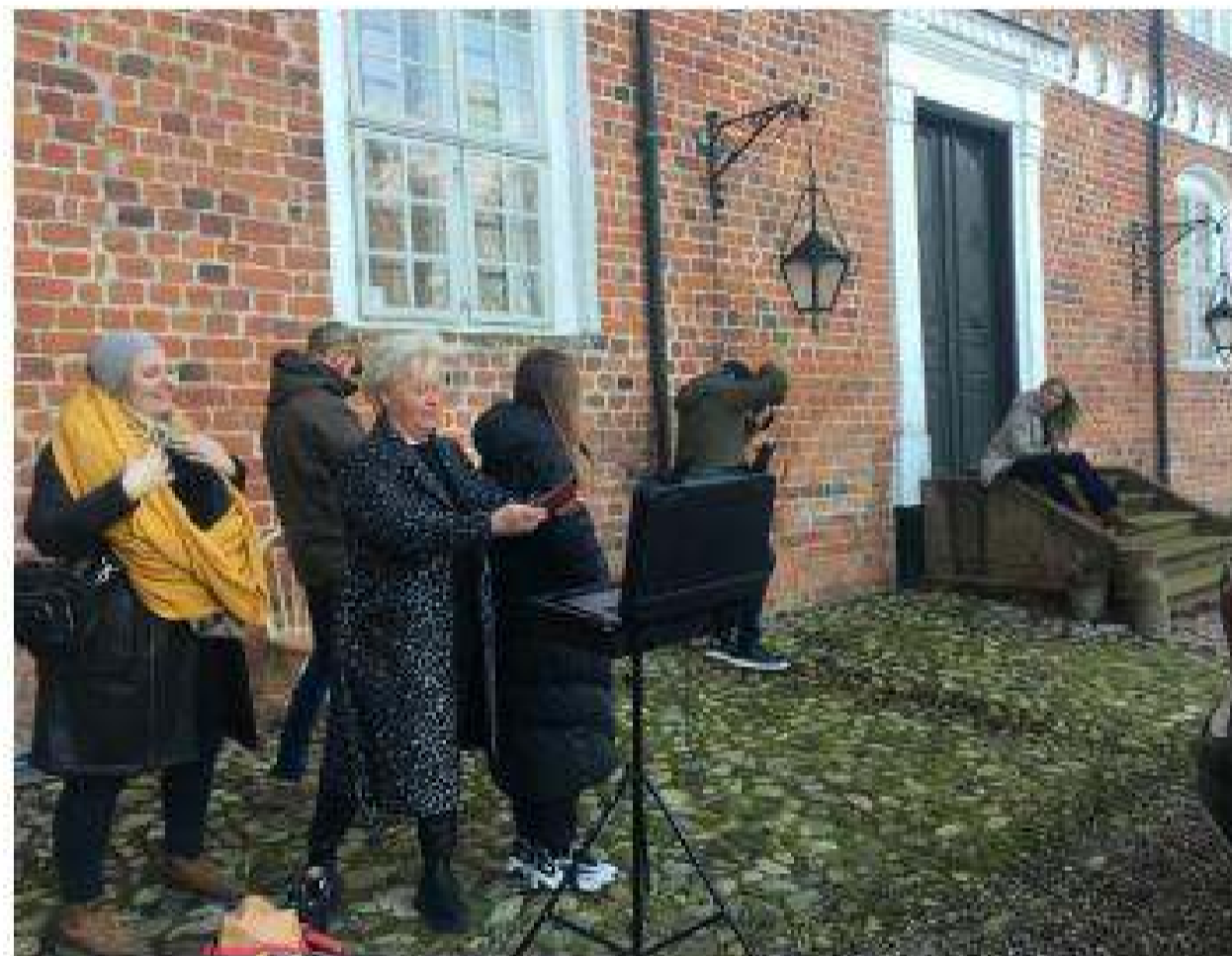
Shooting outdoors in December in Denmark - it was cold! Luckily we are a clothing company so we have enough for everyone to keep warm.