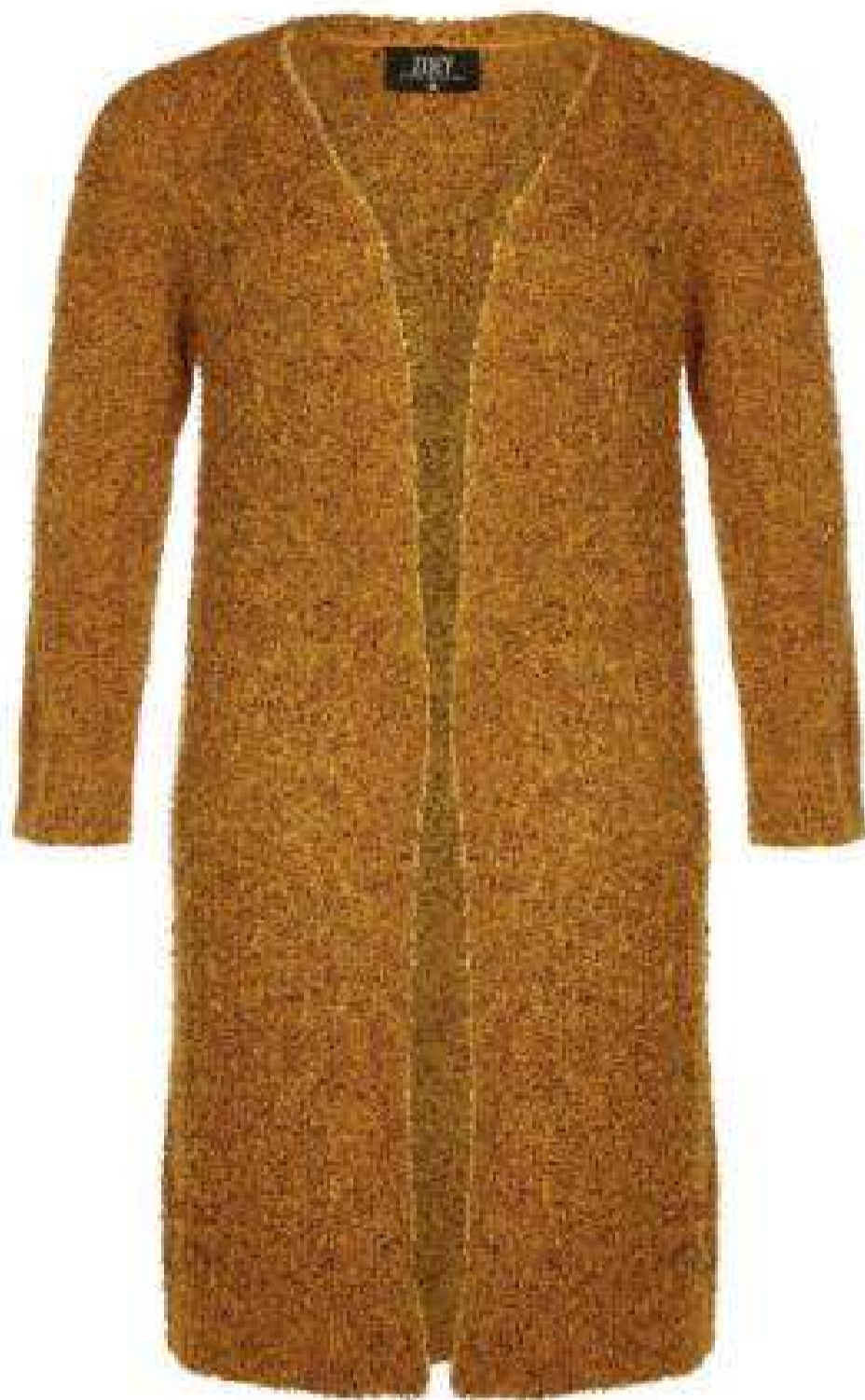
DELANYE LONG CARDIGAN