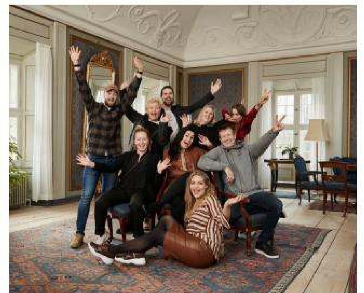
The whole team at the end of the best day. We bring home amazing memories, gorgeous photos and great laughs. Thank you so much everyone!