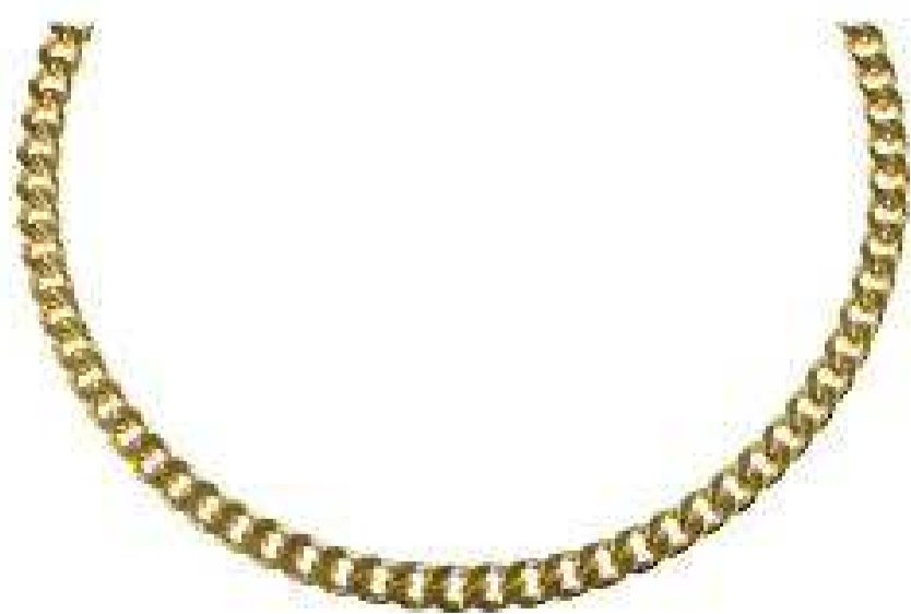
PURE NY NAT GOLD NECKLACE