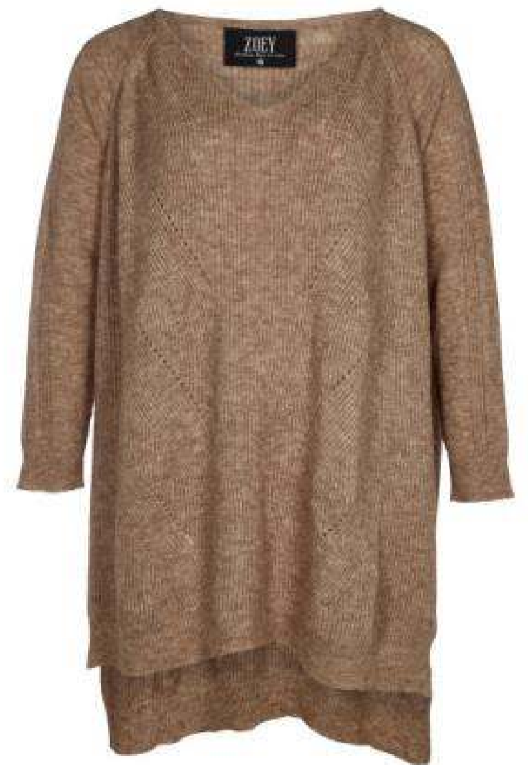
JESSICA OVERSIZE KNIT

When Autumn arrives it is time to bring out the knits. Especially in our part of the world. No matter if you like thin, heavy, chunky or super soft - here is a knit for you.