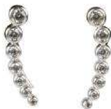
PURE BY NAT SILVER EARRINGS