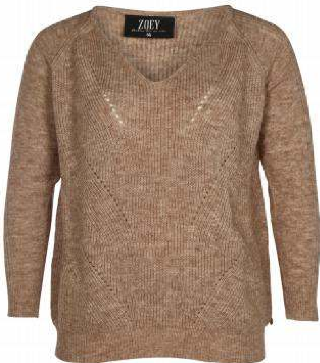
JESSICA KNIT BLOUSE

When Autumn arrives it is time to bring out the knits. Especially in our part of the world. No matter if you like thin, heavy, chunky or super soft - here is a knit for you.