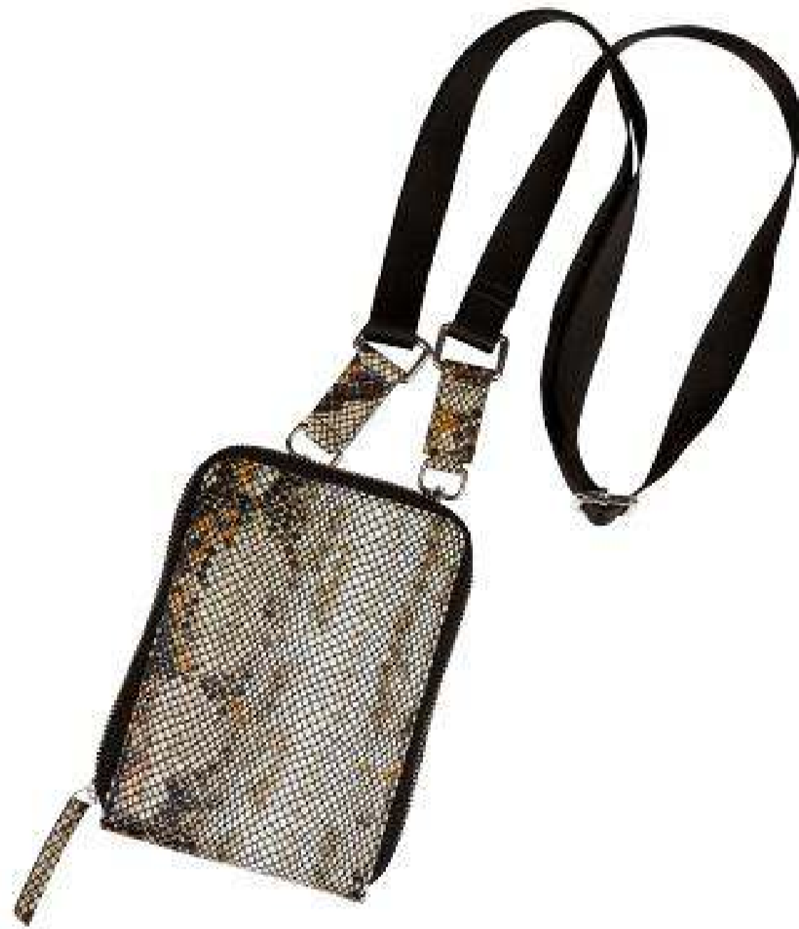
GEMMA SMALL BAG