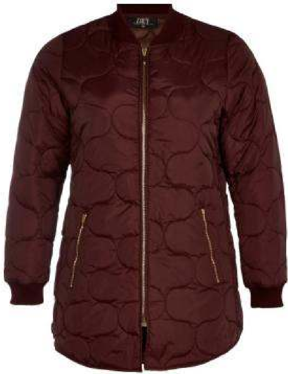
DANIELLA QUILT JACKET