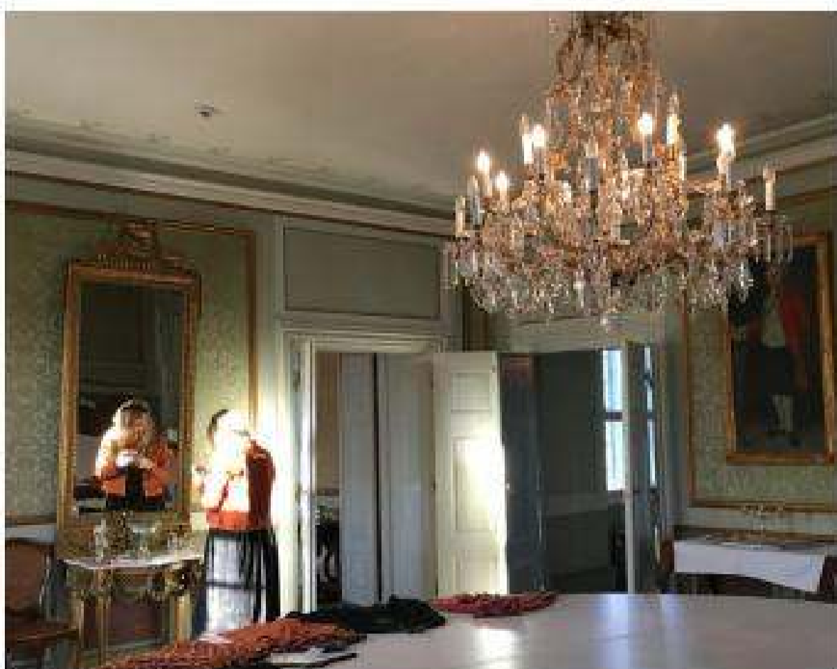
We spend the day in the most beautiful surroundings! We owe Løvenholm Slot a huge thanks for letting us into their premisses which is usually only reserved for the few. THANK YOU!