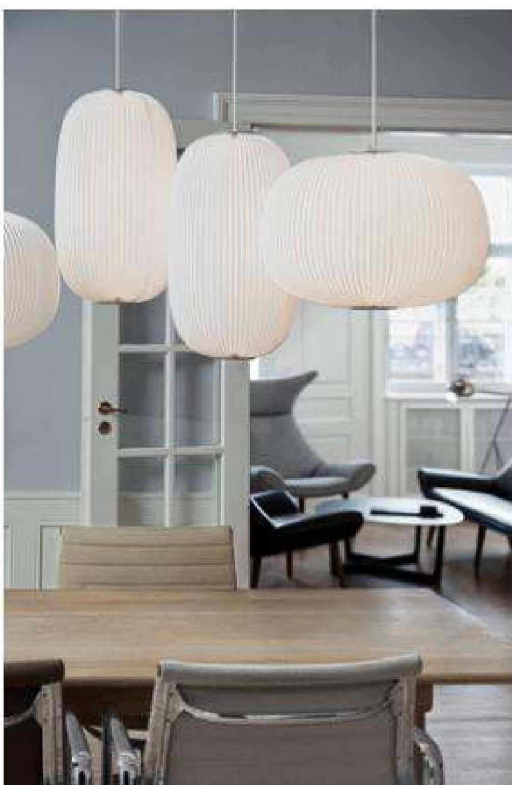
LE KLINT LAMELLA LAMP € 630 / EACH

"I am trying to save up for this beautiful and versatile bag - I would love to one day be able to buy something for myself that I have had my eyes on for a long time"