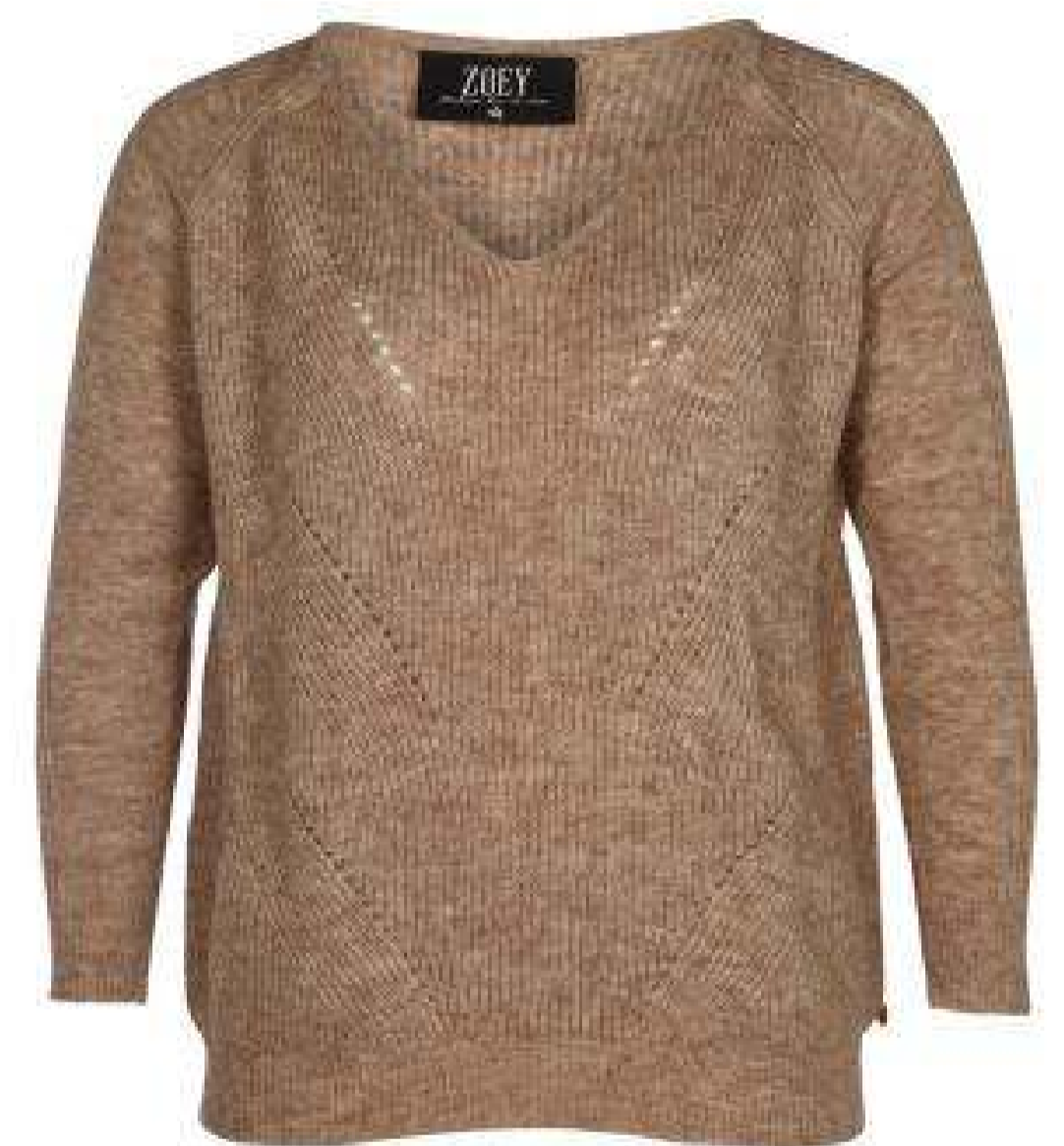
JESSICA KNIT BLOUSE

"The shape, the color, the trimmings - I love it all"