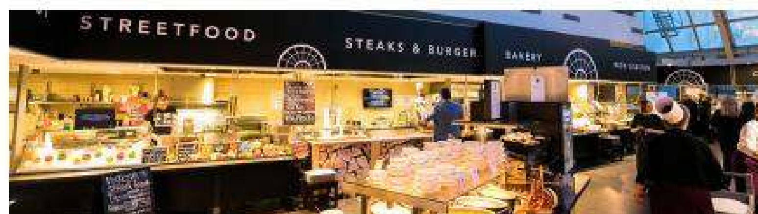
Restaurant Wintergarten in the KaDeWe Berlin's Rooftop Market.

"The KaDeWe has always been one of the tourist attractions in the heart of Berlin - a shopping paradise in a class of its own. The restaurant Wintergarten is in no way inferior. In the restaurant Wintergarten on the 7th floor of the KaDeWe you will experience fresh cuisine vis-à-vis. The dishes are prepared right in front of the you! Before or at the same time enjoy drink or cocktail the new pharmacy bar."