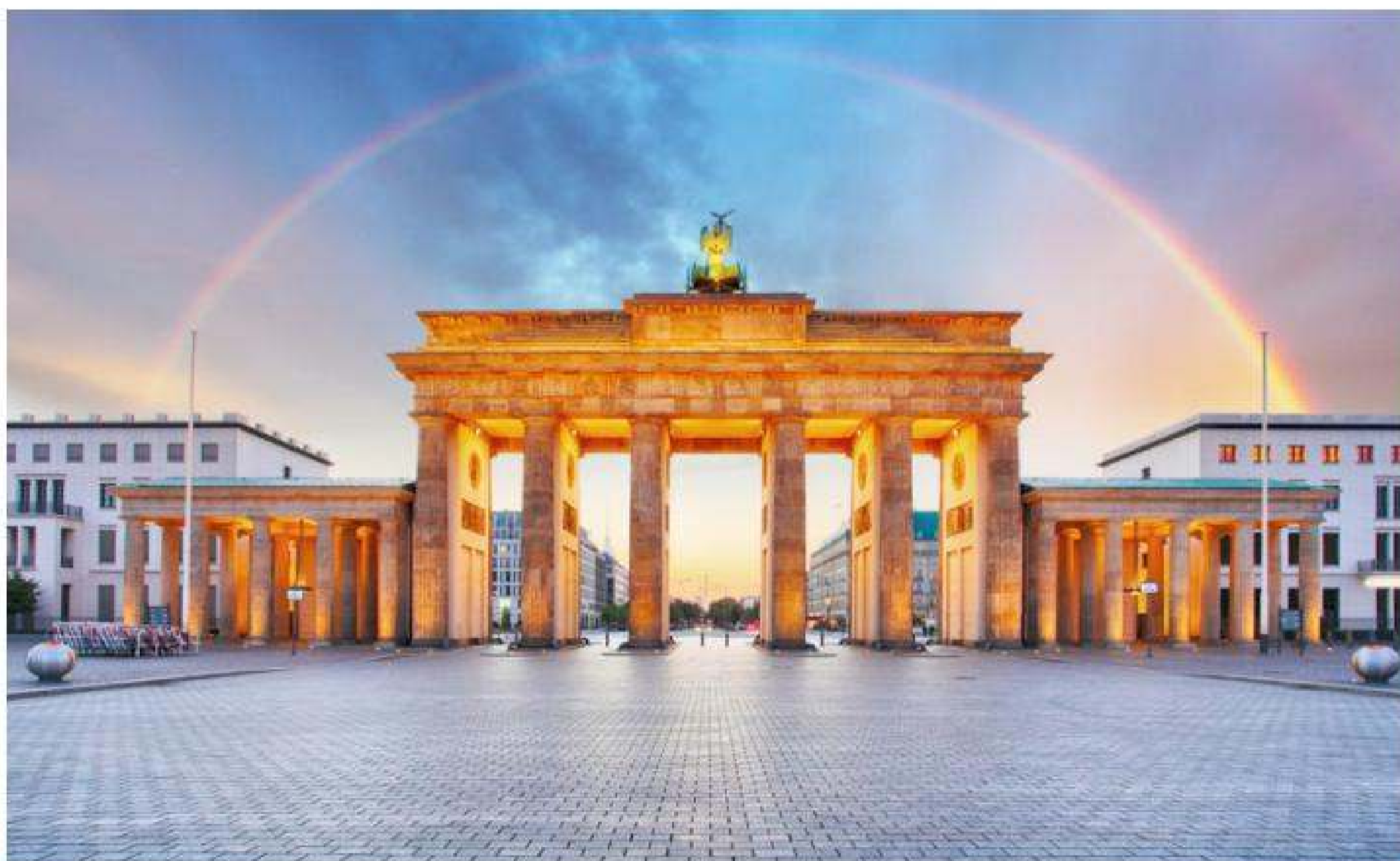
Brandenburger Tor of Berlin photographed in 2019.