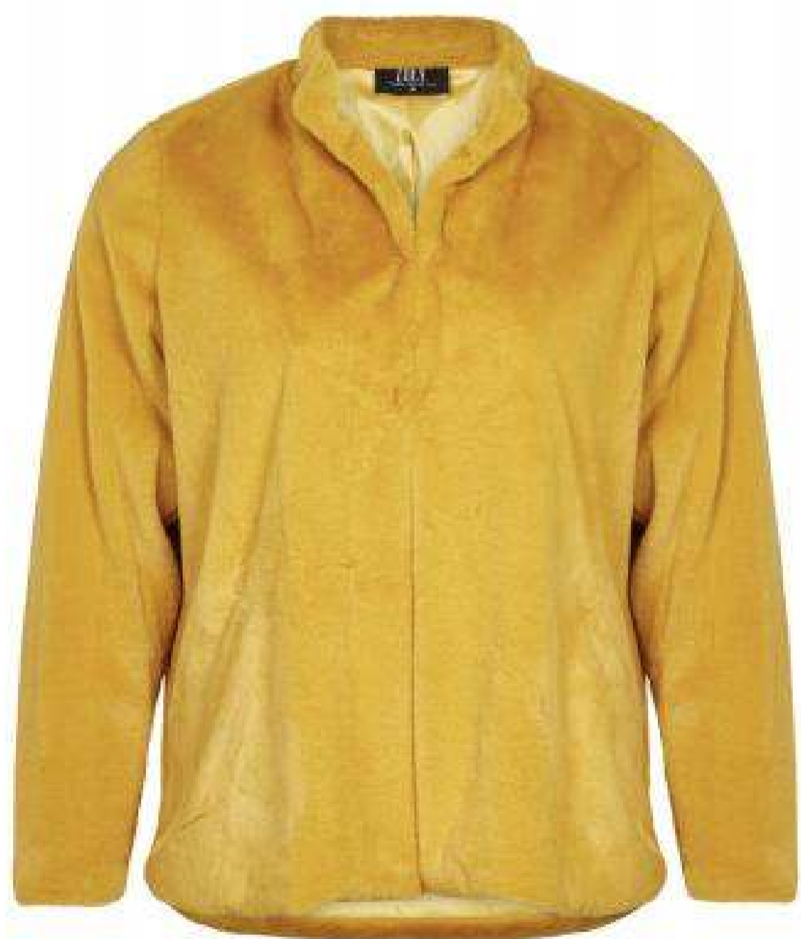
ELAINA SHORT JACKET