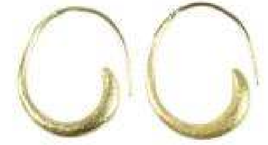
PURE NY NAT GOLD EARRINGS