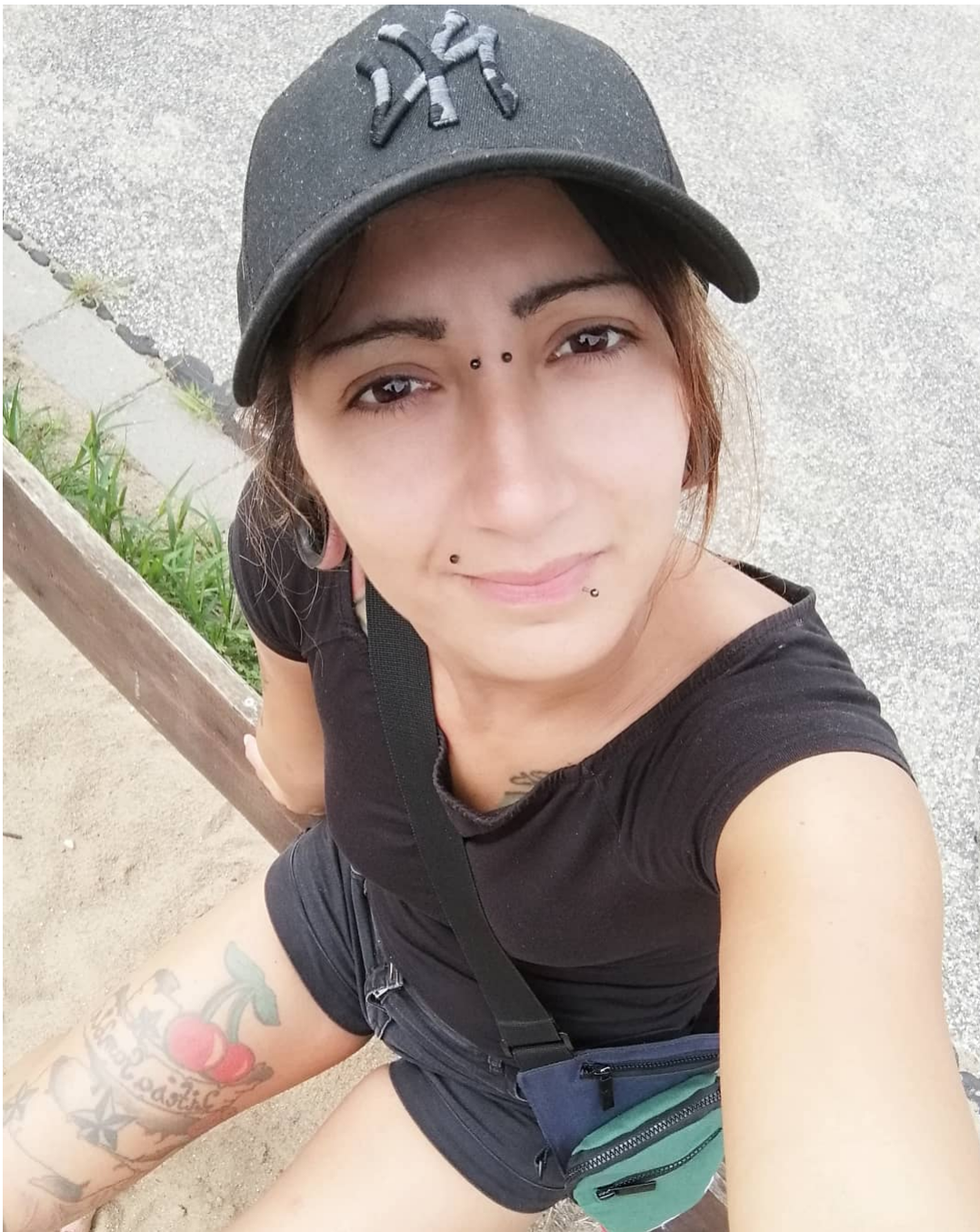
Never give up on your dreams if you get knocked down get right back up and try again #happy #smile #happymindset #strong #workout #protein #helthylifestyle #happylife #love #motivation #rocky #mmafighter #boxing #ufc #bodybuilding #mucles #stayhappy #positivevibes #goodvibes