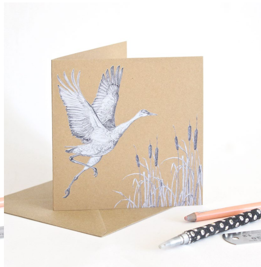
SANDHILL CRANE SSGC08