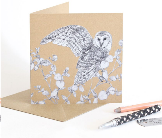
BARN OWL SSGC02