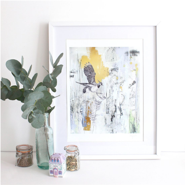
NORTHERN LAPWING A3 Size ... SSA3P07 A2 Size ... SSA2P07