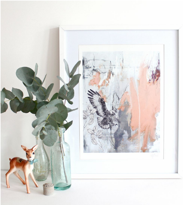
JACKAL BUZZARD A3 Size ... SSA3P03 A2 Size ... SSA2P03