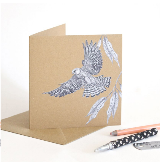
RED-FOOTED FALCON SSGC04