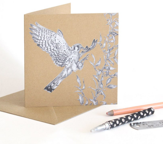
AMERICAN KESTREL SSGC01

14.5cm x 14.5cm 365gsm Recycled Card Recycled Envelope Included Blank Inside