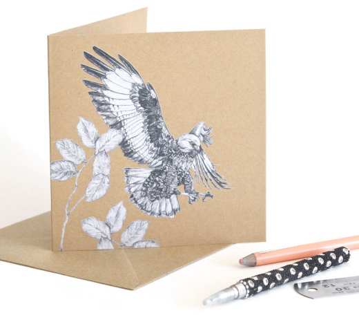
JACKAL BUZZARD SSGC03