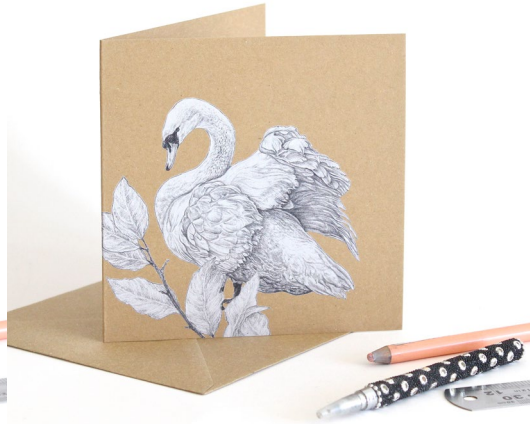
MUTE SWAN SSGC06