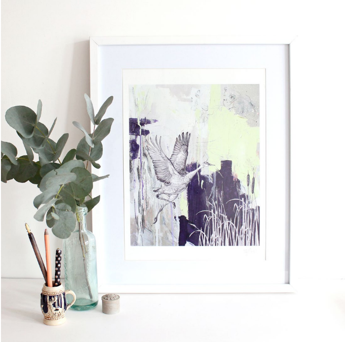
SANDHILL CRANE A3 Size ... SSA3P08 A2 Size ... SSA2P08