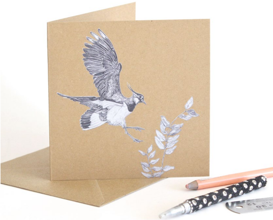
NORTHERN LAPWING SSGC07