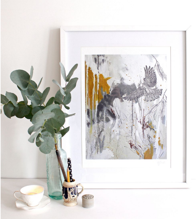
RED-FOOTED FALCON A3 Size ... SSA3P04 A2 Size ... SSA2P04