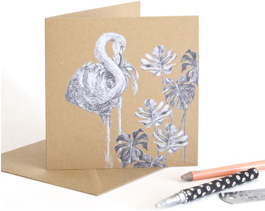
CARIBBEAN FLAMINGO SSGC05