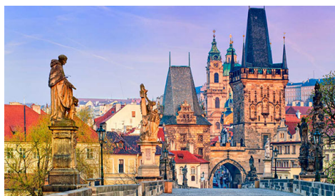
Prague: Its beauty and historical heritage make it one of the twenty most visited cities in the world.