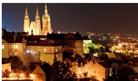
Prague: Evening transfer to the city centre included.