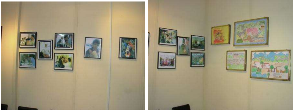
Some pictures and drawings by the children displayed in the staff room

The building has now a RCC structure with a steel roof and no quality-compromise was made while reconstructing the school. The building is now of an earthquake resistant structure.