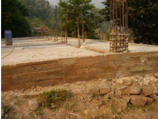
Primary wing under construction