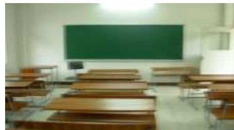
Interior design of the Boys High School.