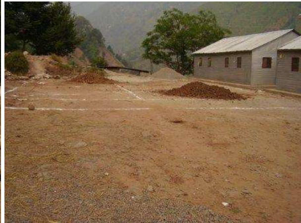
Soil testing pits for admin block

The designs, plans and the quality control reports of materials used in the construction are available in hard copies at our local partner's HOPE'87-Pakistan/ Islamabad Office for perusal.