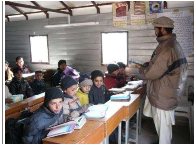
Children studying in the temporary class rooms

We hired one of the leading Architecture and Engineering firms M/S DESIGNMAN (Pvt.) Ltd. to design the structure and to provide consultancy services and quality certification during the course of construction. M/S DESIGNMAN also assisted in preparing and developing the Bill of Quantities for the works as well as selection of the contractor.