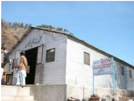
Temporary school rooms

Temporary School Rooms: as the school building was completely destroyed in the earthquake and building the permanent structure was a long process, an interim temporary education shelter with four class rooms was built, so that pupils of the primary section could continue their studies.