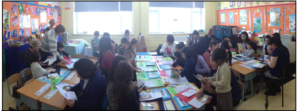
First grade students invited the special women in their lives to class to celebrate Women’s Day, as they shared in a variety of classroom activities.

(Right) Students, some donning their headgear for Hat Day, stand proudly with their Student of the Month certificates. The monthly awards assembly also included a presentation from the fifth grade classes during which the students shared photos and information about Mongolian provinces.