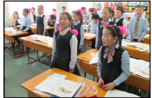
Elementary students from School 60 stand to greet visitors from ASU.