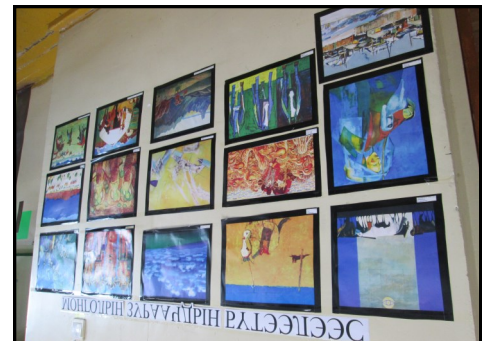
(Above) Artwork is displayed in School 60's gallery. (Left) Staff from both schools gather around School 60 students.