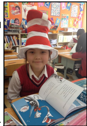
Students celebrate reading with Dr. Seuss.

This event is part of The National Education Association’s Read Across America Day, a nationwide reading celebration that takes place annually on March 2—Dr. Seuss’s birthday.