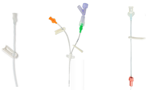
Premicath Nutriline Nutriline Twin-Flo