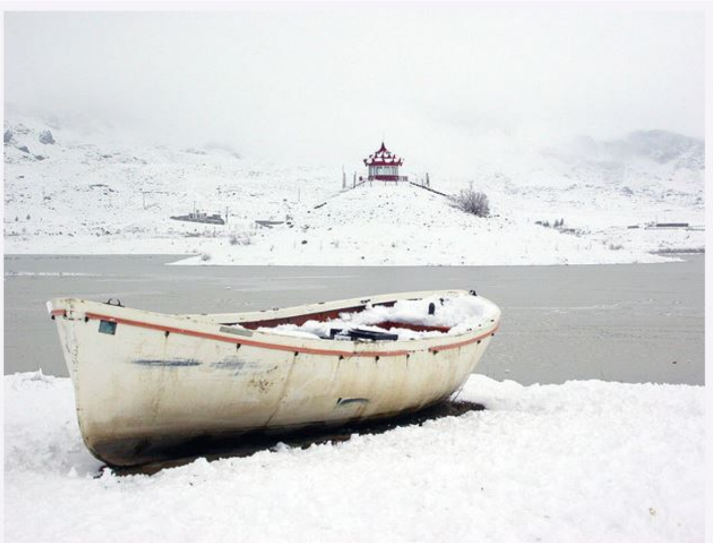
1) The Hannah Jheel, Quetta - This is how the Hannah Lake looks in winters. Frozen, frosted and astounding. This is where Quetta's escapes rest.