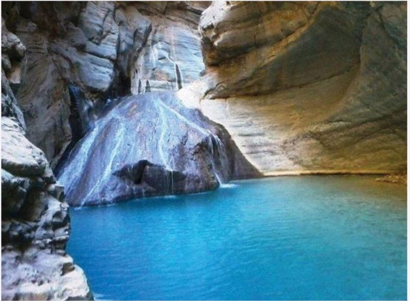
3) Moola Chotok, Khuzdar - This tourism deprived sight is known as Moola Chotok in Khuzdar, Balochistan. Amidst stronghold of nationalists in the Jhalawan belt, Chotok seems like a lost cause.