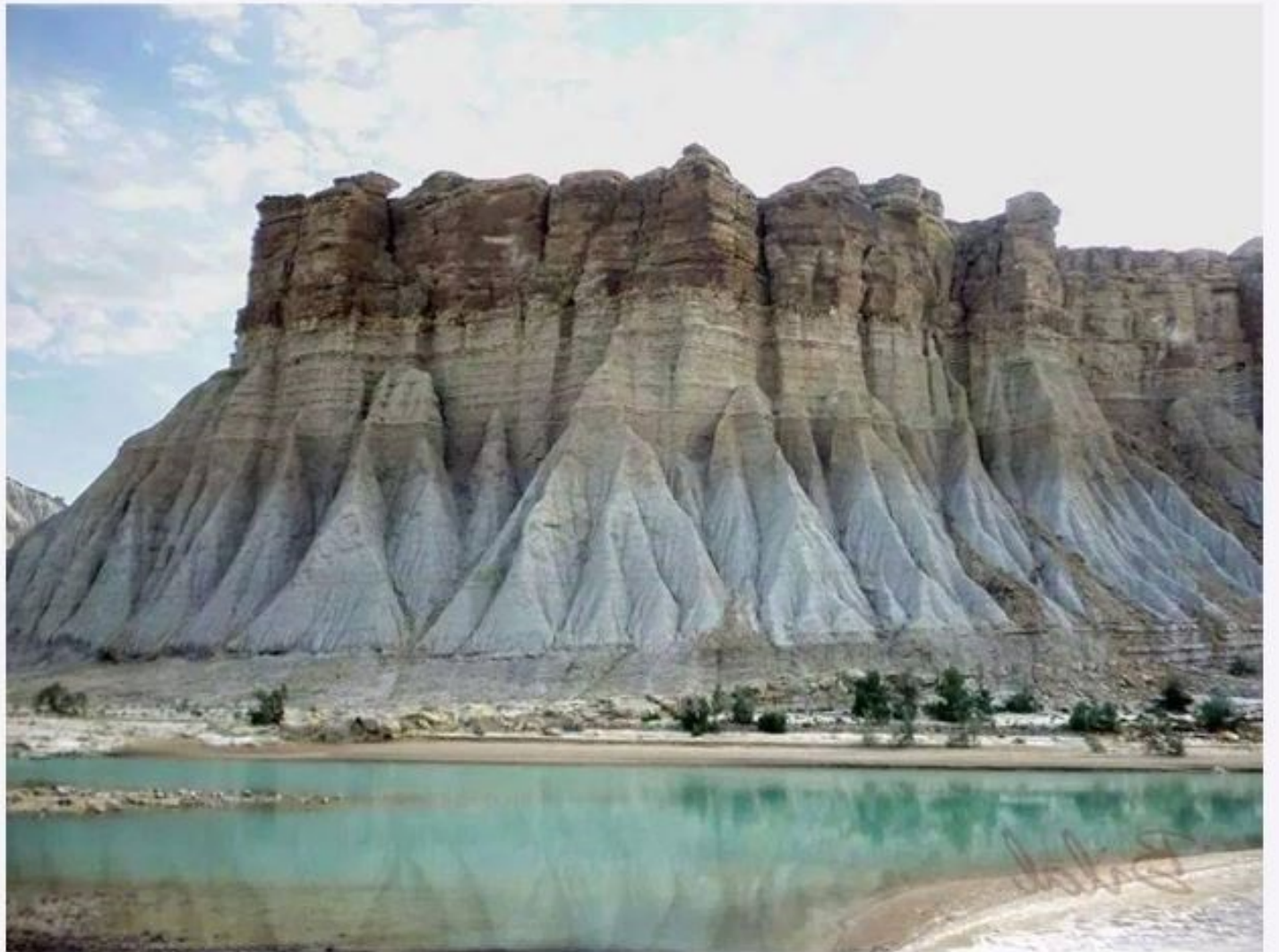
12. Hingol, Lasbela