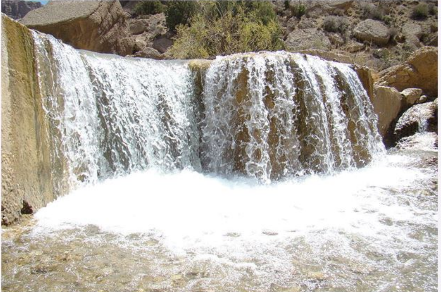
7) Urrak Falls, Quetta - The Urrak falls are known as the younger sister to the Hannah Jheel. Mentioned together as Hannah Urrak, Urrak is a fathomable vacation spot for people of Quetta and around. Fresh water and good weather.