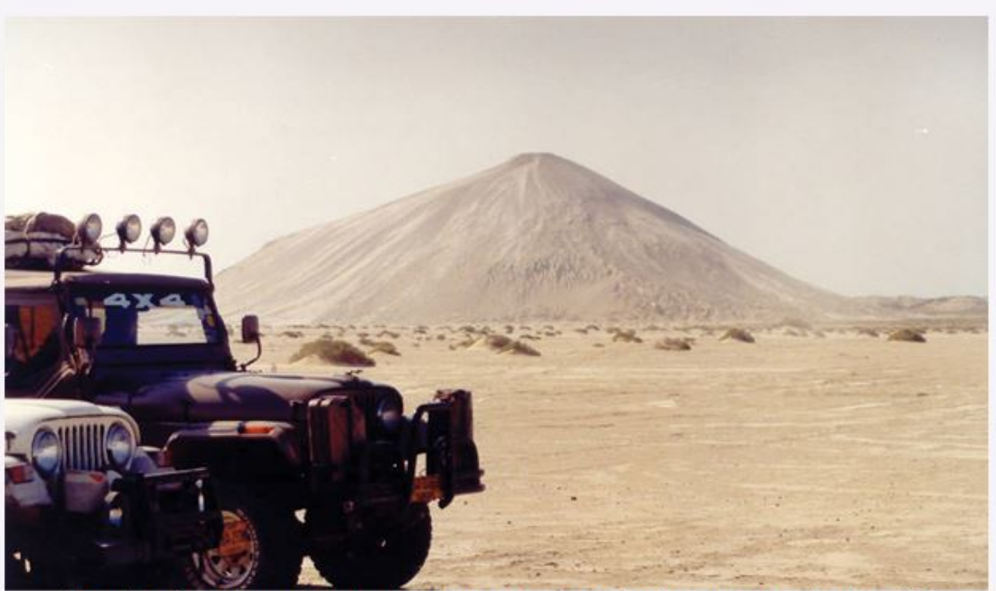
2) Mud Volcanoes, Hingol - These deserted Mud volcanoes can be found in different regions of Balochistan. This particular one rests in Hingol, Balochistan.