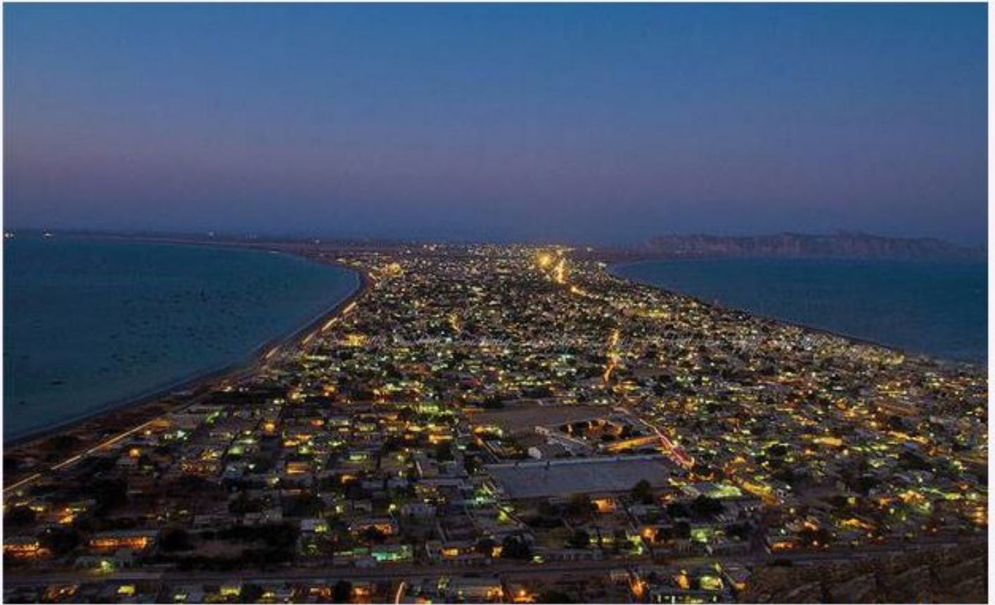
9) The City of Gwadar - A city separated by the sea at both ends. Gwadar has the potential to be the trade hub of Pakistan. It is not just resourceful – also is breathtakingly beautiful.