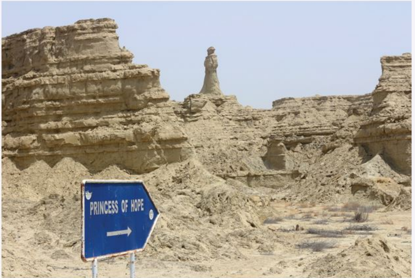
6) Princess Of Hope, Gwadar - The Princess Of Hope is a 740 year old mountain near Gwadar, along the Makuran Coastal Highway. A spectacular view of its own!