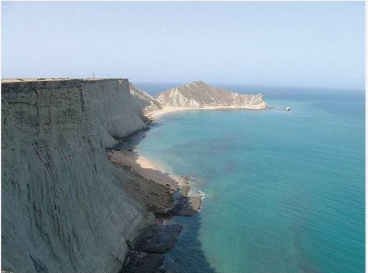
8) Astola Island, Gwadar/Pasni - Astola Island, also known as Jezira Haft Talar Satadip or 'Island of the Seven Hills', is a small uninhabited Pakistani island in the Arabian Sea. Also the largest island in Pakistan, it is the epitome of Balochistan's undermined beauty.