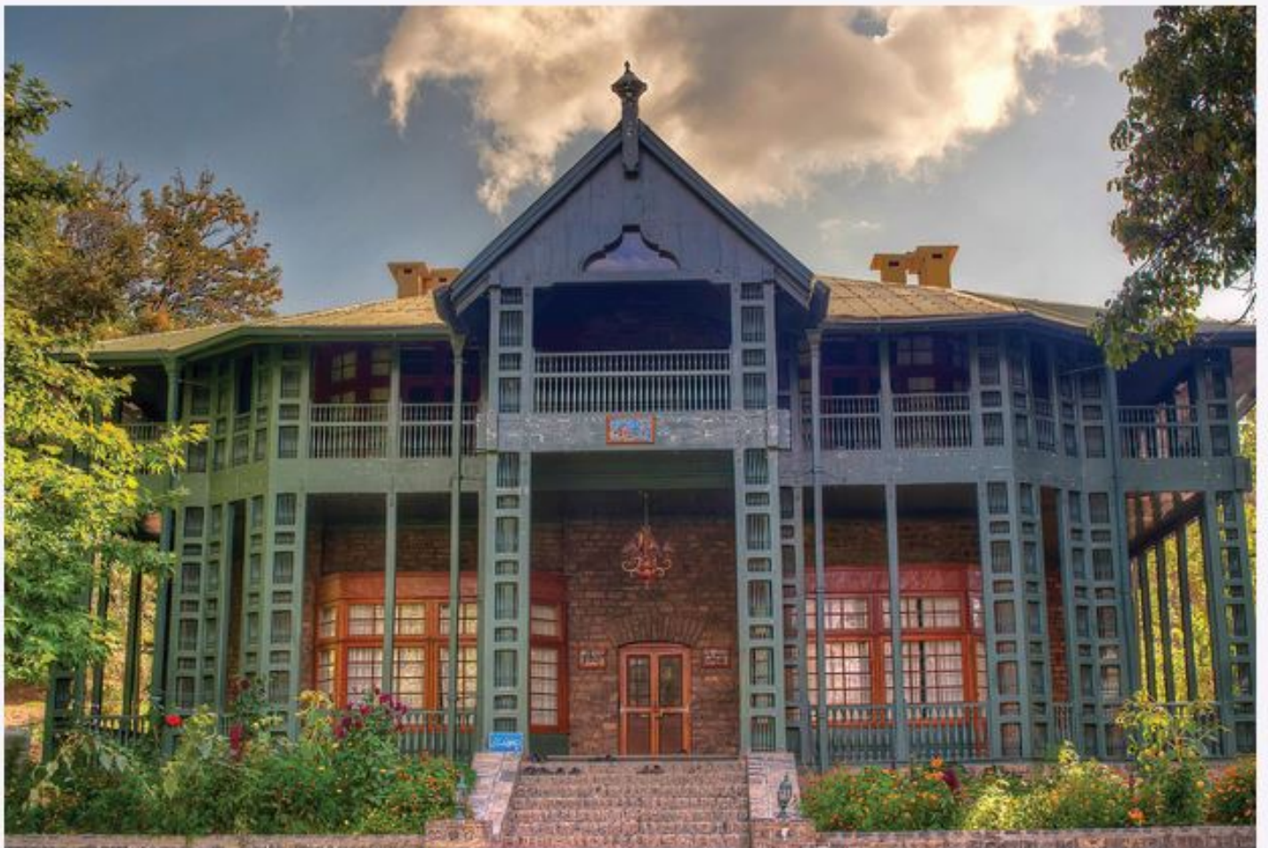
4) Quaid-e-Azam Residency, Ziarat - Father of Pakistan, Quaid-e-Azam Mohommad Ali Jinnah spent his days of affliction in this wooden cottage in Ziarat, Balochistan.