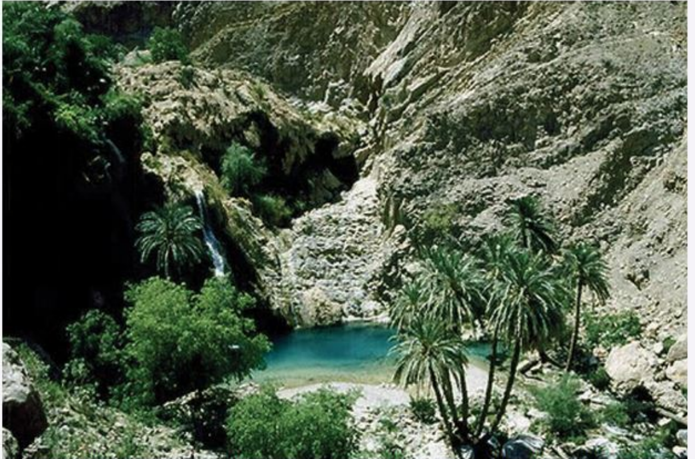
5) Pir Ghaib Falls, Bolan - This is an awe-inspiring view of Pir Ghaib, Balochistan. Locals here believe in the myth of the Invisible Saint (Pir Ghaib), who was saved by the Almighty.