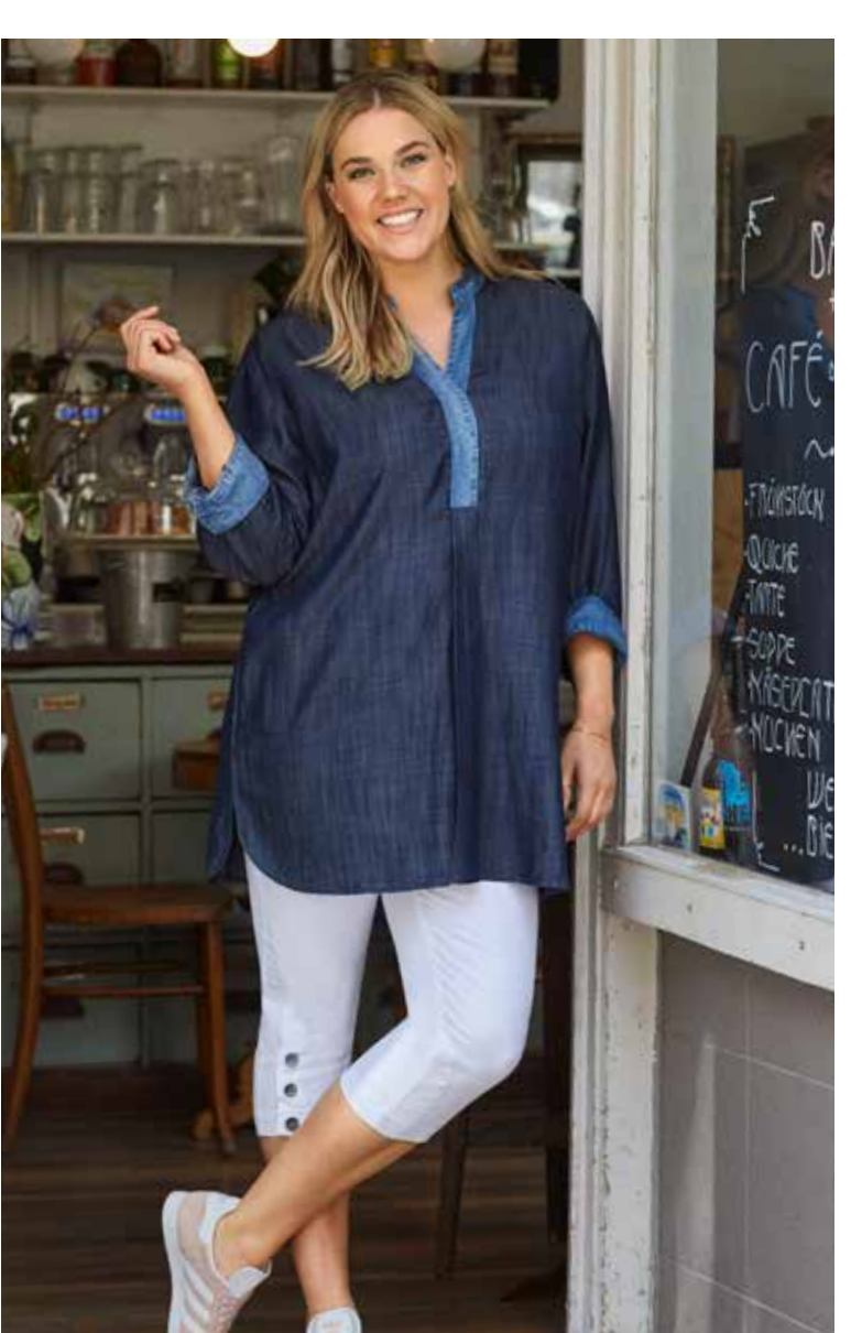
TUNIC 208866 PANTS 200052