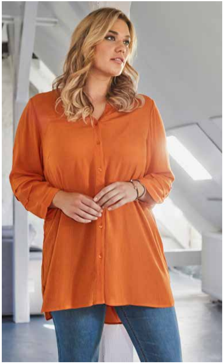
Orange and blue are some of the dominant colours this season. Combine them with cool print and comfortable denim.