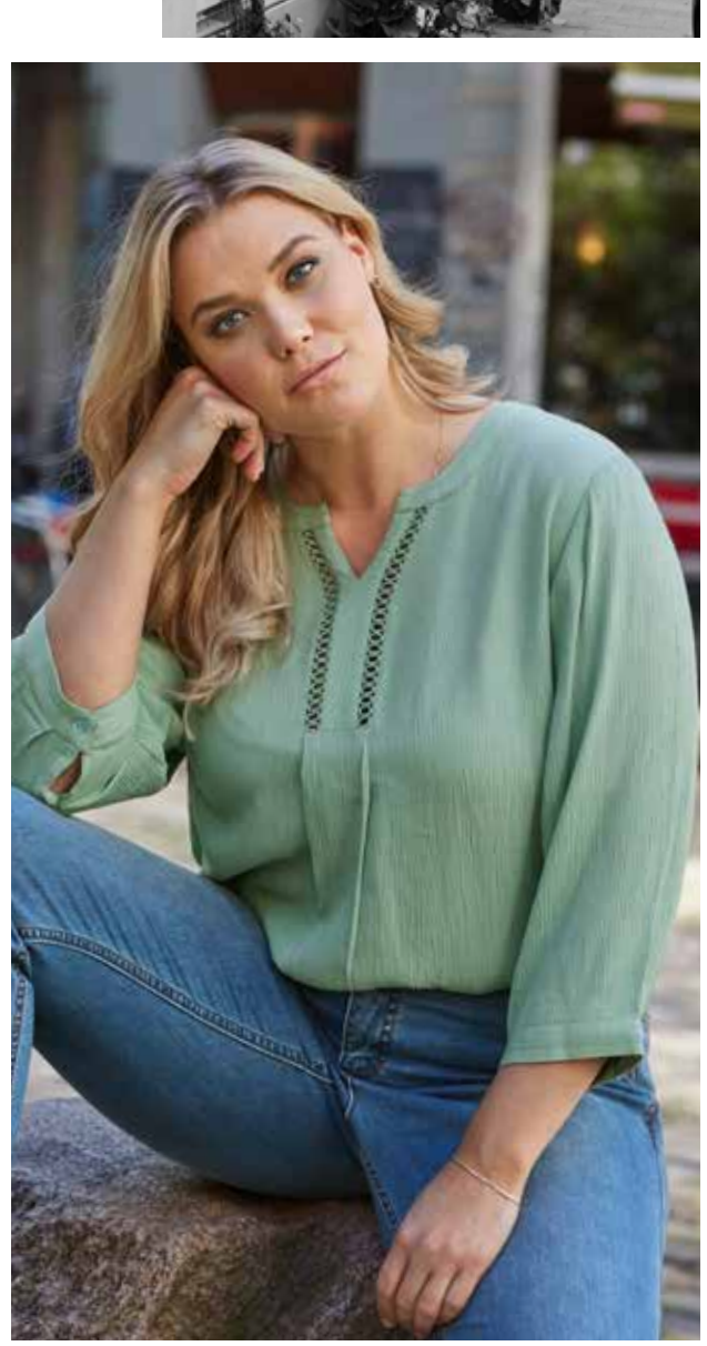
BLOUSE 208764 JEANS 208911