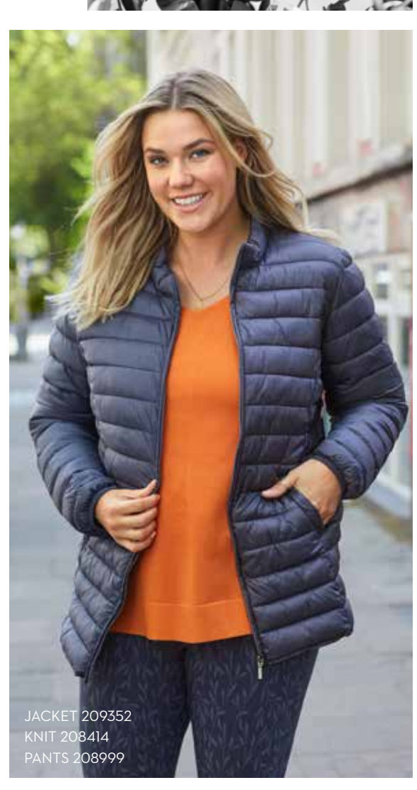
The CISO Spring 2020 collection is designed for you and your curves. All the beautiful colours and great fit that your personality deserves.