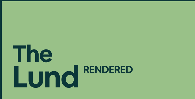
The Lund RENDERED