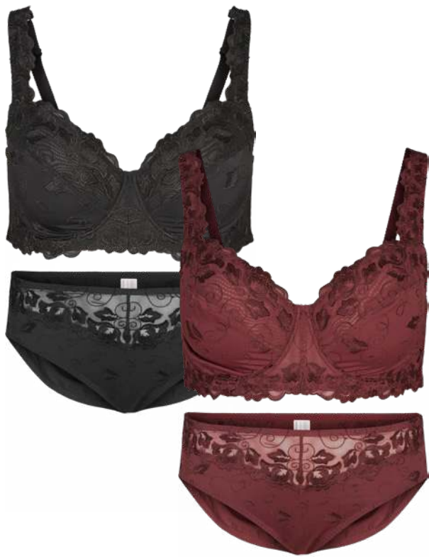
Bra 299,95 Briefs 179,95