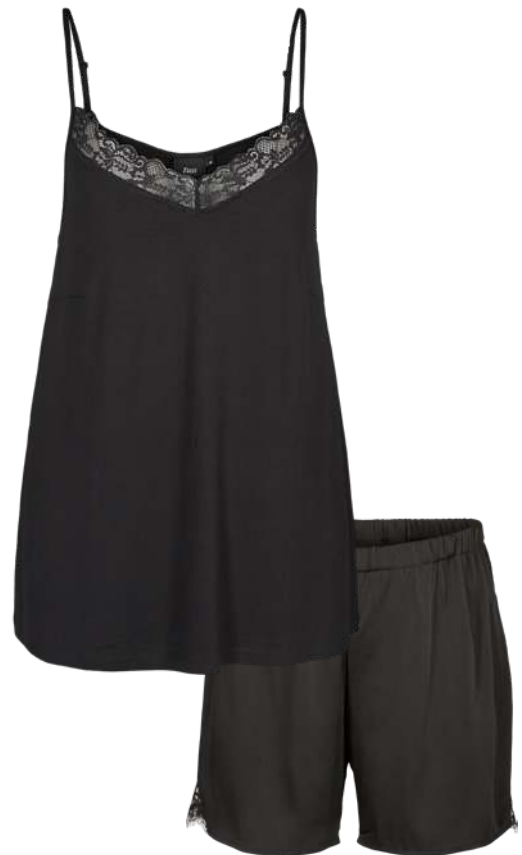
Top 199,95 Shorts 199,95