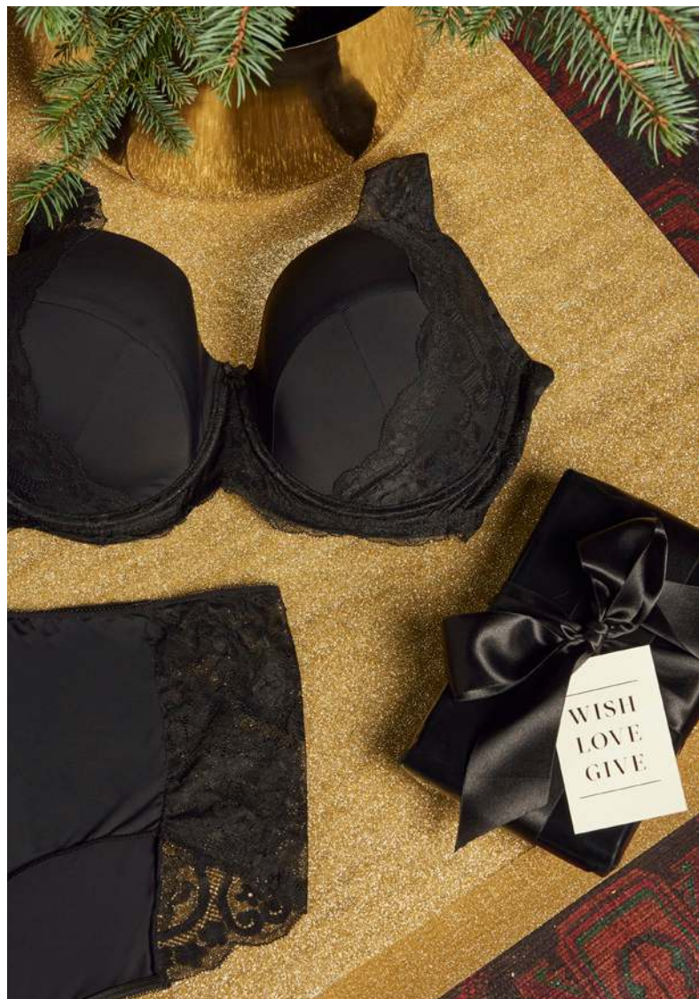
Bra 299,95 Briefs 179,95