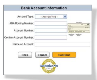
eCheck.Net® eCheck.Net provides an additional payment option on your website checkout form.