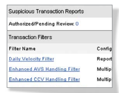
Advanced Fraud Detection Suite<sup>TM</sup> (AFDS) AFDS includes multiple filters and tools that work together to evaluate transactions for indicators of fraud.