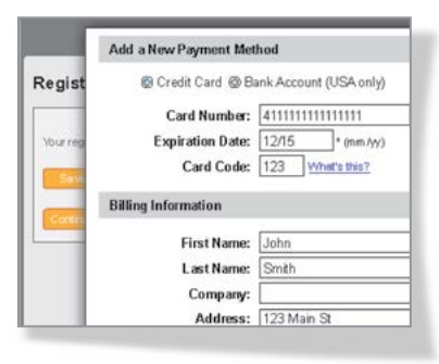
Customer Information Manager (CIM) Your customers can enter sensitive data directly onto Authorize.Net-hosted pages without leaving your website.