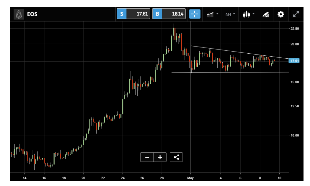
Exhibit 2: Evolution of EOS/USD price since mid-March, showing a possible descending triangle forming in the last few days. Note that the scale is logarithmic.

However, the price of EOS , both when looking from a short-term and long-term point of view, will definitely depend on the main net launch and the performance of the network when operational, which could render any traditional chart patterns unusable