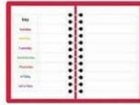
Not Following a Plan