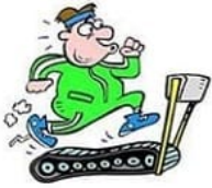
Too Much Cardio