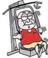
Not Training Hard Enough