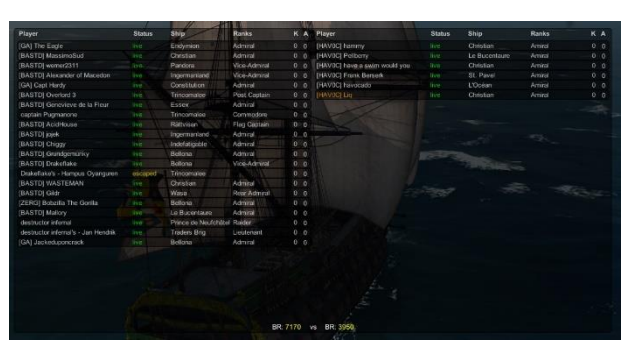
GB tries to remove the blockade