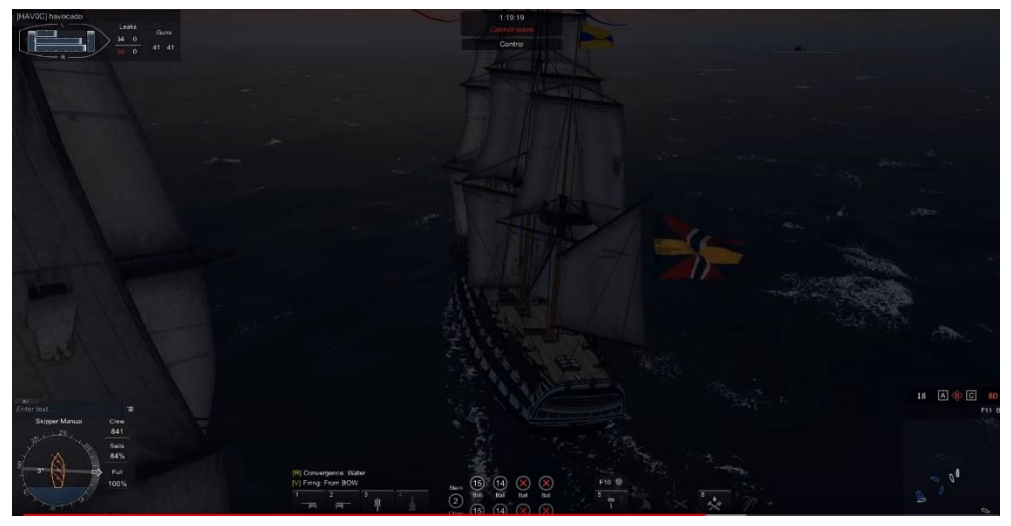
Havocado (Rediiiiii) sinking to leaks.

took. They took the border ports of Mantua and flag, took the region as retribution for the Corrientes respectively and yesterday made an attack on Pinar del Rio itself! It was not successful but the relative strength of the two coast of Cuba. Here they settled for many nations is swinging in favour of the Spanish. Swedish sources have stated that it is due to a Spanish screening fleet, that they were able to comfortably win Conttoy. Can Spain take Pinar del Rio? Possibly. If they manage to remove the Unfortunately they were unable to achieve Prussians from the area will they return to the shadows once more? Or will they perhaps cast county capital ports being the first port of again, the vengeful cycle between Spain and GB, that has continued unabated for years. I'm for the latter, it'll be much more amusing.