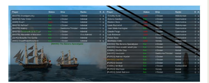
BASTD hostility against newly acquired Swedish ports near the free port of Tumbado.