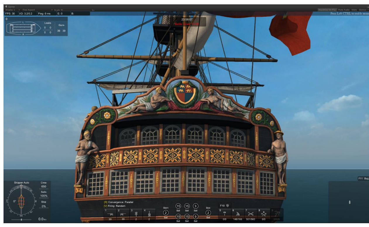
Wrecker De Ruyter Stern Gallery

A truce and possible alliance has emerged between the two largest powers in the Caribbean which has already seen several dozen ships lost.