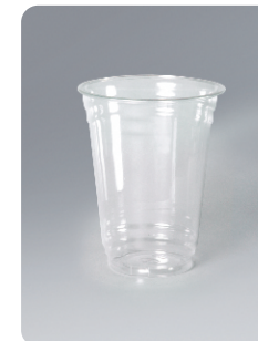
7 Oz PET GLASS D 80 x H 80 8 Oz PET GLASS D 80 x H 100 10 Oz PET GLASS D 80 x H 112