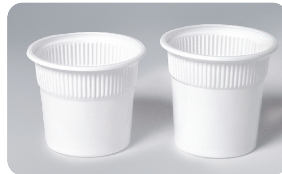
4 Oz BRU D 68 x H 57