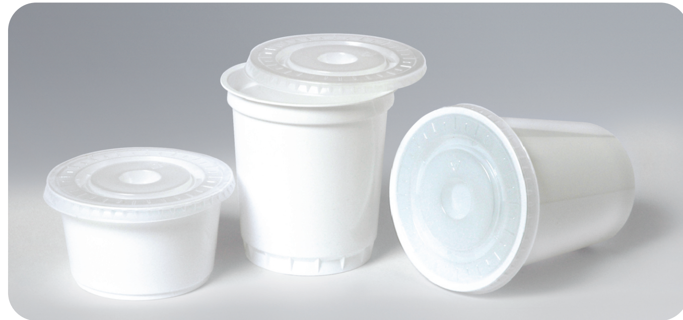
7 Oz CURD CUP D 95 x H 55