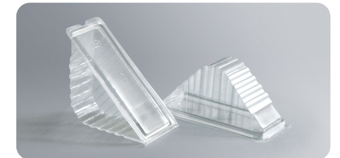
SANDWICH BOX L 185 x W 80 x H 80