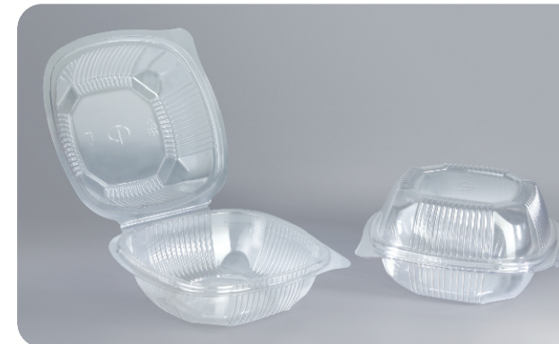
BURGER BOX L 135 x W 135 x H 40