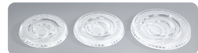
76 DIA FLAT LID D 76 x H 8

STRAW CUT HOLE OPTION AVAILABLE IN ALL SIZES.