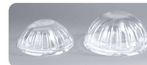
80 DIA DOME LID D 80 x H 34