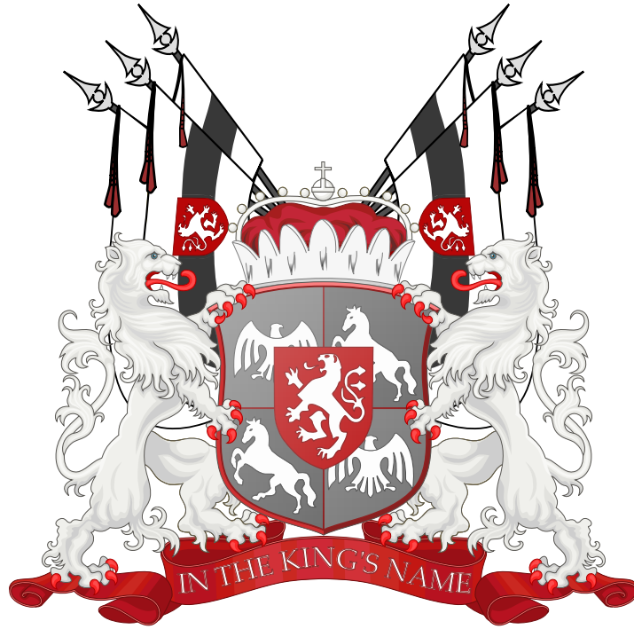
Figure 4. The Coat of Arms of Varkonia.