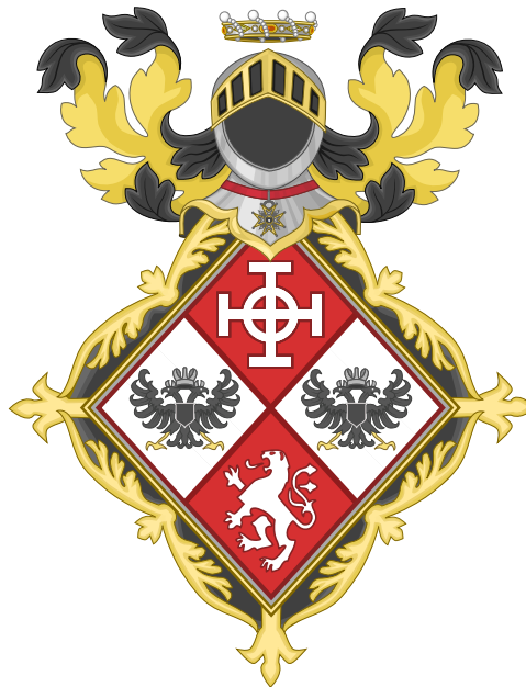
Figure 1. The Coat of Arms granted to HIH the Prinz von Batavien. The Coats of Arms it is derived from can be seen in Supplementary Figures (pages 3–4).

Therefore, upon publication of this document, Baron Justitiaria shall be granted the title of Prinzgemahl , and shall henceforth take the style of His Imperial Highness Prinz Justitiaria, Baron von Batavien and Hallowed Diplomat of the Benevolent Rex , shortened to HIH the Prinz von Batavien . The Coat of Arms granted to him is shown in the figure below (figure 1).