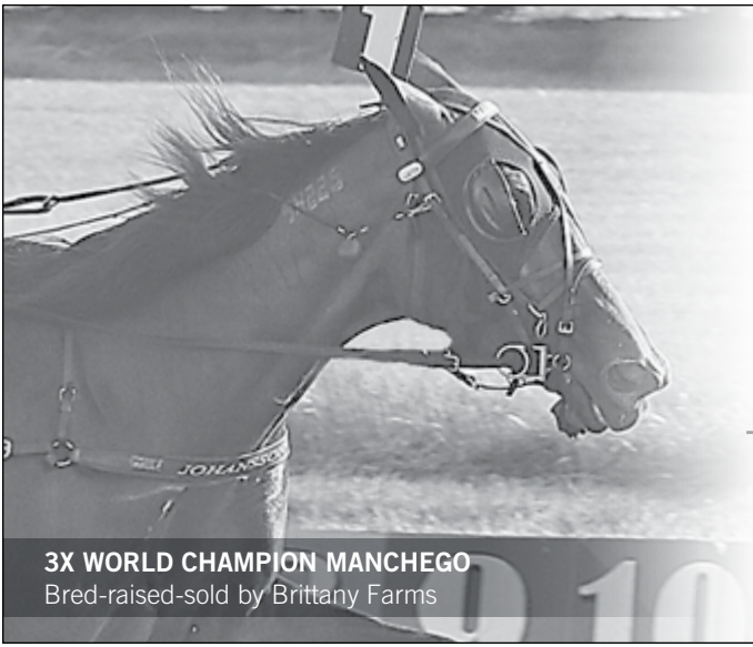
3X WORLD CHAMPION MANCHEGO Bred-raised-sold by Brittany Farms