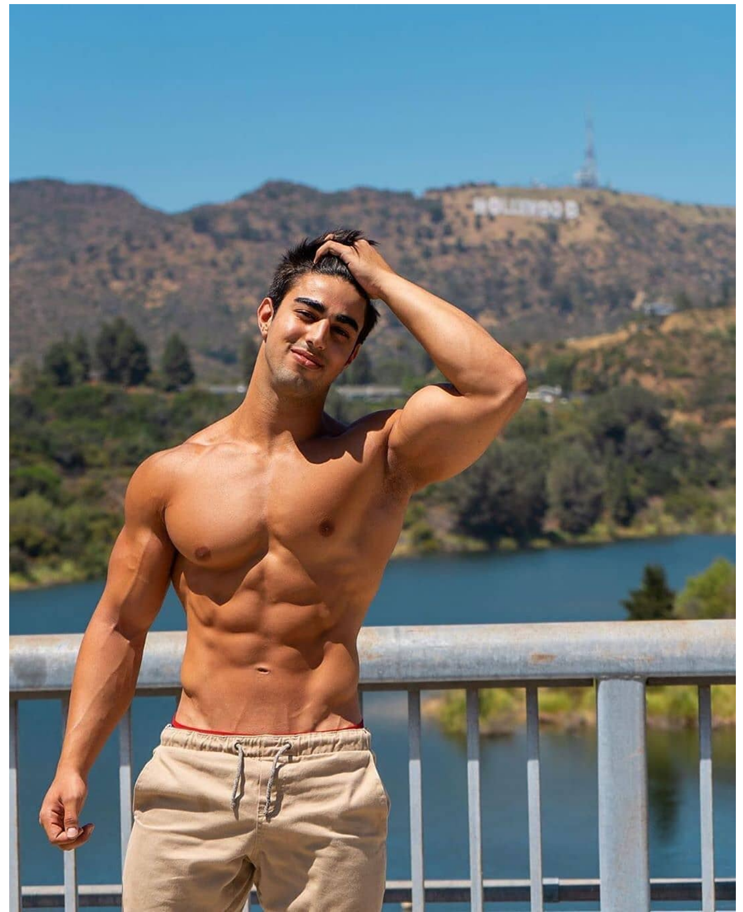
#Soretodaystrongtomorrow #Onlinefitnesscoaching #Healthybodynutrition #Coachesofinstagram #fitnesschallenge #Healthymindhealthylife #Personaltraineronline

https://www.caringbridge.org/visit/innamorozova/journal/view/id/5f691ec03c4e7b117b8a8114