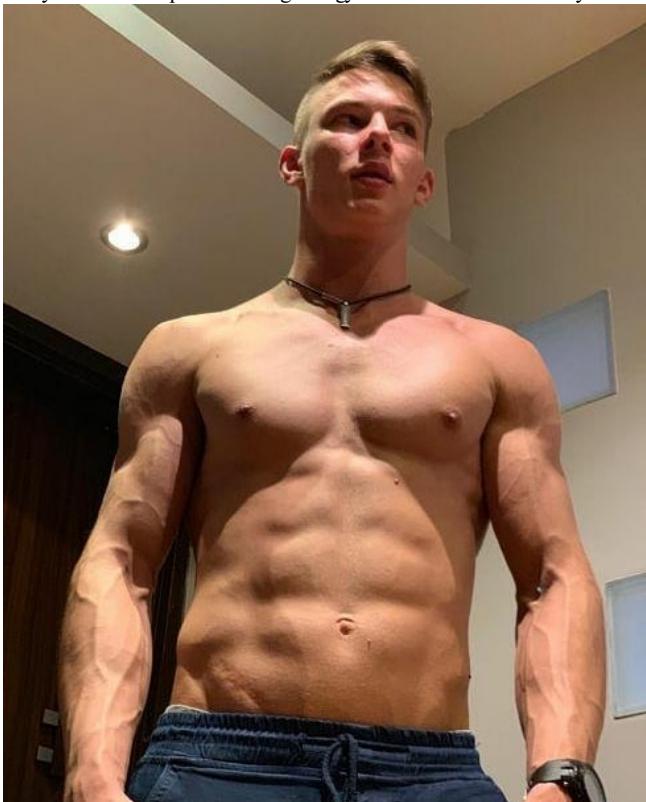
#vegan #vegan #training #train #choochoo #allaboard #popeye #spinach #deadlift #cleanandjerk #cleanandpress #iifym #fitness #sydney #lifting #leagueofcans #gains #muscles