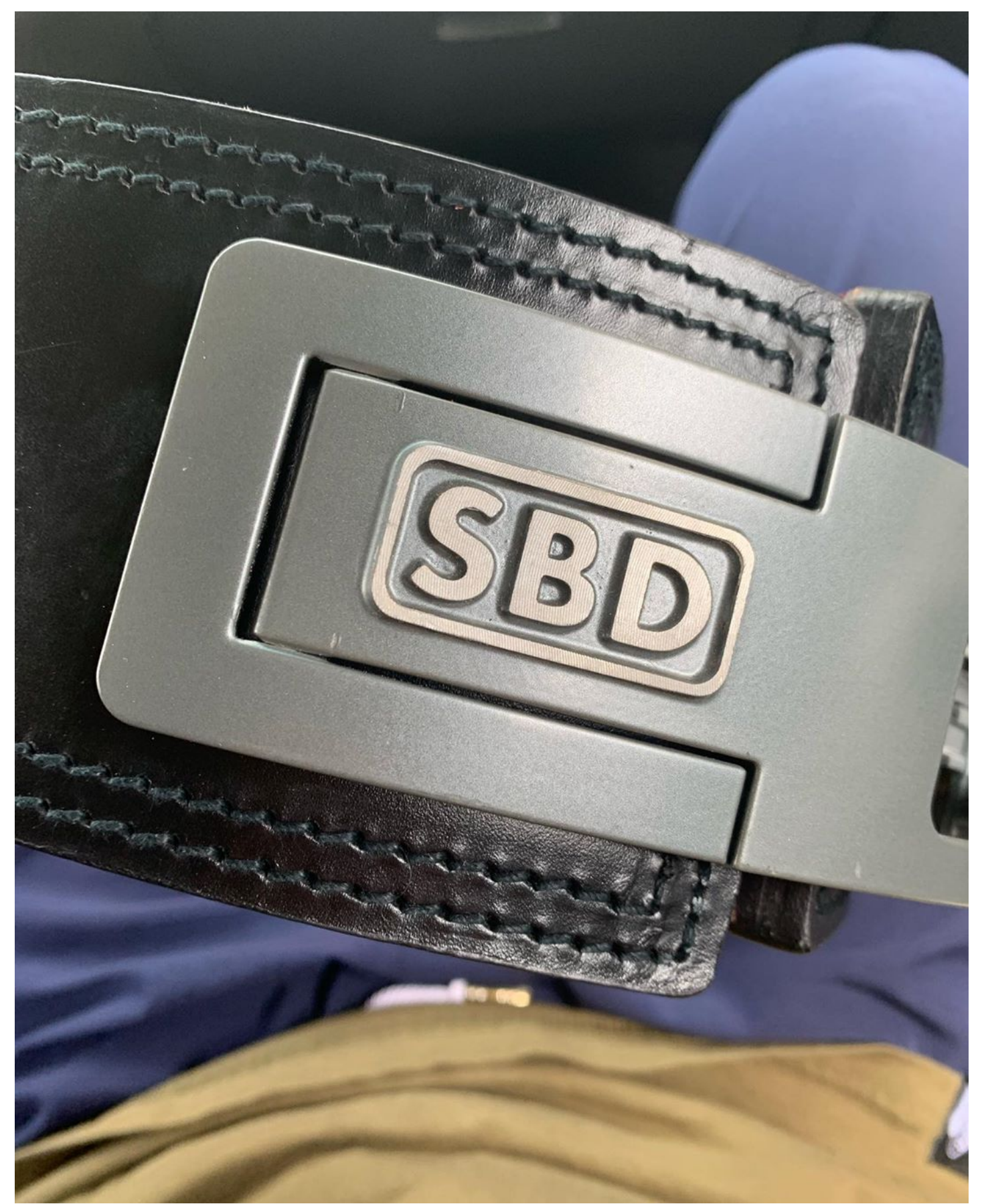
I found taking a day off from all exercise doesn't work for my mental health. So rest days are essentially cardio and mobility