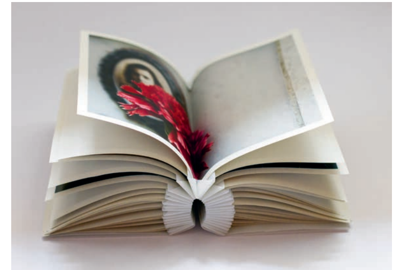
Last Portrait (2019) © Sonia Lenzi

The photobook is important for me as it either signals the starting point of a collaborative process or, once published, becomes accessible to the general public. While people often come into contact with it within domestic spaces, the photobook is also a powerful form of public art. It can be encountered in libraries and art galleries, even cafes, parks, buses, trains. The photobook makes art accessible to everyone.