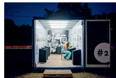
World in Transition (Kassel/Rostock, 2018/2016) © Marvin Ibo Güngör / Thekla Ehling