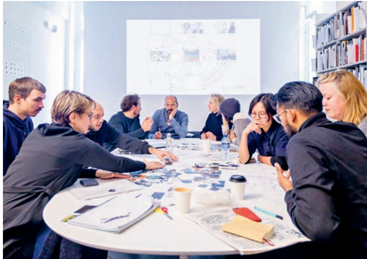
Photobook RESET (C/O Berlin, 2018)

Self Publish, Be Happy was established in 2010. How has the photobook field been developing since then?