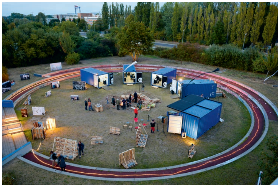
World in Transition (Rostock, 2016)

Your involvement in the photobook world started in 1995, when Schaden Verlag was founded. Can you share your perspective on the development of the market since the 1990s?