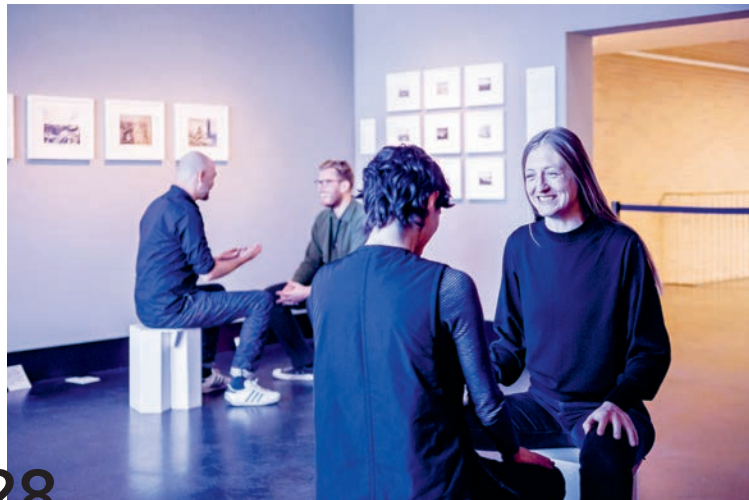
Photobook RESET (C/O Berlin, 2018)