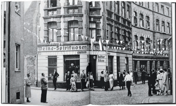
Chargesheimer: Unter Krahnensäumen: Bilder aus einer Straße (Reprint by Schaden Verlag, 1998)