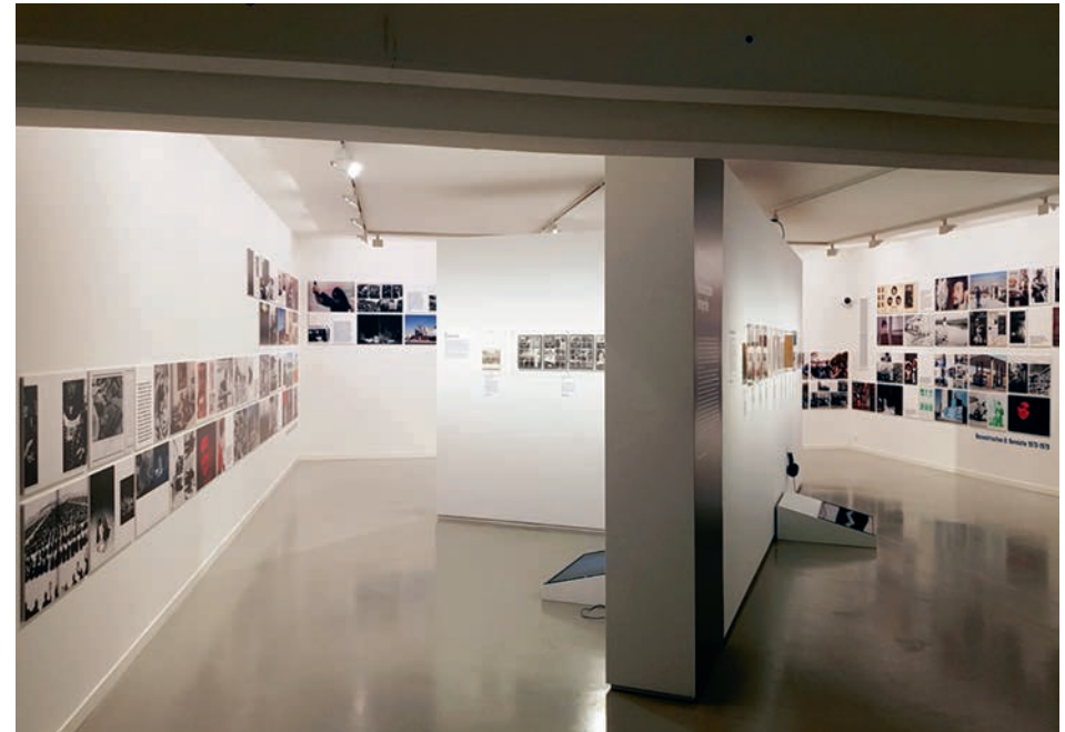
Enghelab Street, A Revolution through Books, Iran 1979-1983 (Fotomuseum Antwerp, 2019)

You curated the exhibition Enghelab Street, A Revolution through Books, Iran 1979-1983 that debuted in early 2019 at LE BAL, Paris, and later was on show at FOMU, Antwerp. The starting point of the exhibition was your own collection of albums of photographs and political publications, published in Iran after the fall of the Shah regime and before the rise of the Islamic government. How did you collect these works?