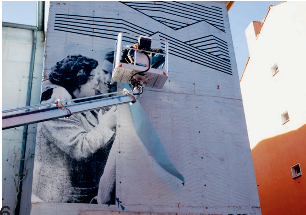
The Chargesheimer Projekt – Preview (Cologne, 2018)

‘Such a project will not work if it simply intrudes into the public space. We have to do it together – as a street and as a community.’