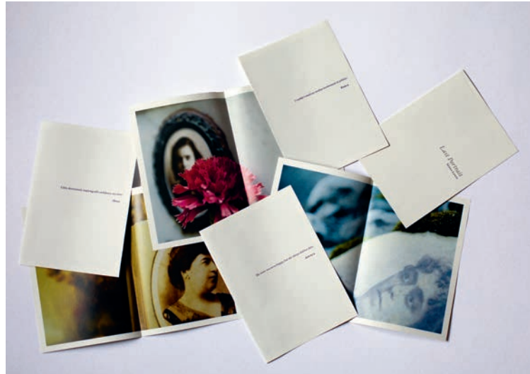
Last Portrait (2019)

Could you tell us about your recently published book Last Portrait ?