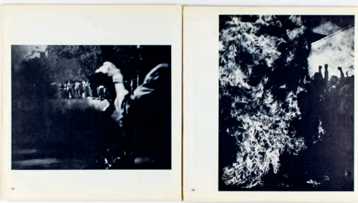
Riot by Kaveh Golestan & Mohammad Sayad (1979)