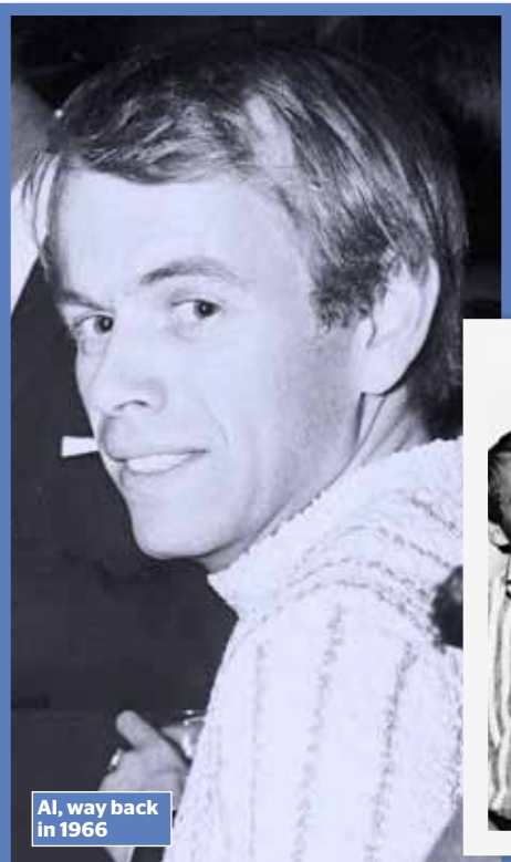
Al, way back in 1966

Al Jardine and Brian Wilson are currently on a world tour to celebrate the 50th anniversary of their seminal album, Pet Sounds . For further information about UK dates, visit brianwilson.com