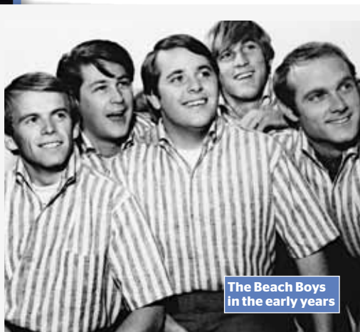
The Beach Boys in the early years