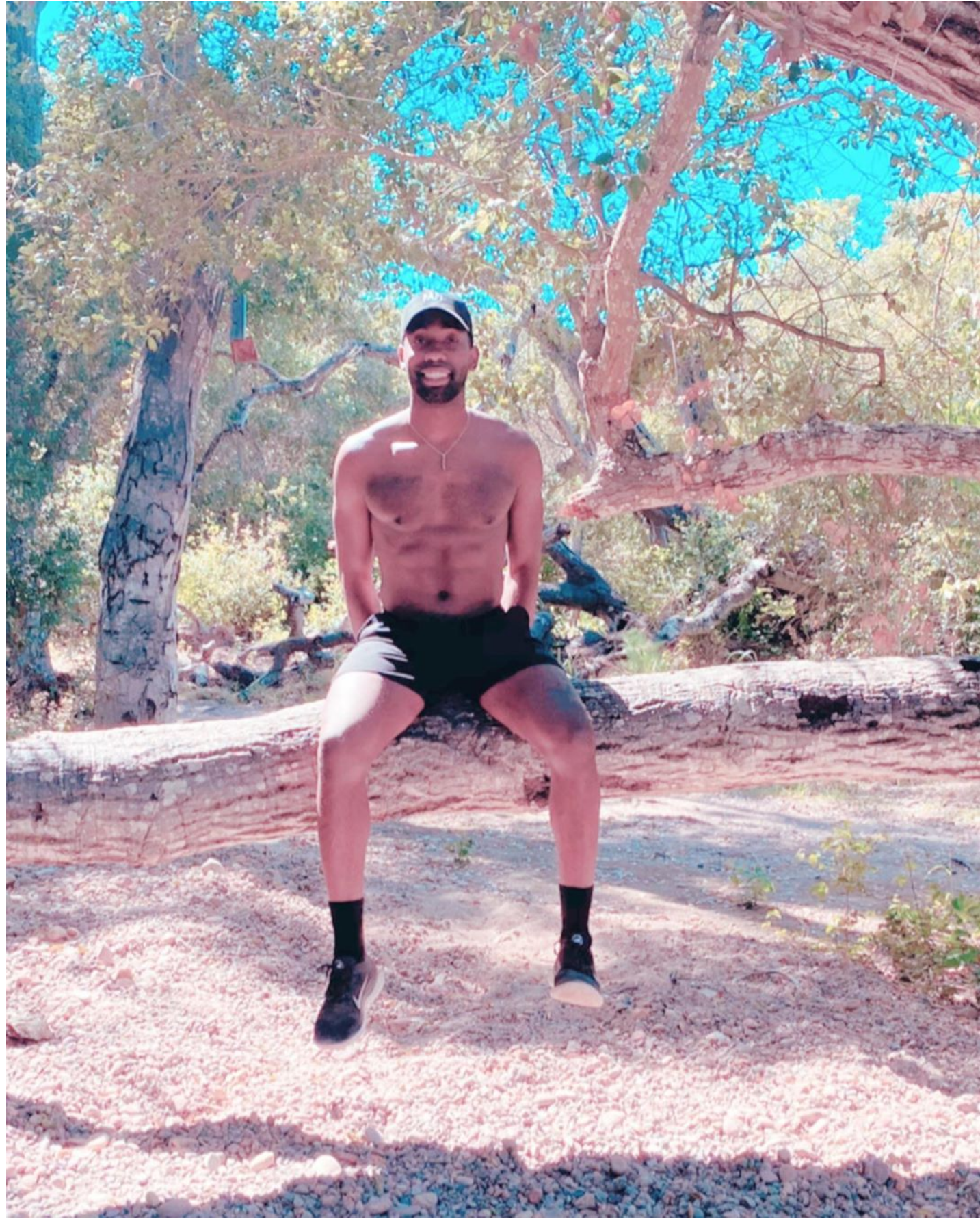
If not...then it was a learning opportunity. Just like anything we don't achieve or the things we do succeed at in life, it's all a learning experience to bring us to the next thing or challenge because that's what ultimately makes you feel alive!

\underline{http://uzuraemin.over-blog.com/2020/05/turinabol-20-mg-by-para-pharma-buy-online-uk-100-tabs-1.1.html}