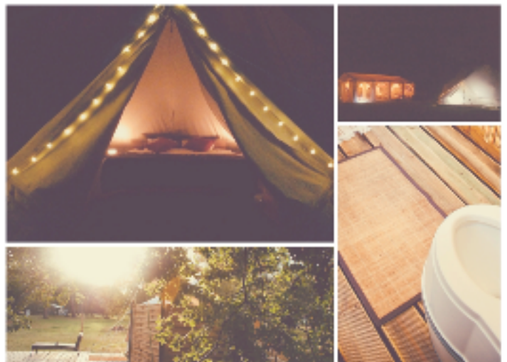
COSY CANVAS W/ ENSUITE

Following a perfect day at the beach and a spot-on meal on the decking under the stars, fall asleep to the sound of silence. Wake up to the sound of the birds, roll off your King Size memory foam mattress and slide back those Egyptian cotton sheets. Don your shades as you open the awning of your private 24m 2 "Ultimate Emperor" Bell Tent. Step out onto the decking where breakfast will be served. You can always pop to the loo first of course, but you'll have to take the side entrance to your private WC... with full-size toilet seat and electric flush. A King (or Queen) upon the throne.