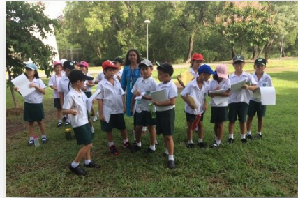
Science Activity by Grade 3 Bright Owls