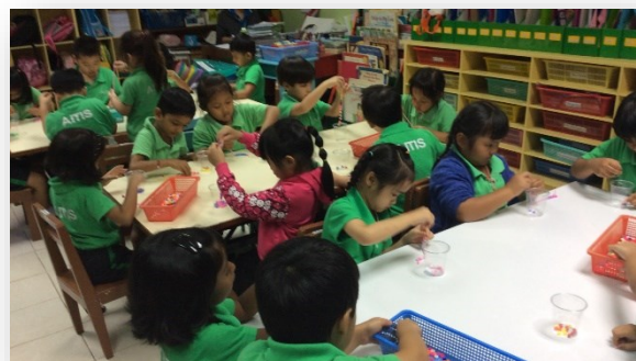
KG- Dynamic Dolphins had Math activity on 'Sorting by Colors'. The children sorted out the beads cups by colors and then made bracelets using the sorted beads.