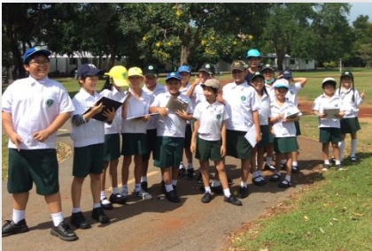
Science Activity by Grade 3 Unique Unicorns