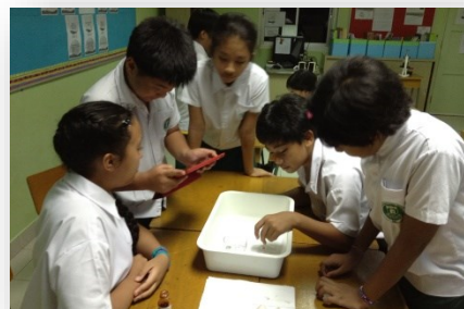
Science Activity by Grade 6 Explorers