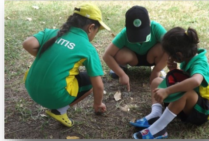
Science Activity by Grade 1 Eagles