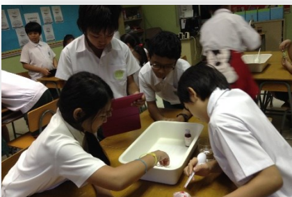
Science Activity by Grade 6 Explorers