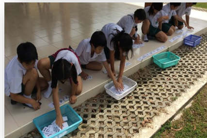
Math Activity by Grade 5 Voyagers