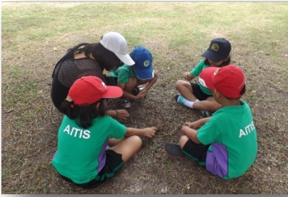
Science Activity by Grade 1 Eagles