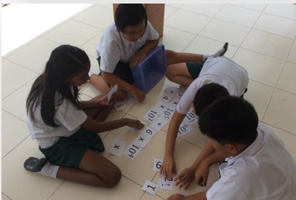
Math Activity by Grade 5 Voyagers