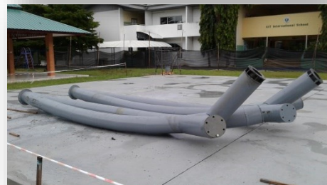
PE/Assembly Pavilion Under Construction