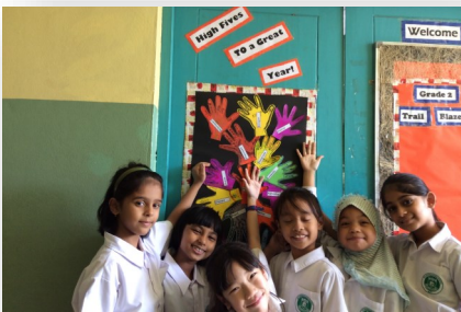
Grade 2 'Trail Blazers' Creative Hands at Work"