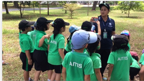
KG- Jolly Kittens had their nature walk. They collected living things and discussed difference between living and non-living things.