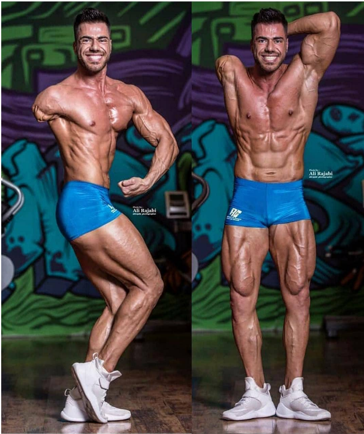
#benicetoyourself #embraceyourself #embraceyourbody #loveyourself #loveyourbody #health #healthiswealth #bodybuilding #weighttraining #yoga #treepose #plowpose #hikingadventures #hikingtrails #hiking