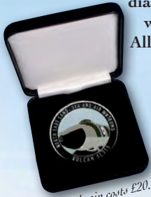
A general coin costs £20.00.

The coins are two inches in diameter and come complete with a presentation box. All are beautifully cast from brass alloy.