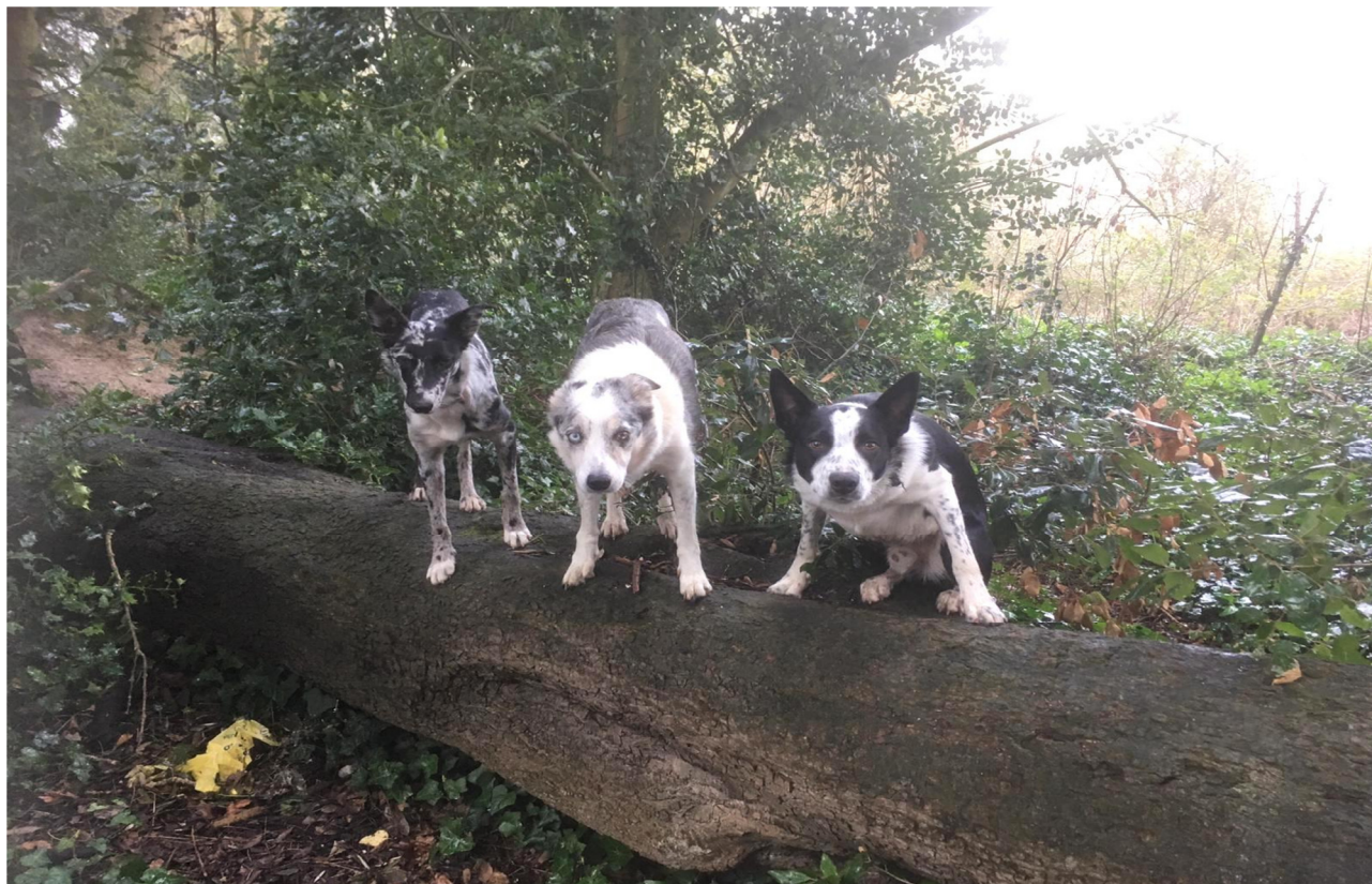
Dog's on a very big log!

In these unprecedented times as Chairman of our club can everyone please stay safe and hopefully later in the year we can resume our meetings and events.