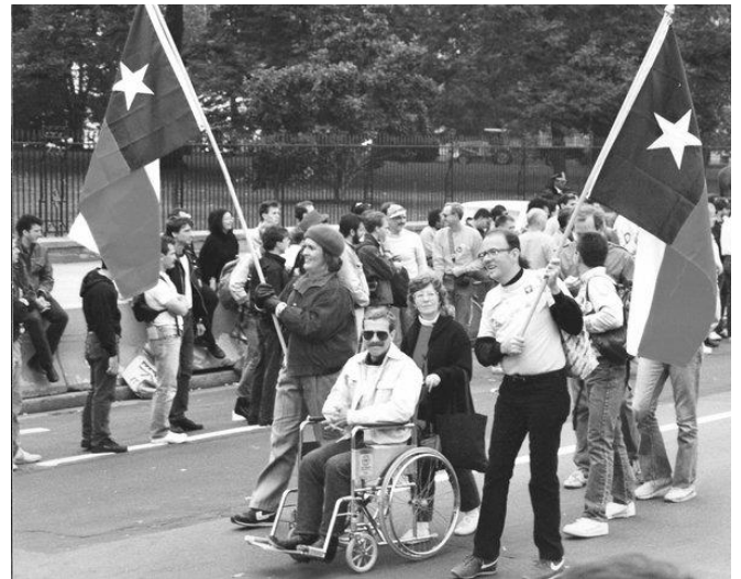
A march on Washington in the mid-1980s. The history of the transgender fight for civil rights and protections goes back for decades.

Like the mainstream gay movement, the transgender movement was initially dominated by white professionals. Their privilege shielded them from the harsher realities of extreme poverty and deadly violence encountered by many of their constituents. It also, some say, gave them an edge.