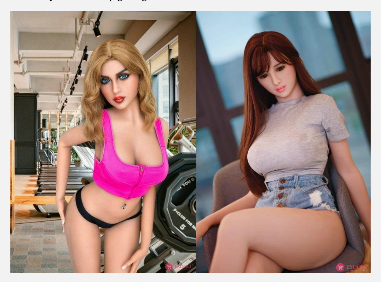
Steps to Purchase Affordable Sex Dolls

How to explain the pleasure of doing sex? It's simply can't be explained. Those you have real-life sexual partners are quite lucky as they can engage in consensual sexual activities at any time of the day. However, those who are still single and looking for love from their partners have nothing to worry as there are products available in the market which when used will relieve them of their boredom. Yes, you have the attractive <u>real love dolls for men</u> which can help you get rid of your boredom. In this context, it is relevant to add that the sex dolls are available in various shapes, sizes. Take a look at the web, use relevant keywords to search the web and you can end up getting a wide collection of attractive sex dolls.