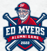
ALUMI GAME LOGO