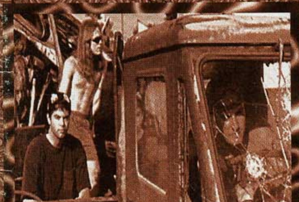
False Face Society