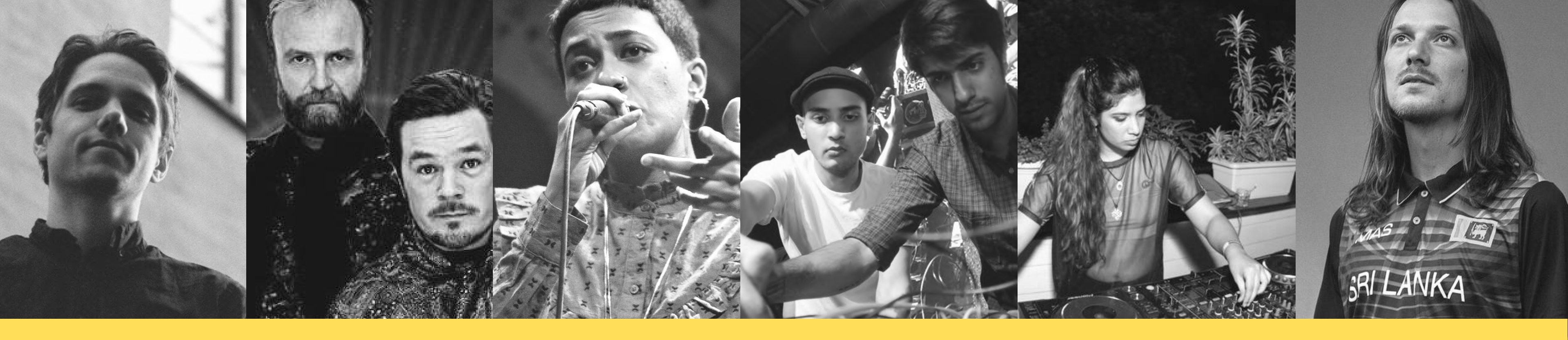
A motley group of artists from India and Norway merge into a first-of-it's-kind bi-lateral collaboration. A potent opportunity for artists and electronic music culture to transcend boundaries. Electronic music, a global idiom forms the basis to create new connections, opening up to new audiences and markets. Merge Emerge - 'mutually triggered music and empowerment'.