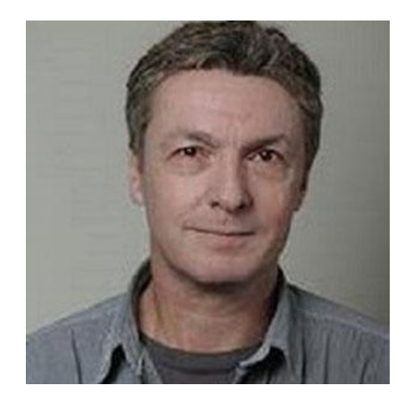
General Director MSF India