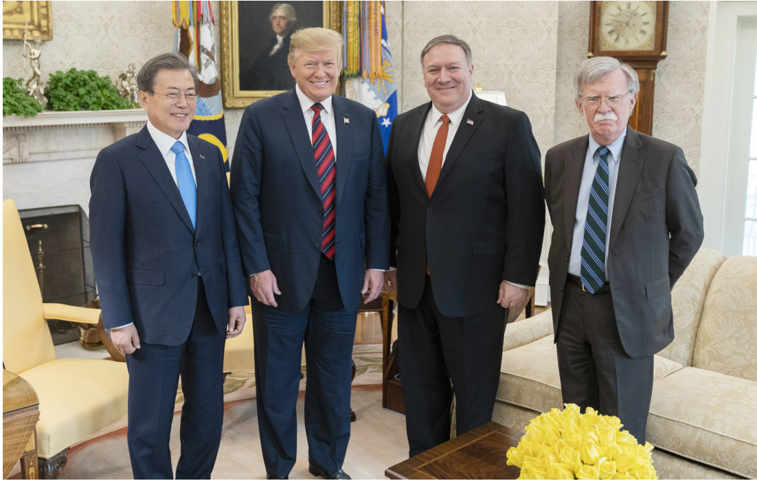
Trump's meeting with South Korean President Moon Jae-in, April 11, 2019, considered what to do next about North Korea's nuclear weapons and ballistic missile programs after two failed summits with Kim Jong-un.