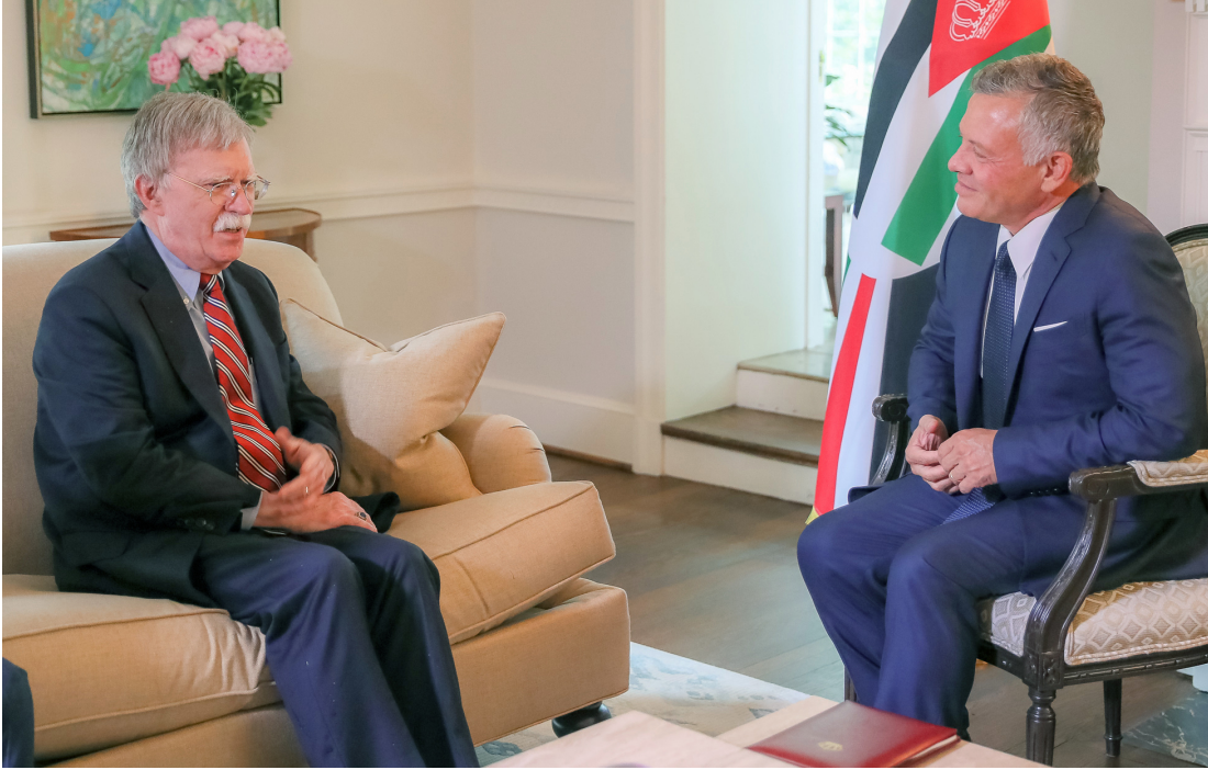
I met with King Abdullah at the residence of Jordan's Ambassador to Washington on June 22, 2018, just before the King's meeting with Trump to discuss the continuing crisis in Syria, and Iran's support for the Assad regime.