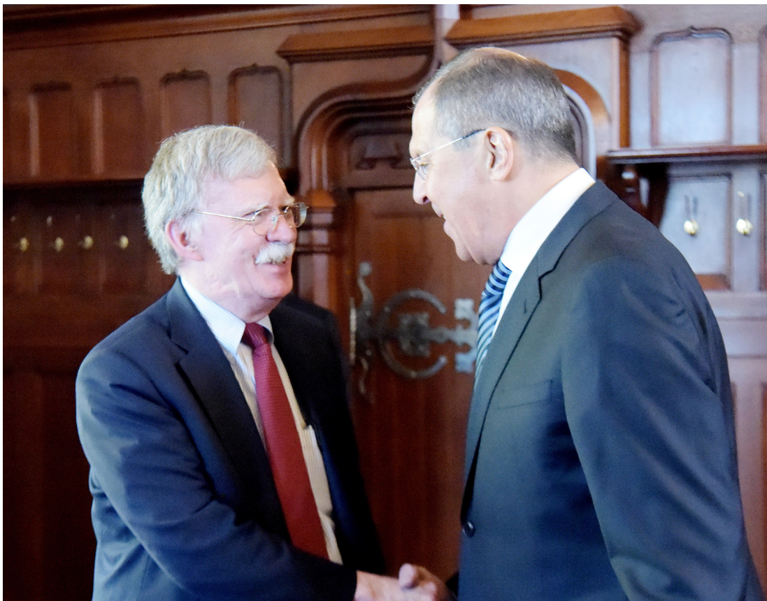
Getting together with Russian Foreign Minister Sergei Lavrov for lunch at Osobnyak House in Moscow on June 27, 2018, to prepare for the Trump-Putin meeting in Helsinki. Unfortunately, the summit ended in disarray when Trump appeared to cast doubt on US intelligence about Russian interference in our elections.