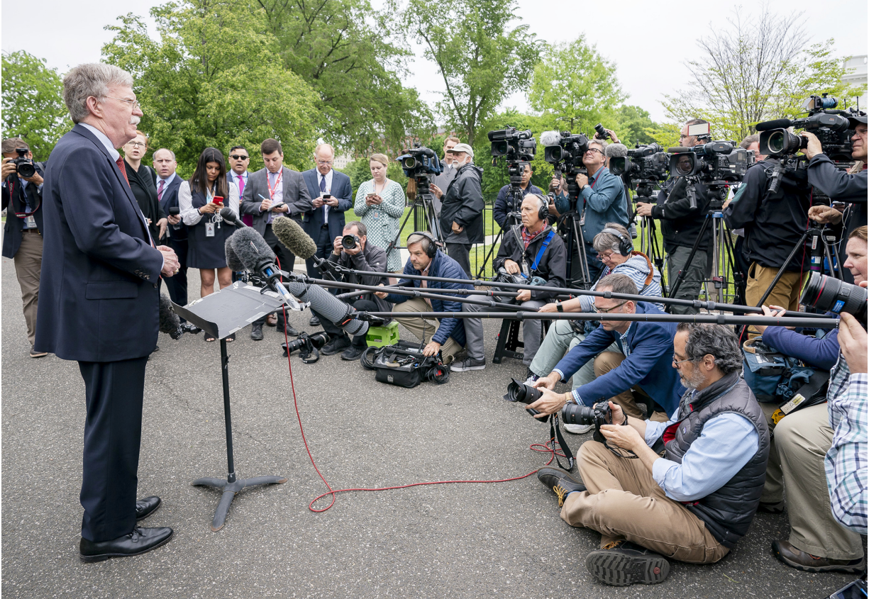
After a sad day for the people of Venezuela, I explained to the press outside the West Wing on May 1, 2019, how close the opposition to the Maduro regime had had come to ousting him.