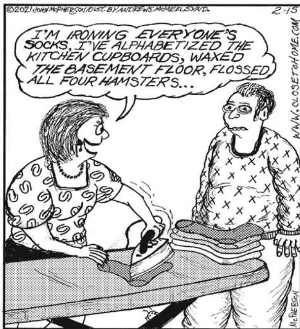
Carol succumbs to COVID burnout.