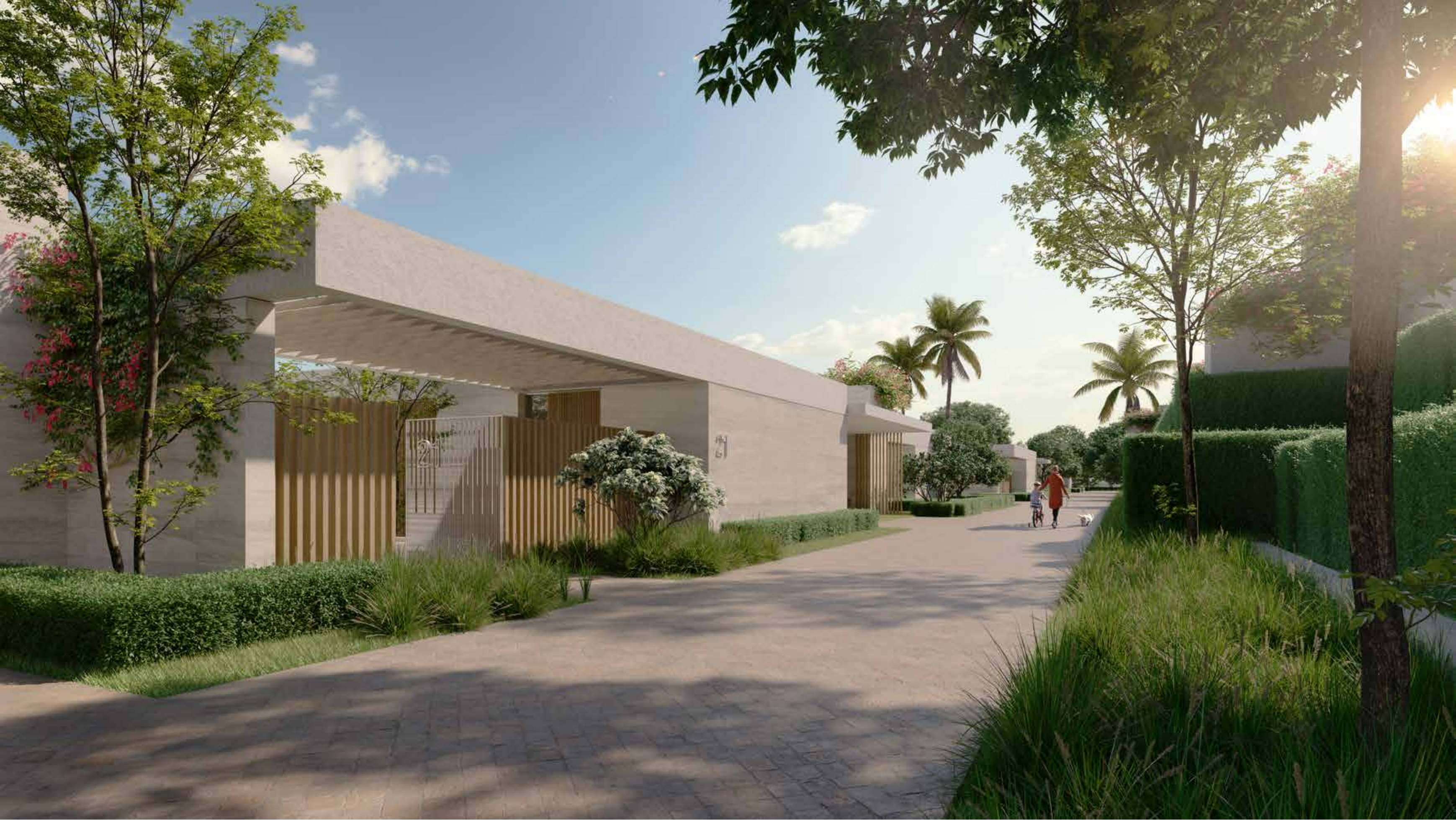
Planted verges alongside pedestrian-friendly roads lend a lush resort-style character to the beachfront community.