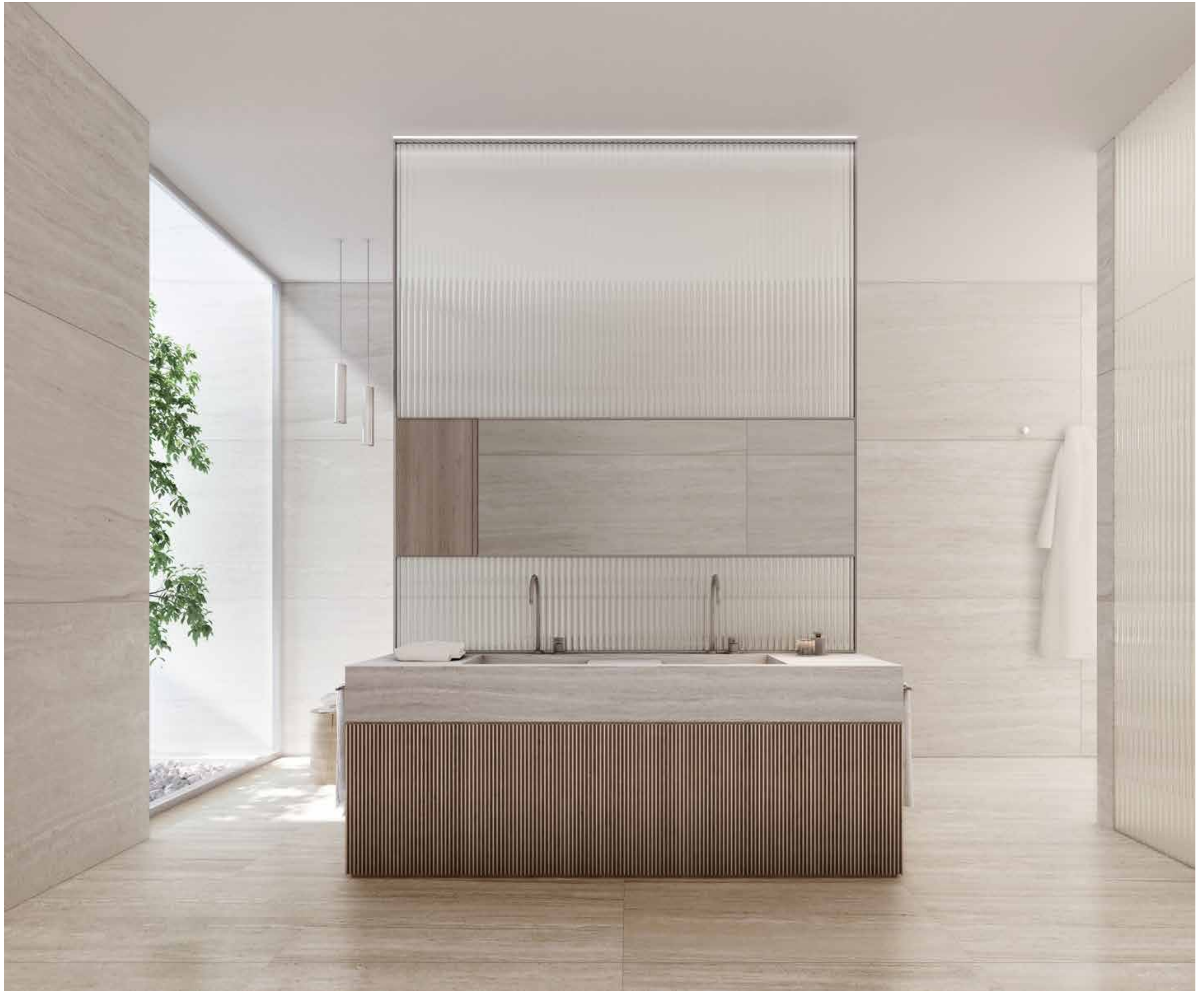
The neutral palette exudes a simple sophistication that highlights the luxurious finishing and ensures comfort and relaxation.