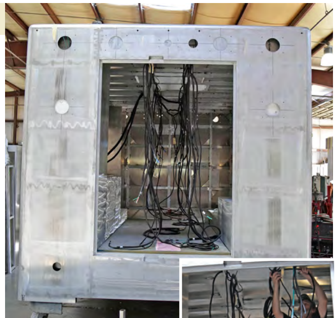
Excellence constructs a new mobile stroke unit.

Meanwhile, Excellence was developing a model for the Cleveland Clinic, which also hit the streets in 2014 (for more: EMSWorld.com/11569671 ), and Medical Coaches would do one for the University of Tennessee Health Science Center. Medical Coaches actually built the first mobile head scan CT unit for EMI Medical in the 1970s, and continued until EMI left the market ( seemedcoach.com/products/lithotripsy/ ). Canada's Tri-Star Industries is also soon to enter the game.