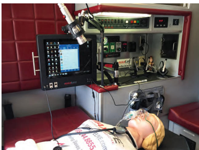
Max Life's advanced telemedicine system.

InTouch Health has been the telemedicine vendor for the Cleveland, Mercy and Colorado projects; its RP-Xpress is a portable device that uses standard 802.11 Wi-Fi. In Houston, UTHealth is using Max Life's system, which users can test at EMS World Expo, October 3-7 in New Orleans. ☼