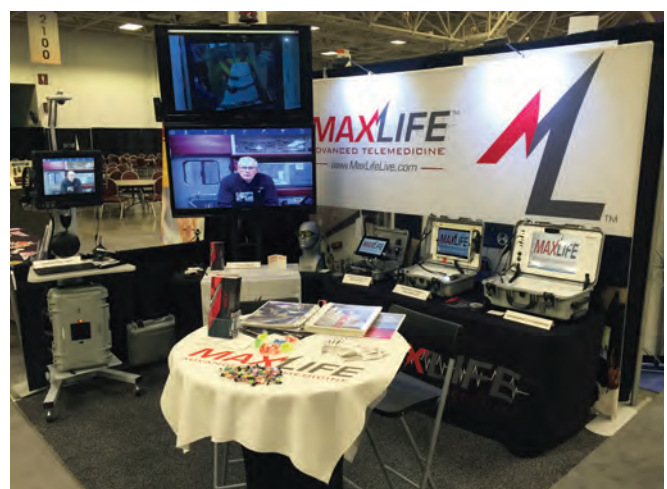
Max Life's telemedicine display.