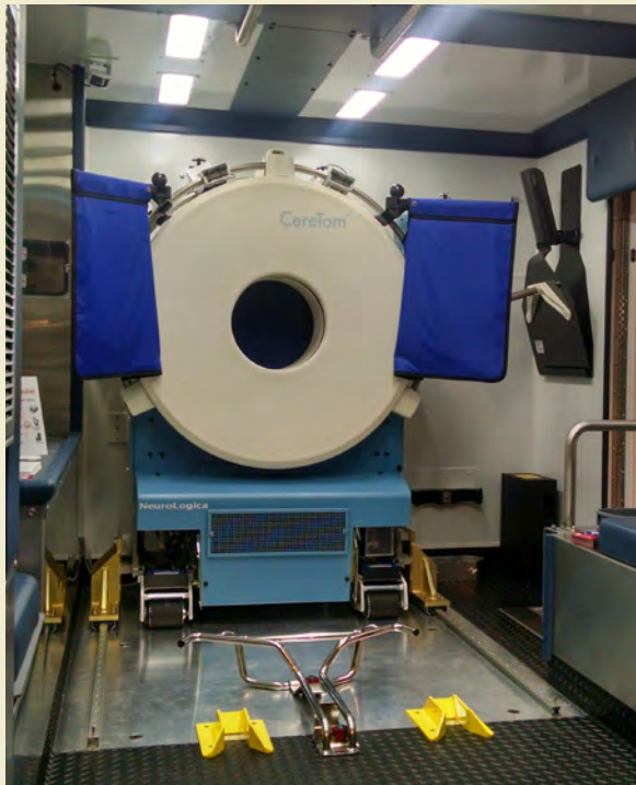
The Houston MSU's box includes a power source for the CT scanner.

The MSU is based out of the UTHealth Medical Center and embedded within the Houston 9-1-1 system. It is dispatched immediately if a stroke is suspected within an eight-mile radius of the hospital. If first responders suspect a stroke on a scene that's been dispatched as something else, they will add the MSU to the call. If the HFD